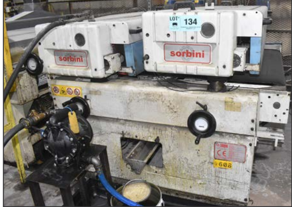
SORBINI 1/20 2MI roller coater