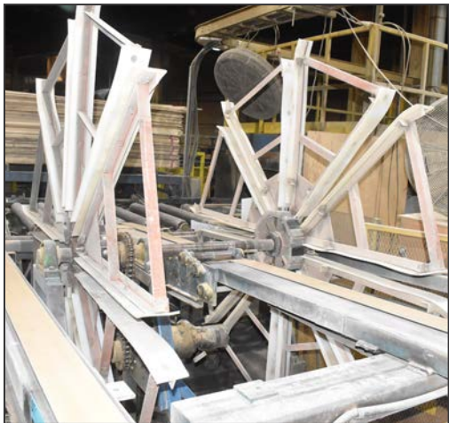
GLOBE 8 station pinwheel type rotator