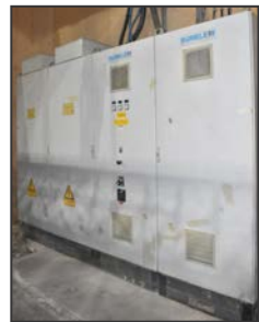
BURKLE PLC control panel