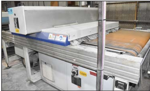
BURKLE UV2_1300 pass through type UV curing oven