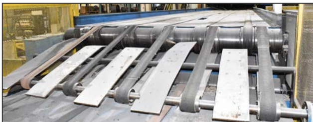
Lathe outfeed belt conveyor size - 120" x 96", 6 Belts