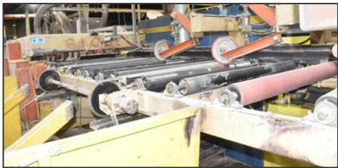
GLOBE 48" first pass saw