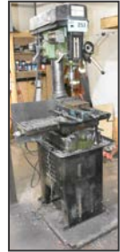
BUSY BEE gearhead drill