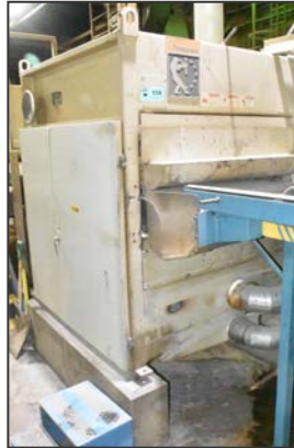
TIMESAVERS 452-5PBT (2) head pass through bottom sander