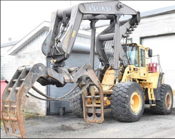
VOLVO L180E HIGH-LIFT wheel loader