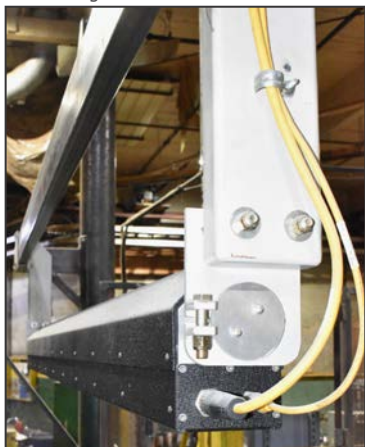
USNR veneer moisture scanner