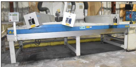
BURKLE TRU-V (3) station pass through UV curing oven