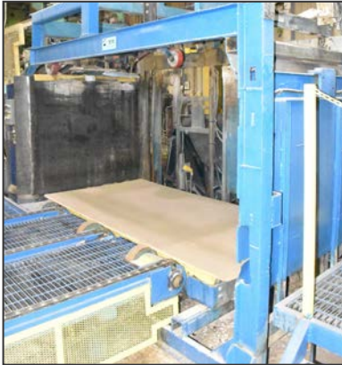
View of sanding line feeder system