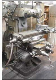
PARKSON universal mill