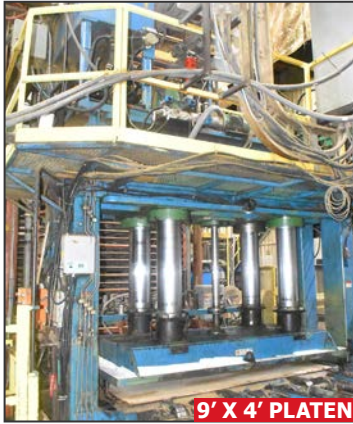
9' X 4' PLATEN