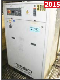
2015 NANO NRC1000 refrigerated air dryer