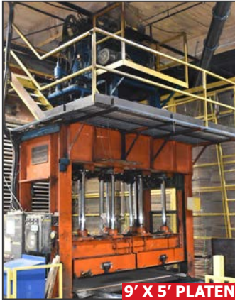
9' X 5' PLATEN

CARGATE WESTMINSTER hydraulic cold press