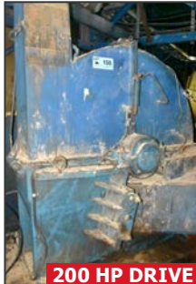
200 HP DRIVE FORANO 58" chipper