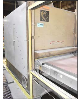
TIMESAVERS 452-5PBT (3) head top sander