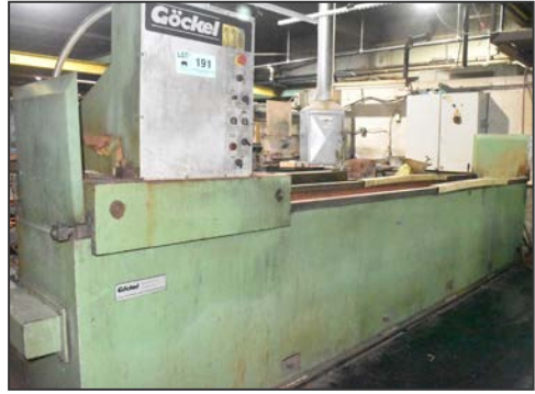
COCKEL G65RSEL knife grinder