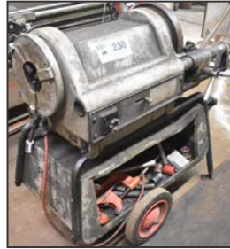
RIDGID pipe threader