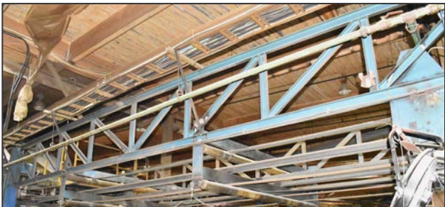
10' x 8' 7 belt stacking infeed conveyor