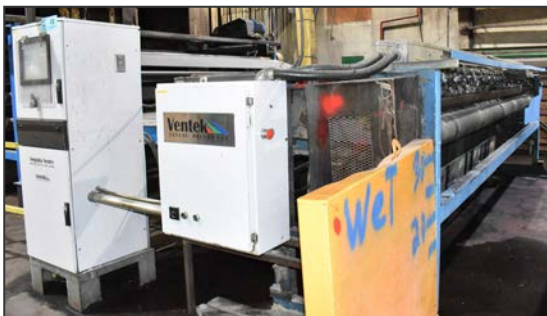
VENTEK SEQUIOIA SENTRA (18) sensor moisture detection system