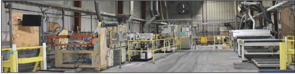
Overall view of SORBINI / BURKLE UV line