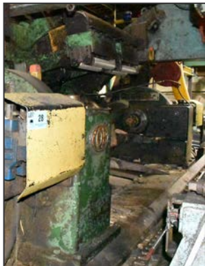
COE 263 96" veneer lathe