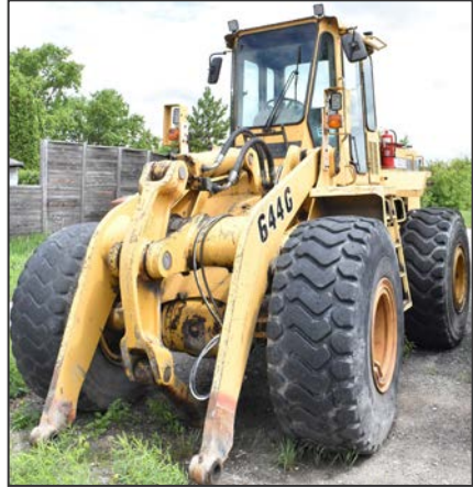
JOHN DEERE 644G wheel loader