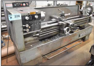
REPUBLIC - LAGUN engine lathe