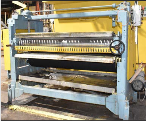
BLACKBROS 22D-1175 68" glue application roller