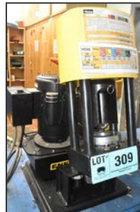
PARKER hydraulic line equipment