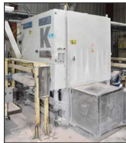
COSTA KACCT 1350 48" top side pass through sander