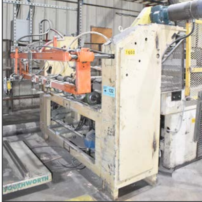
UV line feeder