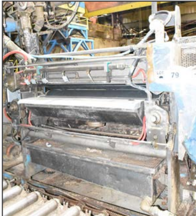
GLOBE 96" twin roll glue applicator

HASKO 126" X 67" (2) chain infeed conveyor; HASKO 30KG cap. vacuum sheet lifter; HASKO 8' X 54" roller conveyor with SYLVENT blower; LACKBROS 22D-1175 68" glue application roller s/n: 31656; 100" X 55" transfer conveyor with parts counter; Scissor lift table; 148" X 48" roller conveyor; CARGATE WESTMINSTER hyd. cold press with 9' X 5' platen; 10' X 5' veneer hot press infeed system; DURAND 24 platen veneer hot press with 114" X 54" platens; DURAND veneer press outfeed system; DURAND semi-automatic outfeed unit with scissor lift and 6' X 2' roller conveyor s/n: 7903; Hydraulic power pack