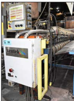
VENTEK 18 station moisture detection system