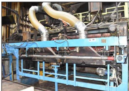
COE 8' rotary hydraulic 3 station feeder