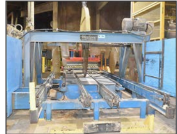
WESTERN MACHINERY 72" fishtail saw