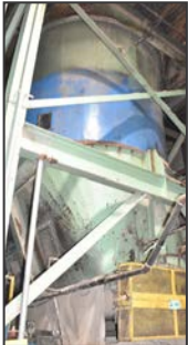
25' chip waste bin