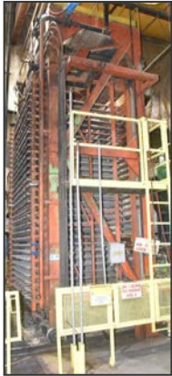
DURAND-RAUTE 30 platen hot press