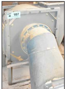
View of chip / dust waste equipment