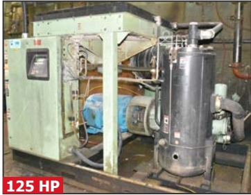
125 HP SULLAIR air compressor