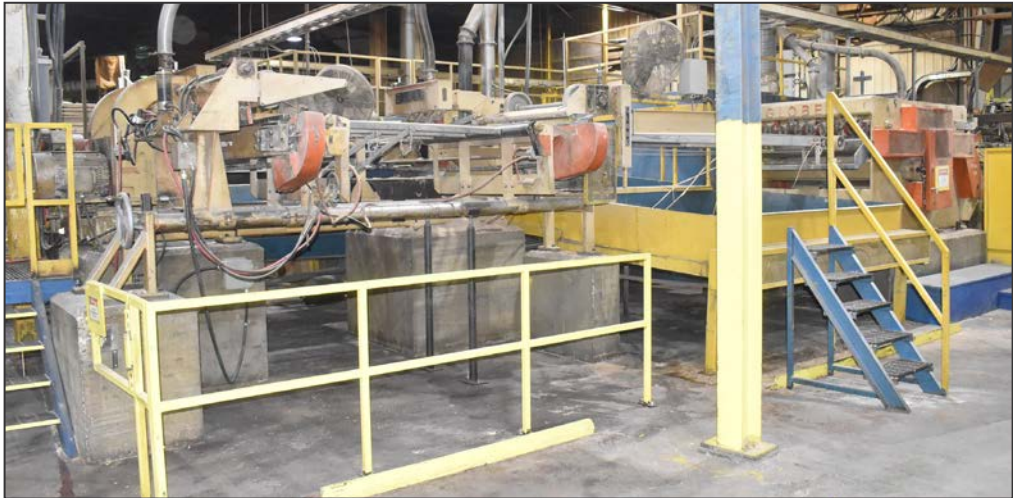
Overall view of globe trim saw line