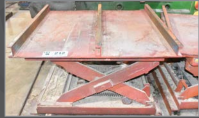
Partial view of scissor lifts available