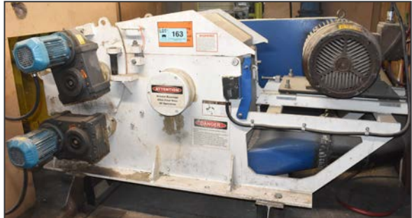
VEVOPLAN 50HP chipper

CONTACT 416.962.9600 TO CONSIGN EQUIPMENT AT AN UPCOMING AUCTION