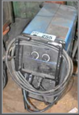
MILLER digital MIG welder

Thursday, August 6 Bolton, Ontario, Canada