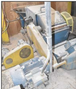
View of chip / dust waste equipment