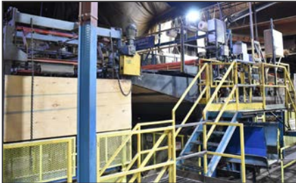
DURAND-RAUTE 8' veneer composer