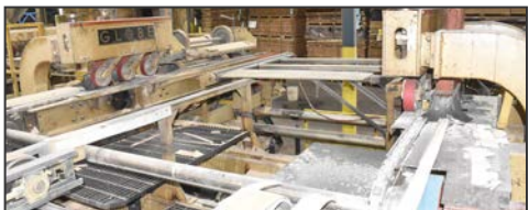
GLOBE SECOND PASS 96" double trim saw