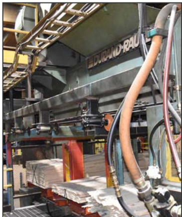
DURAND-RAUTE 3 Section automatic stacker w/ outfeed roller system