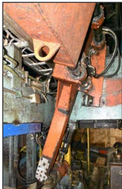
DURAND-RAUTE hydraulic lathe charger