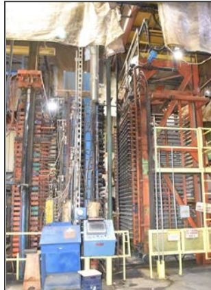
DURAND veneer press outfeed system