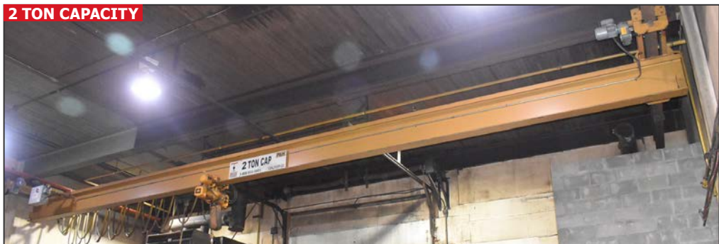
P&H overhead bridge crane

TO SCHEDULE AN AUCTION CONTACT 416.962.9600