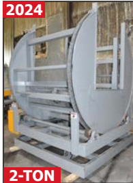
2024 2-TON WUXI FZ-BP-02 up-ender