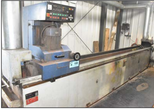
REFORM TYPE 5 122" knife grinder