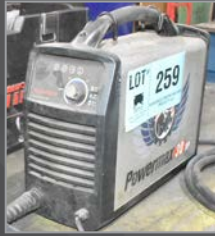
HYPERTHERM POWERMAX 30XP plasma cutter