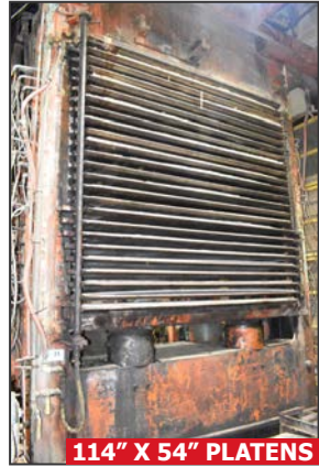
114" X 54" PLATENS

CARGATE WESTMINSTER hydraulic cold press