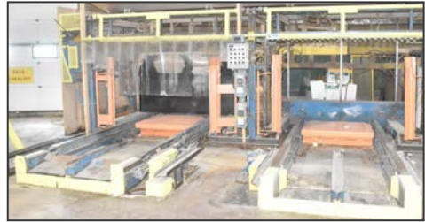
View of DURAND panel stacking outfeed system