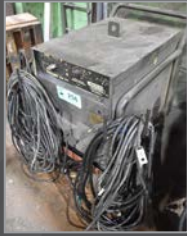
LINCOLN ELECTRIC IDEALARC welder