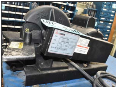
CURTIS hydraulic line equipment

10' X 7' (2) infeed conveyor with scissor lift table and (1) pneumatic suction cup lifter; 148" X 38" putty application belt conveyor; Scissor lift table, hydraulic up-ender, scissor lift table; 148" X 38" putty application belt conveyor; Outfeed system consisting of 18' X 48" (2) chain conveyor and (1) pneumatic suction cup lifter; Controls and PLC cabinet