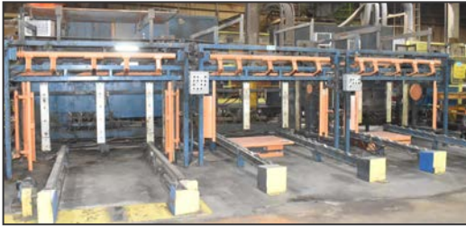
View of DURAND panel stacking outfeed system