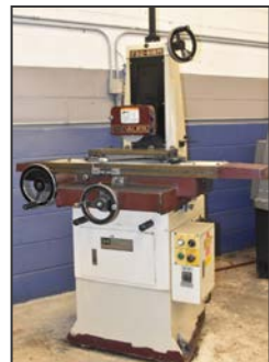
CHEVALIER FSG-618M surface grinder