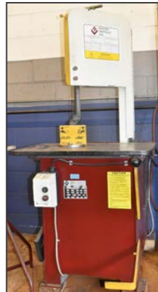
BAXTER MODEL 1153 VERTICUT band saw