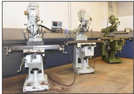
View of vertical turret milling machines