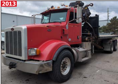
PETERBILT 367 T/A tandem-axle roll-off crane truck