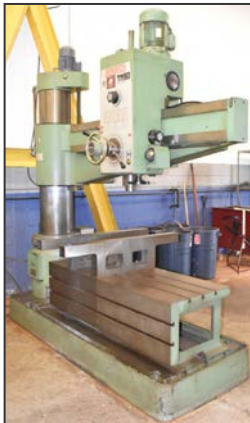
BERGONZI TM50 5' radial arm drill