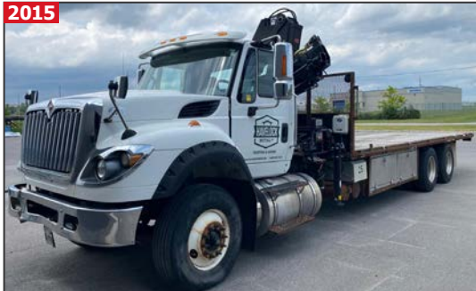
INTERNATIONAL 7600 SBA 6X4 tandem-axle flat deck crane truck