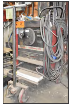
LINCOLN ELECTRIC 250 ARC welder