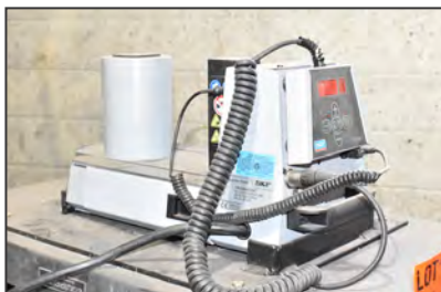
SKF TIH 030M RC induction bearing heater