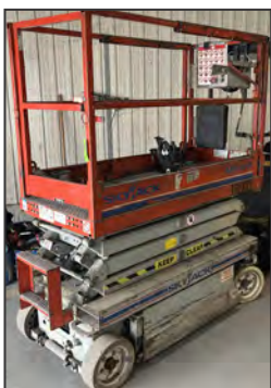
SKYJACK SJI3-3219 24V electric scissor lift