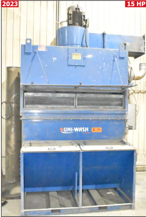
UNI-WASH UC-50 cyclone washer