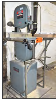
KING INDUSTRIAL KC-1433FXR bandsaw