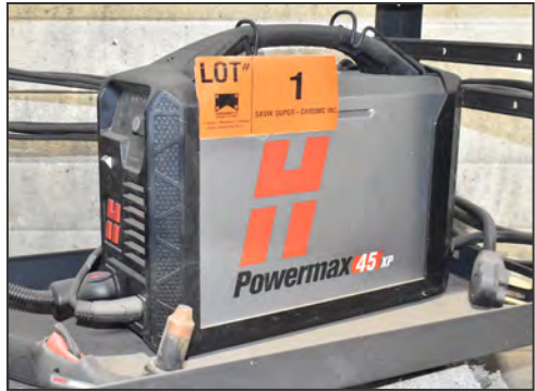
HYPERTHERM POWERMAX 45XP plasma cutter