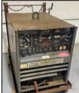
LINCOLN ELECTRIC power source