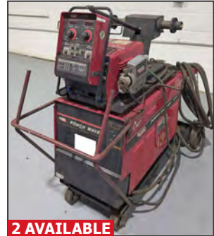
LINCOLN ELECTRIC POWER WAVE 455/STT MIG welder