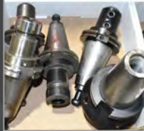
Partial view of CAT 50 tool holders available