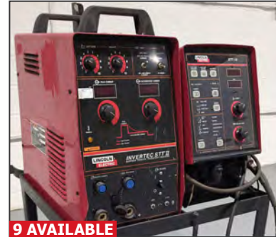
LINCOLN ELECTRIC INVERTEC STTII surface tension transfer process digital MIG welder