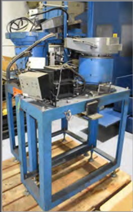
NTN N25 vibratory bowl feeders