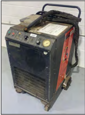
HYPERTHERM MAX 100 portable plasma cutter