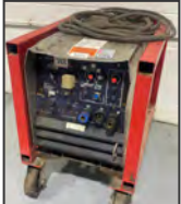
RED-D-ARC E300 power source