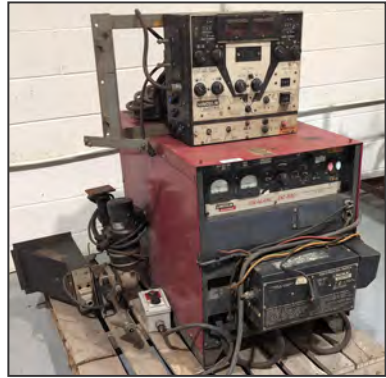
LINCOLN ELECTRIC IDEALARC DC-600 sub-arc welder