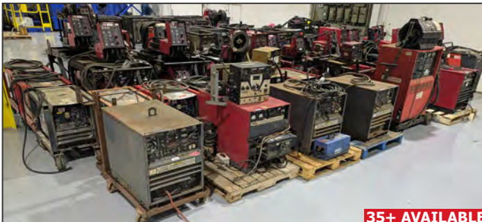
Partial view of welders available