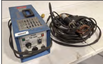
AGM LS-400 stud welder