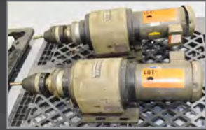
TAUMEL T626M modular orbital head forming riveters