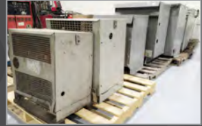
Partial view of transformers available