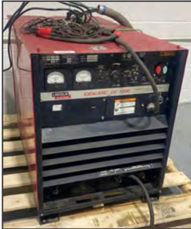
LINCOLN ELECTRIC IDEALARC DC-1000 welding power source