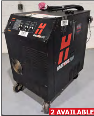
HYPERTHERM MAXPRO 200 plasma cutter power source