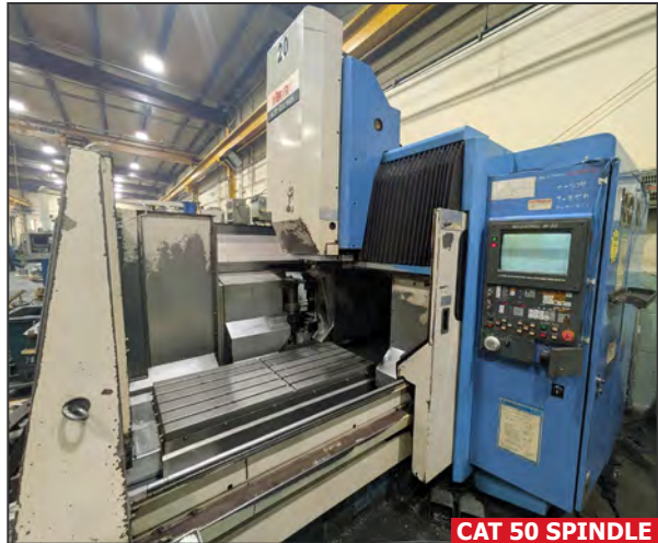
MATSUURA VX-1000 MAXIA 5-axis CNC high speed vertical machining center