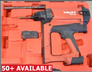
50+ AVAILABLE Partial view of HILTI power tools