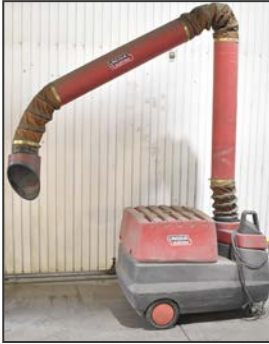
LINCOLN ELECTRIC 200-M portable fume extractor snorkel