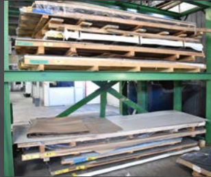
Partial view of metal stock available