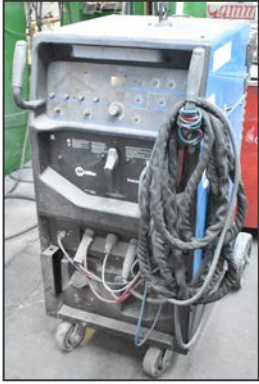
MILLER SYNCROWAVE 250DX digital TIG welder