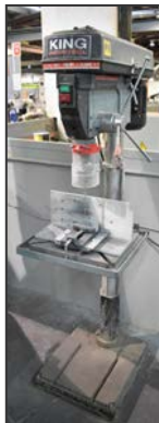
KING pedestal type drill press