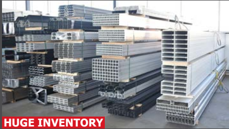
HUGE INVENTORY Partial view of metal stock available