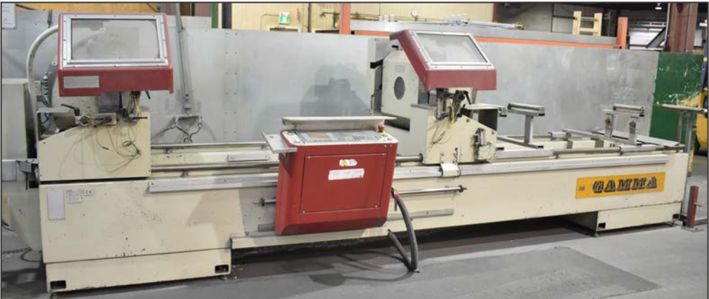
LGF SWDIG double head aluminum saw