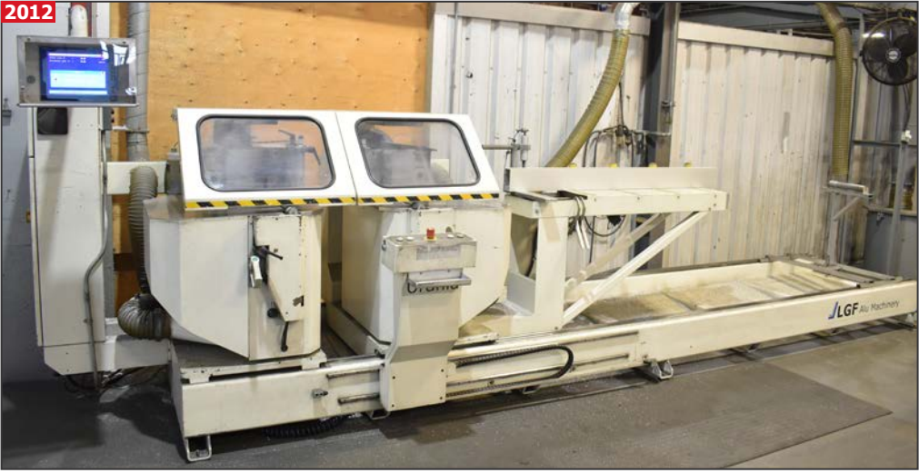
LGF URANIA CNC double head aluminum saw