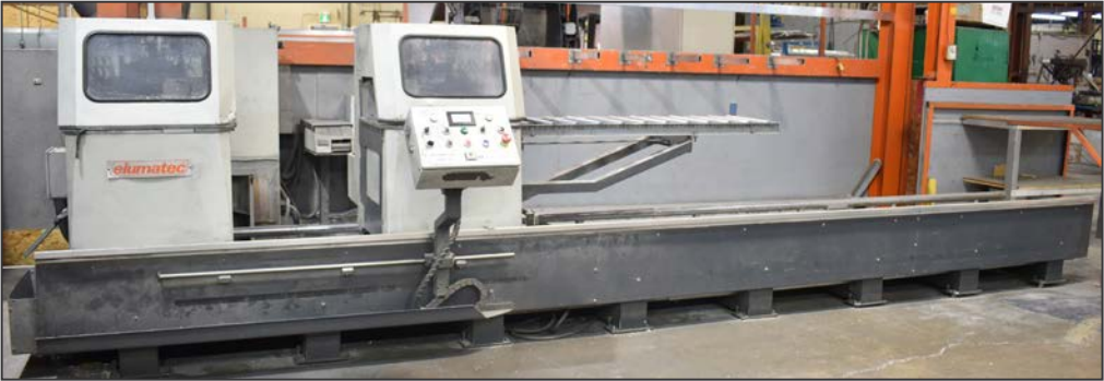
ELUMATEC DG142/01 double head aluminum saw