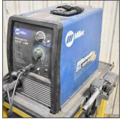
MILLER MILLERMATIC 211 TIG welder