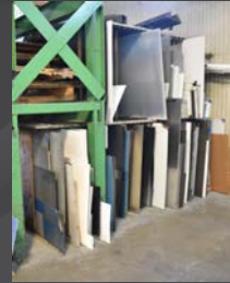
Partial view of metal stock available