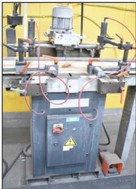
ELUMATEC AS70/44 router