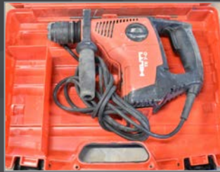
Partial view of HILTI power tools