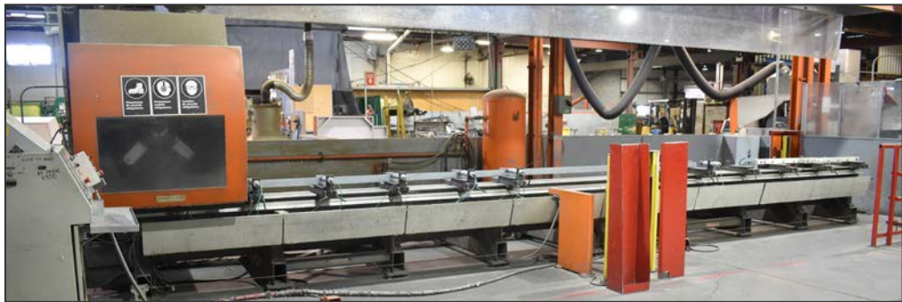
ELUMATEC SBZ130 3-axis CNC profile machining center