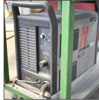
HYPERTHERM POWERMAX 1000 G3 plasma cutter