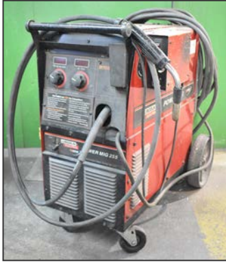
LINCOLN ELECTRIC POWERMIG 255 digital MIG welder