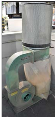
GENERAL bag type dust collector