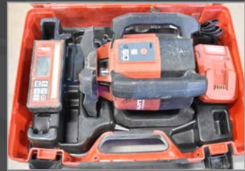
Partial view of HILTI power tools

ALSO: Huge inventory of aluminum stock, glass panels, large quantity of brand name power tools including HILTI concrete drills, nail guns, epoxy guns, ramset guns, grinders, transits, MILWAUKEE, DEWALT and MAKITA cordless tools consisting of drills, impact guns, grinders, circular saws, reciprocating saws. (50+) GREENLEE portable job boxes, perishable tooling included concrete drills and grinding discs, welding supplies, safety equipment, toolboxes, work benches, fire proof cabinets, storage cabinets, glass panel carts and MUCH MORE!