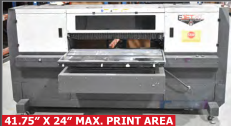
41.75" X 24" MAX. PRINT AREA

ENGINEERED PRINTING SOLUTIONS FJETXL industrial flatbed colour inkjet printer