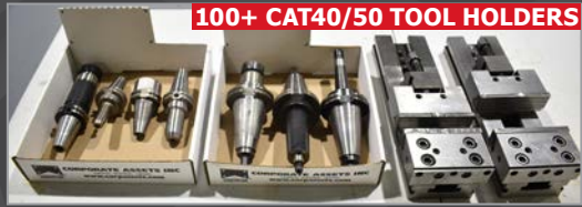
Partial view of CAT tooling and machine vises available