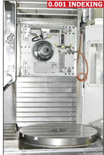
View of HAAS table

CONTACT 416.962.9600 TO CONSIGN EQUIPMENT AT AN UPCOMING AUCTION