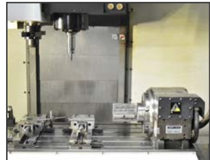
View of DMG MORI table