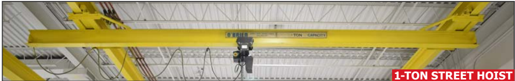
1-TON STREET HOIST