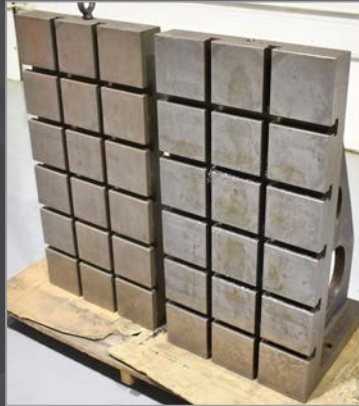
Partial view of angle plates available