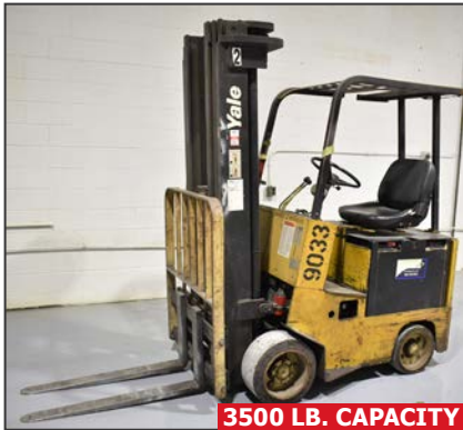
3500 LB. CAPACITY

YALE FR0040JAN36S0092.5 36V electric forklift