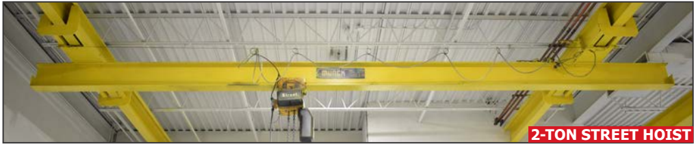
2-TON STREET HOIST