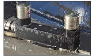
View of MATSUURA interior