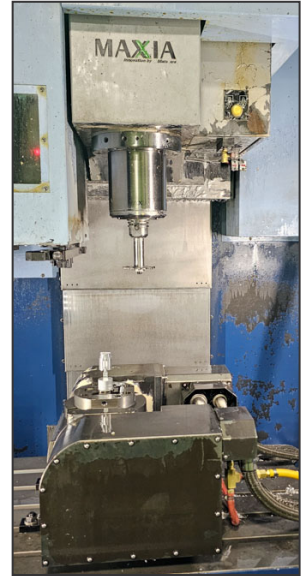
View of MATSUURA table