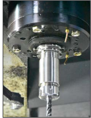
View of DMG MORI spindle