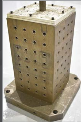
View of tombstones available