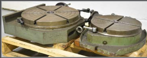
Partial view of rotary tables available