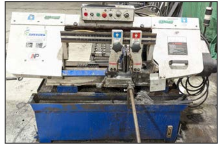
SPEEDER FHBS-250 horizontal band saw