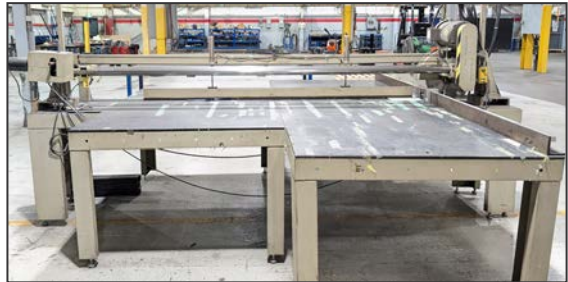
HENDRICK MFG CORP horizontal panel saw