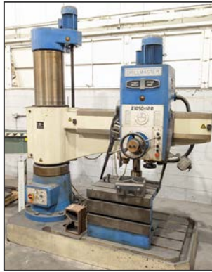
ZJ DRILLMASTER 23050X12(II) 5' radial arm drill