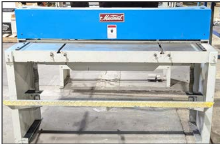
MAXIMART 0-5216 conventional foot shear