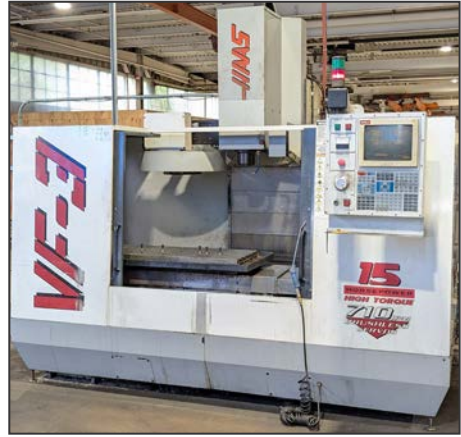
HAAS VF-3 CNC vertical machining center