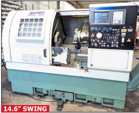
TOPPER TNL-100A CNC turning center