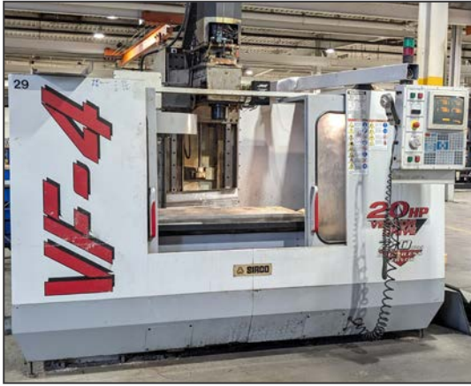
HAAS VF-4 CNC vertical machining center