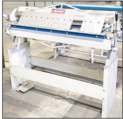
MAXIMART NU-4816 conventional box & pan brake