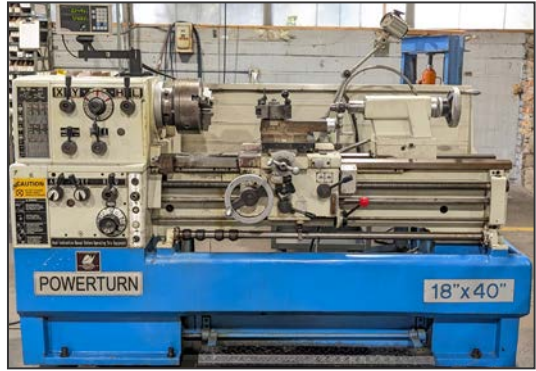
POWERMASTER POWERTURN C6246X1000 gap bed engine lathe