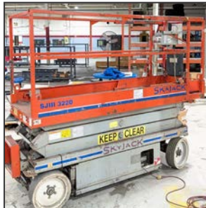
SKYJACK SJ III 3220 electric scissor lift