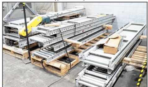
Large selection of HYTROL roller conveyors