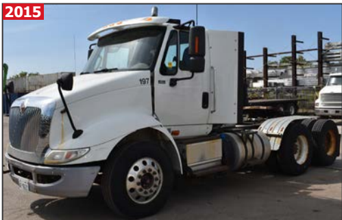
INTERNATIONAL 8600SBA tractor