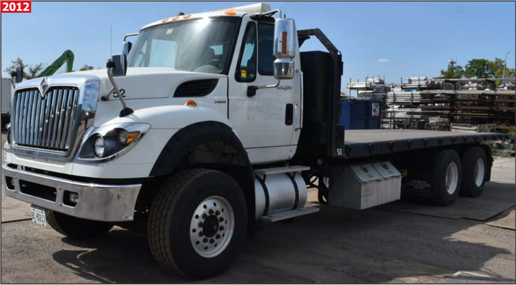
INTERNATIONAL 7600SBA tilt 'n' load truck