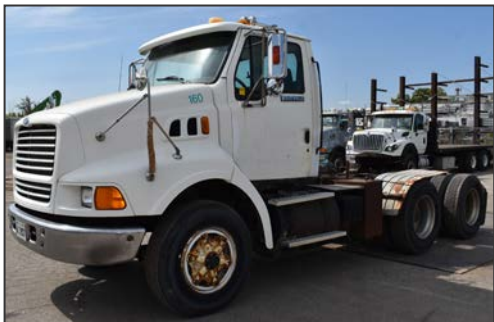
FORD LOUISVILLE COH tractor