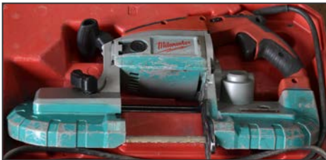
Partial view of power tools available