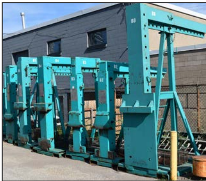
Huge selection of forklift boom lifting attachments

FORD (1997) LOUISVILLE COH tractor with CATERPILLAR C-12 405 HP diesel engine, EATON FULLER 8-speed manual transmission, 20,000 LBS axles, power 5th wheel slide, 463,879 KM (at time of listing), VIN 1FT4S96MXVVA33495 (UNIT 160)