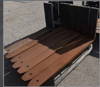
Partial view of spare forks available

ALSO: HUGE SELECTION of portable gantry systems up to 10 TON capacity; hydraulic jacks up to 50 TON capacity; CM chain falls up to 10 TON capacity; shackles up to 100 TON capacity; machinery dollies; nylon lifting slings; job boxes; DOMSON forklift boom attachments; spreader beams; swivel eye-bolts; pallet jacks; machinery stands; fork extensions; forklift tires; forks up to 8'; spare forklift parts; die lift carts; electric & pneumatic power tools; sockets up to 1-1/2" drive; hand tools; steel plate/materials & MUCH MORE!