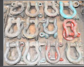
Partial view of shackles up to 100 TON capacity available