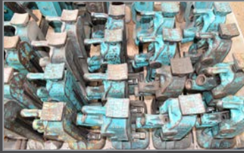
Partial view of machinery jacks available