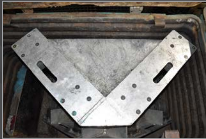
Partial view of machinery dollies available