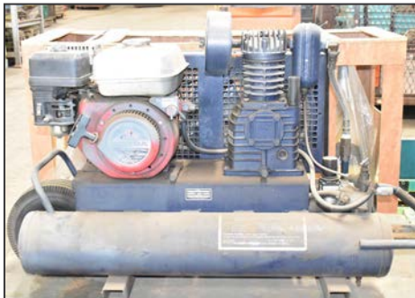
MFG UNKNOWN portable air compressor