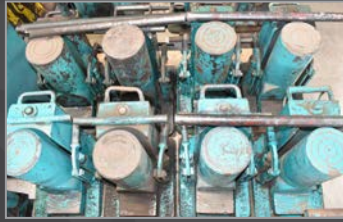
Partial view of machinery jacks available