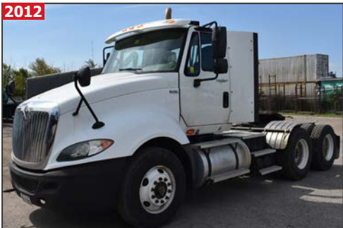
INTERNATIONAL PROSTAR tractor