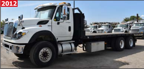
INTERNATIONAL 7600SBA tilt 'n' load truck