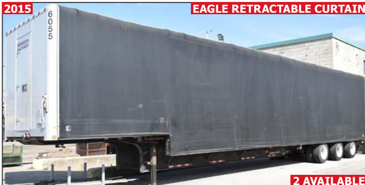
EAGLE RETRACTABLE CURTAIN