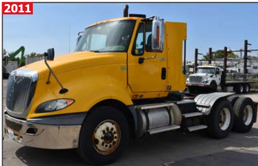
INTERNATIONAL PROSTAR tractor