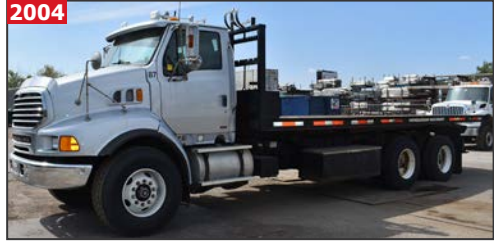
STERLING tilt 'n' load truck