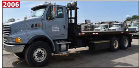
STERLING tilt 'n' load truck