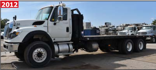
INTERNATIONAL 7600SBA tilt 'n' load truck