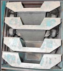
Partial view of machinery dollies available