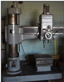
HAVLIK Z3035B 5' radial arm drill