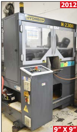
2012 HYDMECH H-230A automatic horizontal band saw