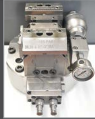
Hydraulic precision 5-axis machine vise