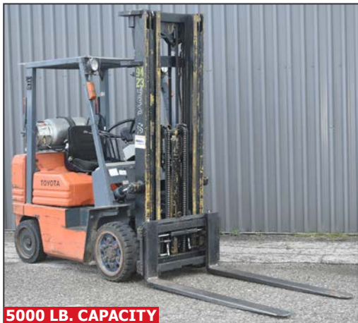
5000 LB. CAPACITY TOYOTA 5FGCU25 LPG forklift