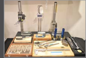
Partial view of inspection equipment available

ALSO: MACHINE TOOL ACCESSORIES FEATURING (5+) precision 5-axis machine vises, (10+) name brand machine vises, indexing tables, precision set up blocks; CNC TOOLING including (100+) CAT40 tool holders & heat shrink tool holders; HUGE QUANTITY of high end perishable tooling consisting of carbide insert face mills, carbide insert boring bars, offset carbide insert boring bars, carbide and HSS endmills, high speed carbide and HSS drills, reamers, taps, dies; shop support tools such as 10" abrasive chop saws, pedestal grinders, bench grinders, circular sanders, belt sanders; power tools including cordless drills and impact guns, pneumatic power tools; INSPECTION EQUIPMENT including granite surface tables, digital height gauges, vernier calipers, outside & inside micrometer sets, bore gauges; butcher block shop tables, shop cabinets and MUCH MORE!