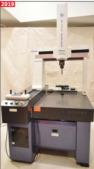
MITUTOYO CRYSTAL-APEX S574 CMM