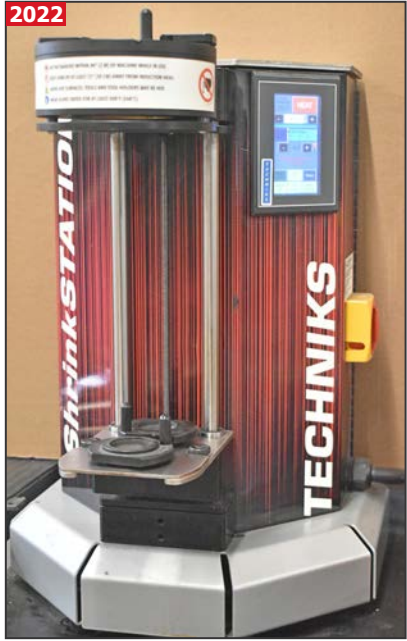
TECHNIKS 450 heat shrink tooling pre-setter