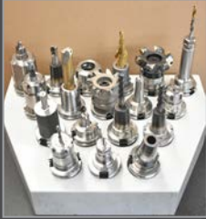
Partial view of CAT 40 tool holder available

Wednesday, October 22 Guelph, Ontario, Canada