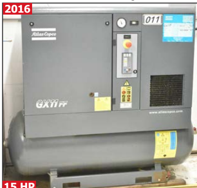
2016 15 HP ATLAS COPCO GX11FF rotary screw air compressor