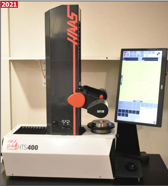
HAAS TS400 CAT40/BT40 tool pre-setter