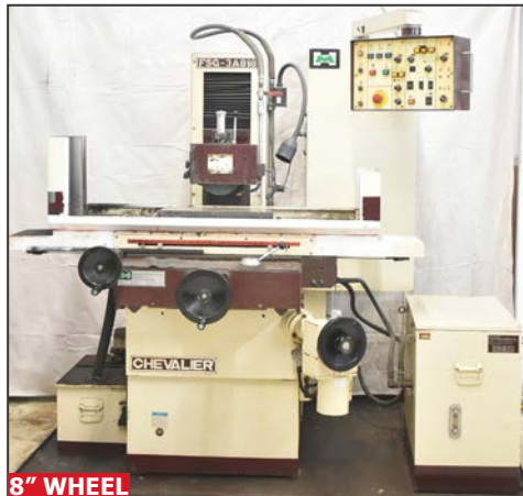
8" WHEEL CHEVALIER FSG-3A818 automatic precision hydraulic surface grinder