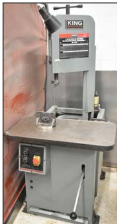
KING KC914H 14" vertical band saw