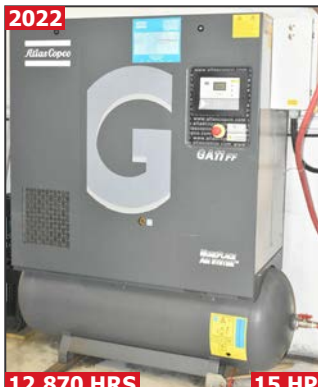
2022 12,870 HRS 15 HP ATLAS COPCO GA11FF rotary screw air compressor