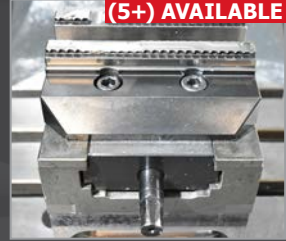
Precision 5-axis machine vise