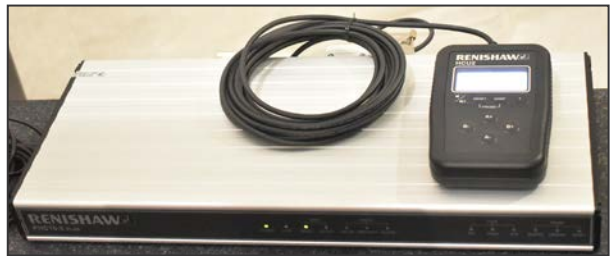
RENISHAW PH10-3 PLUS probe head controller & HCU2 hand control unit