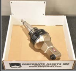
GERARDI-PARLEC F90-07 ATC CAT40 milling head