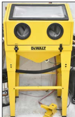
DEWALT sand blast cabinet