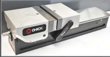
CHICK ONELOK precision machine vise