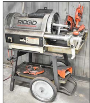
RIDGID MODEL 1224 portable pipe threader