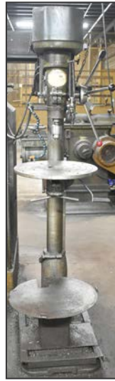
FIRST LC-25A floor-type drill press