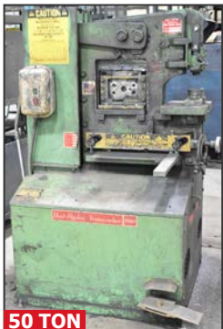
50 TON UNI-HYDRO MODEL 50-14 mechanical iron worker