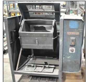
RAMPE V4-1 rotary drum tumbler