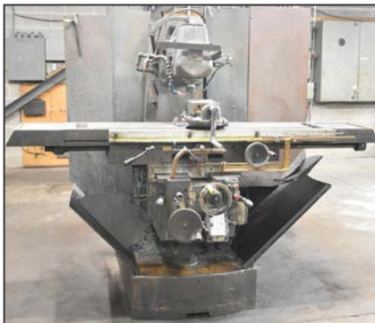
FEXAC MODEL UG universal milling machine