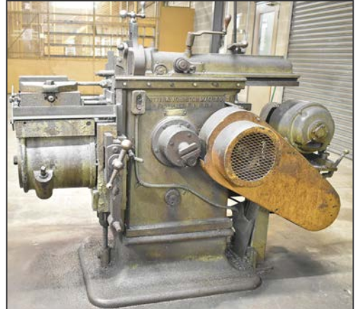
POTTER & JOHNSON 15" universal shaper