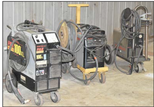
Partial view of portable plasma cutters available