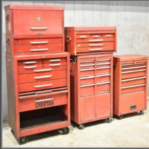
Partial view of rolling tool boxes available