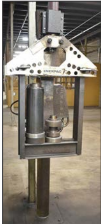
ENERPAC hydraulic press/bender