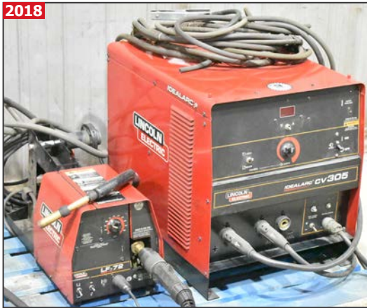
LINCOLN ELECTRIC IDEALARC CV305 MIG welder with LINCOLN ELECTRIC LF-72 wire feeder