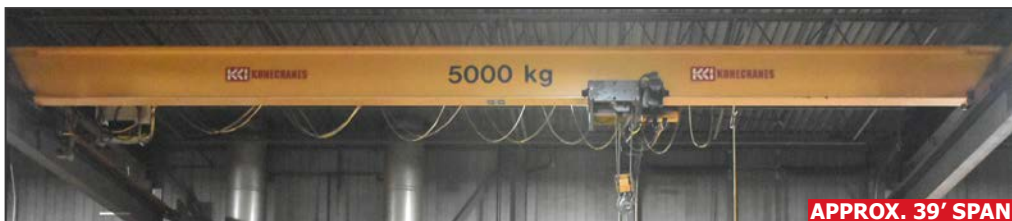
KONECRANES 5000 kg. capacity single girder top-running overhead bridge crane