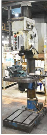
MIC Z5040 vertical gear head drill