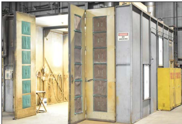
ATLANTIC INTERNATIONAL 17'x20'x12'H downdraft paint booth