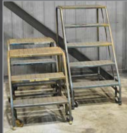
Partial view of support equipment available