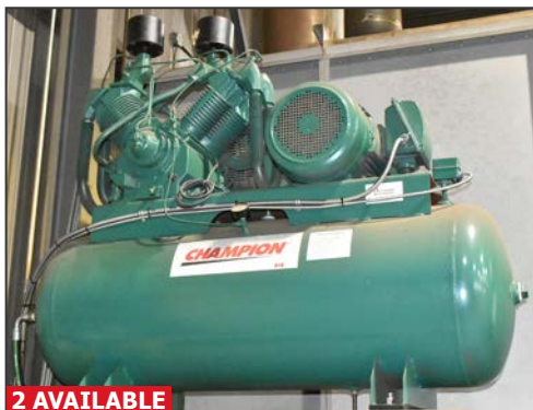
CHAMPION 25 HP tank-mounted air compressor