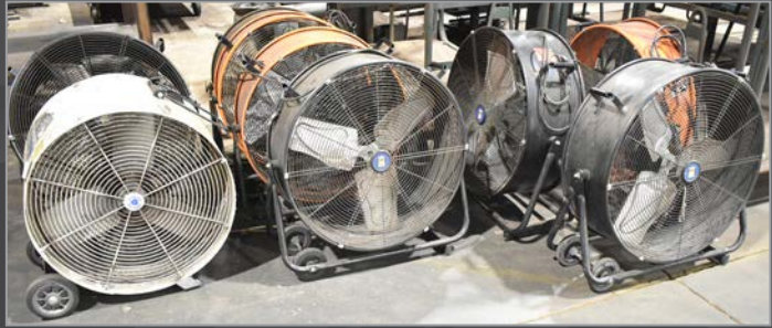
Partial view of shop fans available