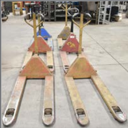
Partial view of pallet jacks available