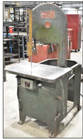
K&K ROLL-A-WAY vertical roll-in band saw