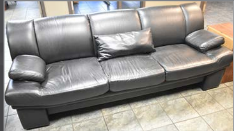
Partial view of furniture available

ALSO: (5+) hydraulic pallet jacks; pedestal & bench grinders; rolling toolboxes; (2) LINCOLN ELECTRIC IDEALARC 250 stick welders; shop fans; saw horses; FIREPROOF cabinets; hand tools; welding consumables; rolling shop ladders; work benches; shop carts; steel shelving & MUCH MORE!