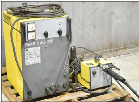
ESAB LAG 315 MIG welder with ESAB A10-MEC wire feeder