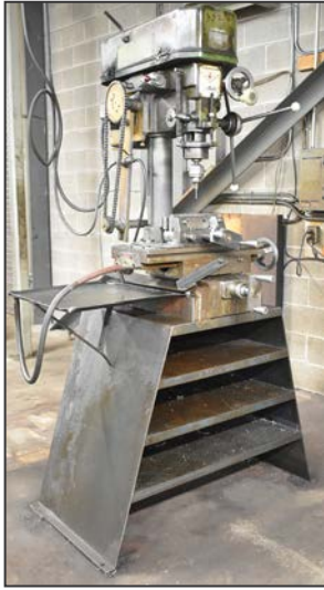
FIRST LC-30A bench-type drilling & milling machine