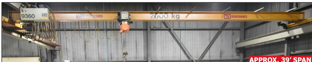
KONECRANES 2000 kg. capacity single girder top-running overhead bridge crane