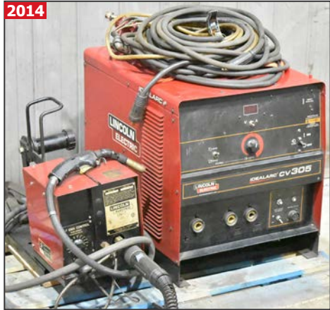
LINCOLN ELECTRIC IDEALARC CV305 MIG welder with LINCOLN ELECTRIC LN-7 wire feeder