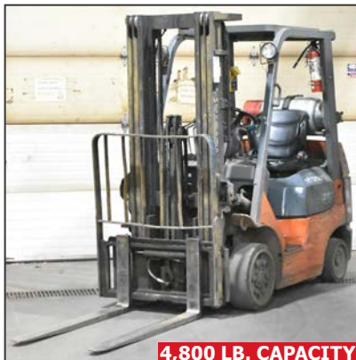
TOYOTA 7FGCU25 LPG forklift