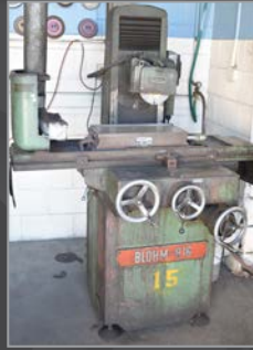
BLOHM 816 surface grinder