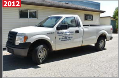
2012 FORD F150 pick up truck

ALSO: HUGE inventory of machine tool accessories including name brand KIRK 6" vises, tomb stones, indexing head, rotary tables, lathe chucks, LARGE quantity of tooling consisting of CAT40 and BT40 tool holders, collets, carbide, carbide insert boring bars, carbide and non carbide end mills, reamers, taps, drill, face mills, power tools, hand tools, butcher block work benches, work benches, cabinets, shelving, ferrous and non ferrous materials and MUCH MORE!