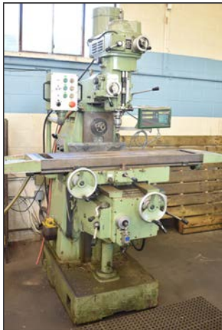
DAH-LIH DL-GH950 universal mill