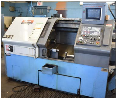
MAZAK QUICKTURN 20 CNC turning center