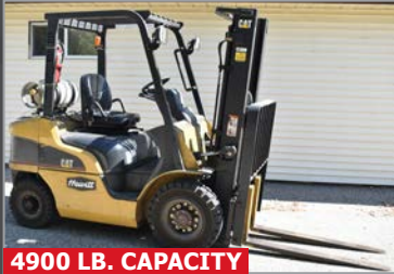
4900 LB. CAPACITY CAT P5000 LPG outdoor forklift