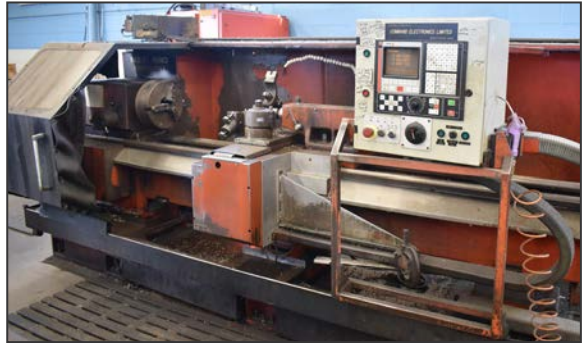
GILDEMEISTER N.E.F 480 CNC lathe