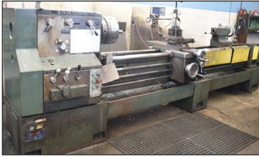
TARNOW X3000 gap bed engine lathe