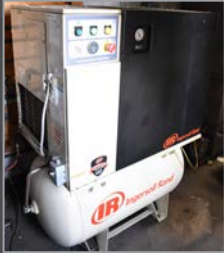
INGERSOLL RAND air compressor