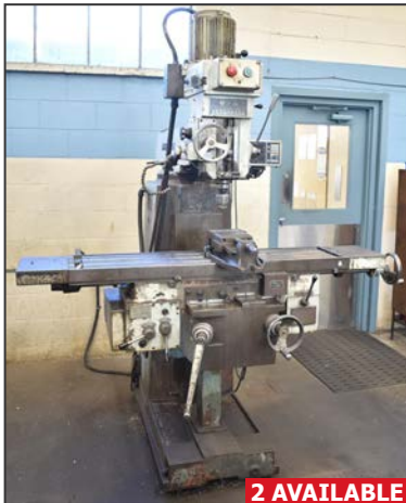
TOS FINESSA FNK25 vertical mills