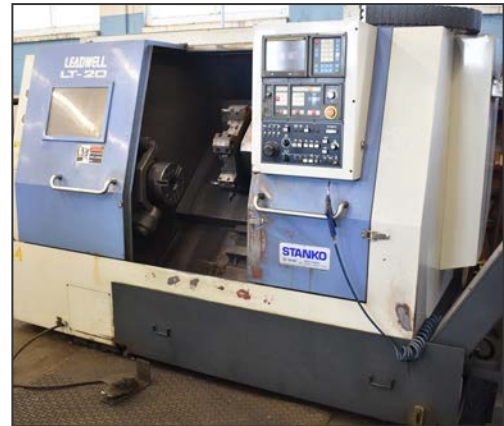
LEADWELL LT20 CNC turning center