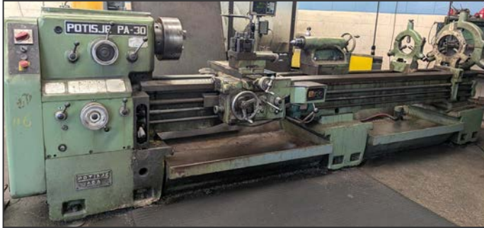
POTISJE PA30 gap bed engine lathe