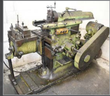
BUTLER 16/18 crank shaper