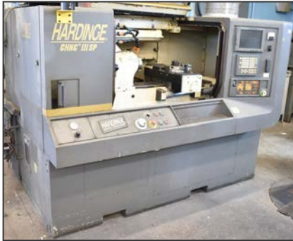
HARDINGE CHNCIII CNC precision lathe