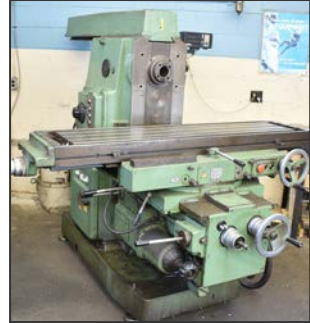
STANKO 6R83 horizontal mill