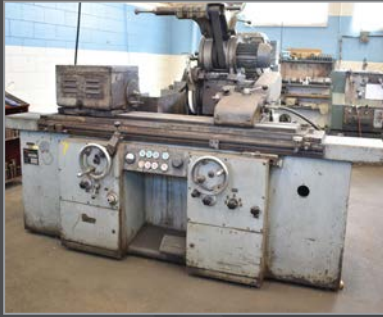
HAVLIK SWA-25 cylindrical grinder