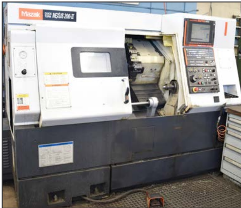
MAZAK QUICKTURN NEXUS 200 II CNC turning center