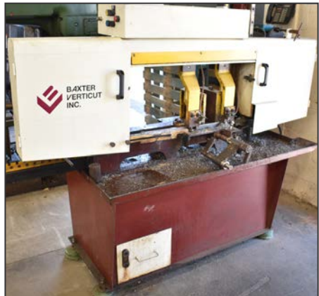
BAXTER VERTICUT 360-SA horizontal band saw

TO SCHEDULE AN AUCTION CONTACT 416.962.9600