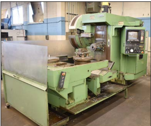
OKK CH450 twin pallet CNC machining center

CONTACT 416.962.9600 TO CONSIGN EQUIPMENT AT AN UPCOMING AUCTION