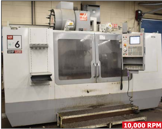
HAAS VF6B CNC vertical machining center