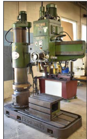
KAO-MING KMR1250 5' radial arm drill

Inspection for RUDY'S MACHINE LTD. will be held on Monday, October 20 from 9 AM to 4 PM EDT. All assets must be removed no later than Friday, November 7 by appointment only. For further information, please email info@corpassets.com or call 416.962.9600.