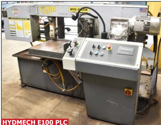
HYDMECH E100 PLC