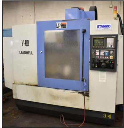
LEADWELL VD40 CNC vertical machining centers