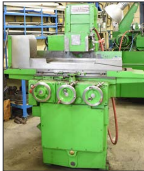
BROWN & SHARPE 618 MICROMASTER surface grinder