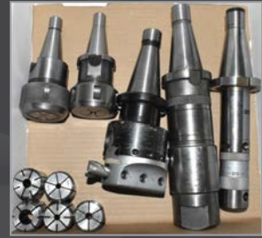
30 taper tool holders