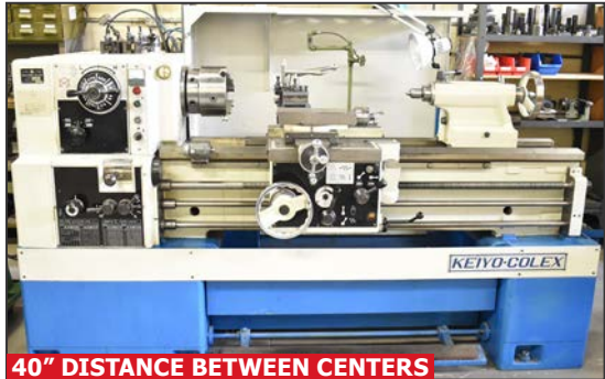
40" DISTANCE BETWEEN CENTERS