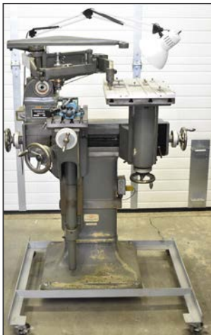
FRIEDRICH DECKEL GK12 pantograph