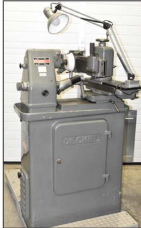
FRIEDRICH DECKEL S1 precision tool grinder