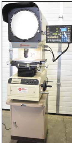
SHIMANA SHGX0C072 12" optical comparator