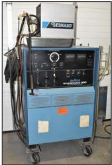
MILLER SYNCROWAVE 300 TIG welder