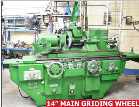
14" MAIN GRINDING WHEEL