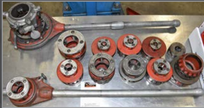
Lrg selection of RIDGID pipe threading tools