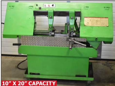
10" X 20" CAPACITY