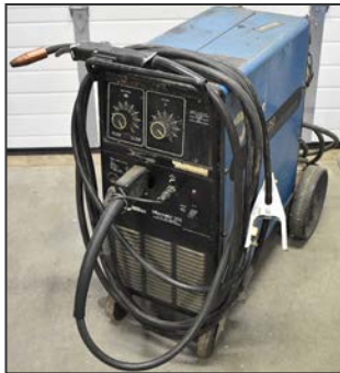
MILLER MILLERMATIC 250 portable MIG welder