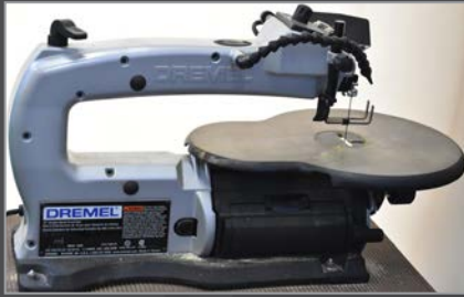
DREMEL MODEL 1680 variable speed scroll saw