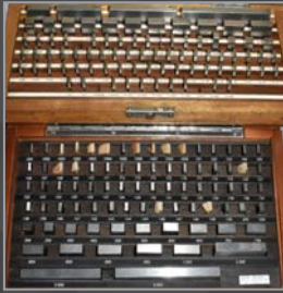
Block gauge sets