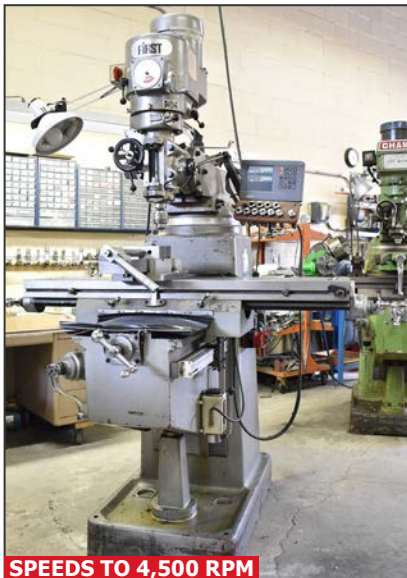
SPEEDS TO 4,500 RPM