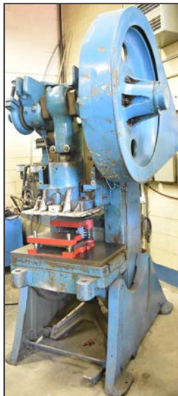
BLOW PRESS NO. 5 C-frame mechanical punch press