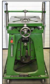
MFG UNKNOWN keyseater