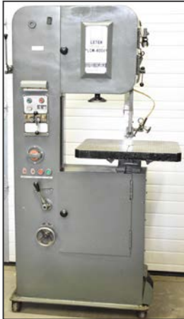
LETEN PLCM-400A vertical power band saw