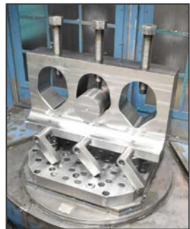
View of table with fixture