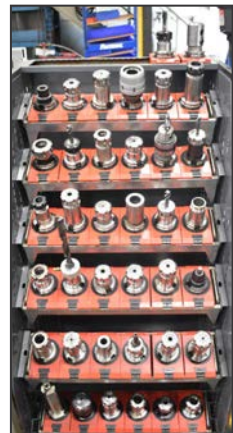
Partial view of CAT tooling available

INSPECTION IS TUESDAY, SEPTEMBER 16 FROM 9 AM TO 4 PM EDT.