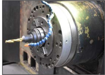
View of JOHNFORD BMC110 spindle / control