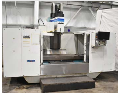
FADAL 6030 CNC vertical machining center