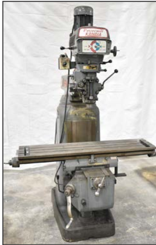
KONDIA POWERMILL vertical