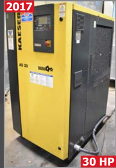
KAESER AS30 air compressor