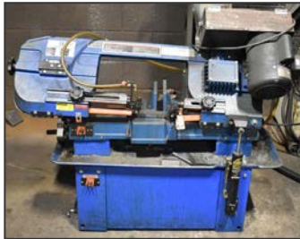
POWERFIST 3460015 horizontal band saw