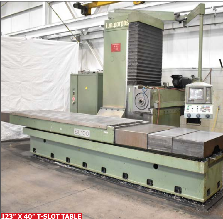
123" X 40" T-SLOT TABLE