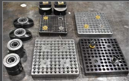
Partial view of FCS precision clamping fixtures

ALSO: HUGE OFFERING OF high end machine tool accessories consisting of FCS plates ranging in sizes, FCS pucks and mounting, FCS and t-slot angle plates ranging in various sizes, name brand machine vises, set-up plates, LARGE assortment of CAT50, CAT40, BT50, BT40 tool holders, shrink tooling, perishable tooling consisting of carbide endmills, carbide reamers, oil-through drills, carbide insert tooling, fly cutters, gun drills, tool boxes, power tools, hand tools, rigging consisting of chains, straps, eye bolts, shackles, work benches, office furniture & MORE!