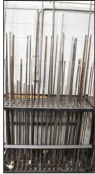
View of gun drills available