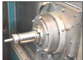
View of CNC control / spindle