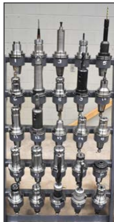
Partial view of CAT tooling available