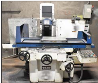
KENT GS1020 hydraulic surface grinder