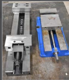
Partial view of vises available