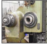
View of TAURUS TPTGCD508S spindle