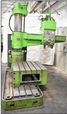
OPC 2A55 6' radial arm drill