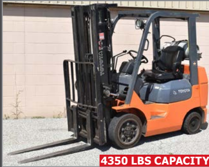
4350 LBS CAPACITY