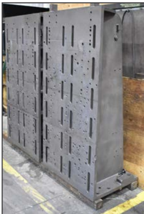
Partial view of angle plates available