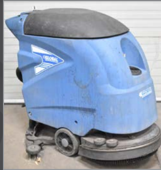
GLOBAL 24" floor sweeper