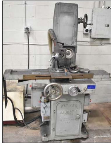
PARKER MAJESTIC drill sharpener