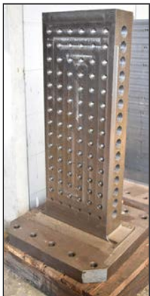
Partial view of angle plates available