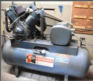
CHAMPION 25HP air compressor