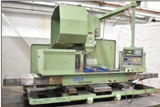
OKK MCV860 CNC vertical machining center