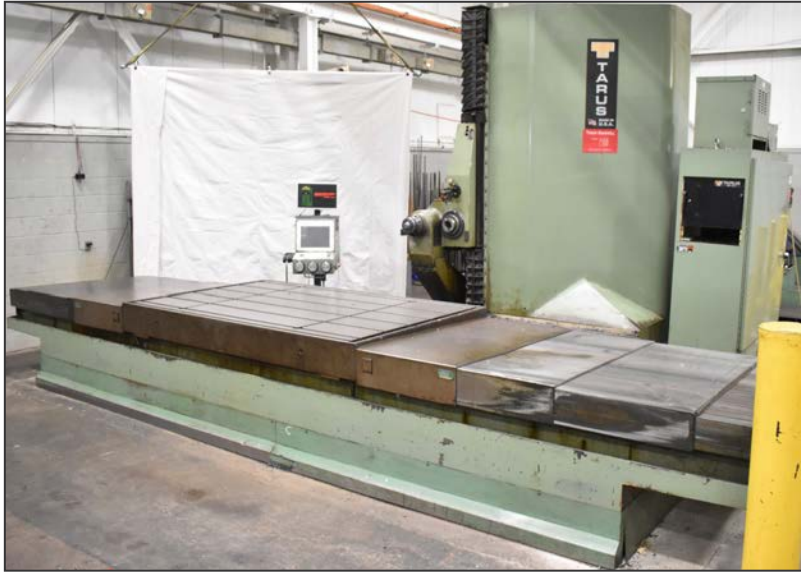
TAURUS TPTGCD508S CNC gun drill