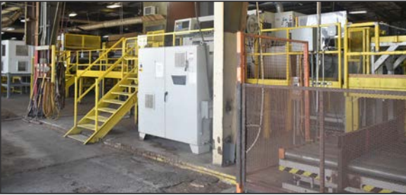
6.5' automated planer/glue/press line