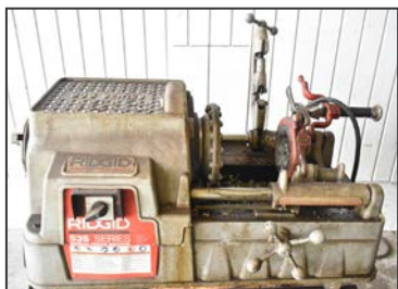
RIDGID 535 SERIES portable pipe threader

TO SCHEDULE AN AUCTION CONTACT 416.962.9600