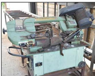
CENTRAL MACHINERY metal cutting horizontal band saw