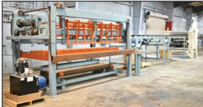
Automated panel lamination line