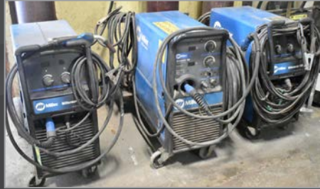
MILLER MILLERMATIC digital MIG welders