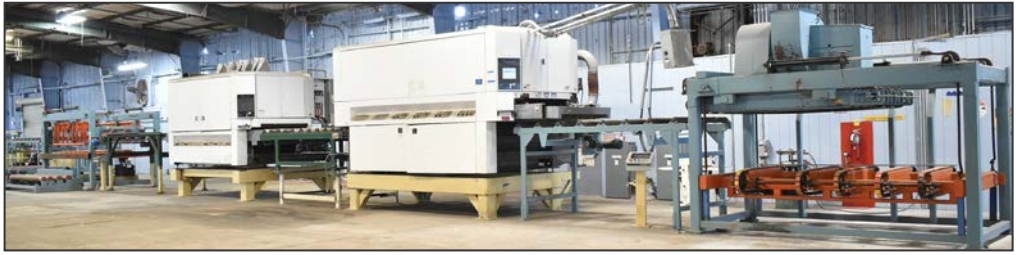
Automated panel sanding production line