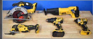
Partial view of DEWALT cordless power tools available

ALSO: DEWALT cordless power tools, self dumping hoppers, tool boxes, hand tools, fireproof cabinets, electric hoists, eye wash stations, retractable hose reels, electric power tools, shop supplies, electrical conduit & components, large assortment of NORDFAB ductwork, BURKLE press & conveyor system components, GREENLEE pipe & conduit bending equipment, (2) JET 2 ton electric hoists, HUGE QUANTITY of BAMBOO wood & PLYWOOD panels and MUCH MORE!