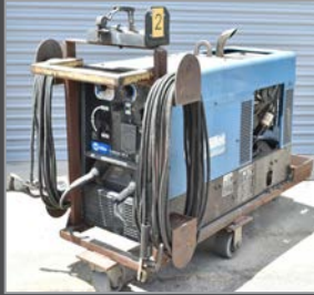
MILLER TRAILBLAZER 301G portable welder/generator