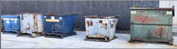
Partial view of self dumping hoppers available