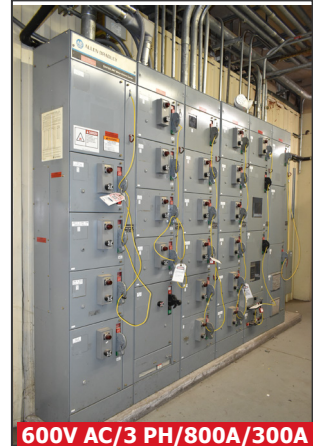
CUTLER-HAMMER UNITROL 6-bank MCC