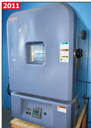
ESPEC BTL-433 temperature & humidity testing chamber