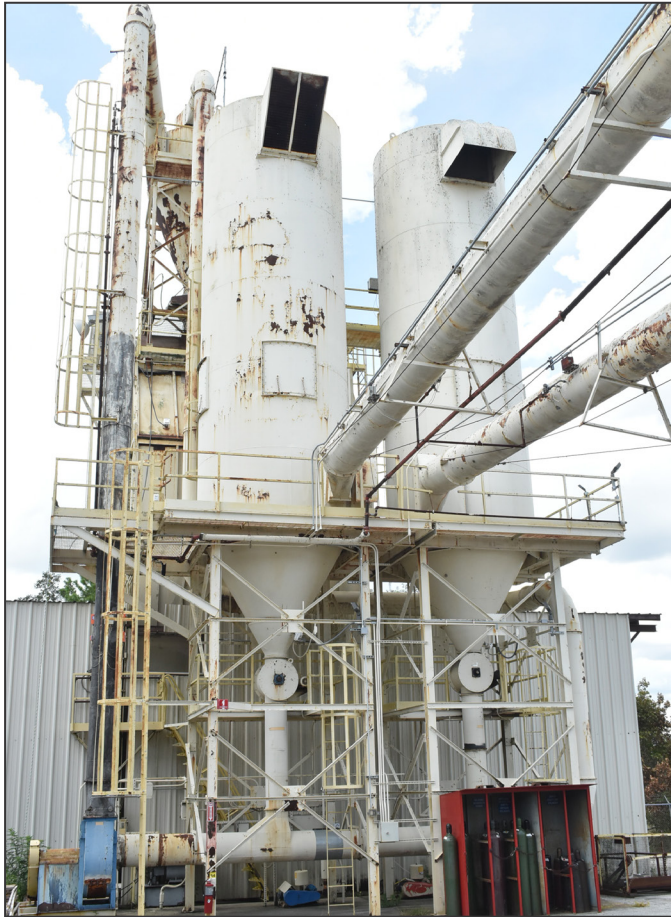
Partial view of complete dust collection system available