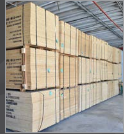
Partial view of plywood panels available