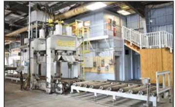
GLOBE 4X10 4-ram hydraulic single opening down-acting cold press

TO SCHEDULE AN AUCTION CONTACT 416.962.9600