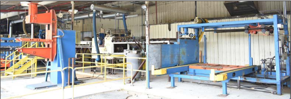
2 Pass panel sawing/sizing production line

CONTACT 416.962.9600 TO CONSIGN EQUIPMENT AT AN UPCOMING AUCTION