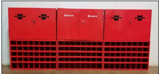
WURTH storage cabinets