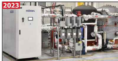
2023 OILON P220 SU HC+ industrial heat pump heat - chill system

A unique acquisition opportunity of a state-of-the-art carbon fibre composites engineering & manufacturing facility, specializing in Vacuum Assisted Resin Transfer Moulding (VARTM).