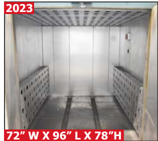
2023 72" W X 96" L X 78"H View of GRIEVE chamber