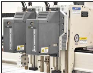
View of XYZ tangential cutting heads