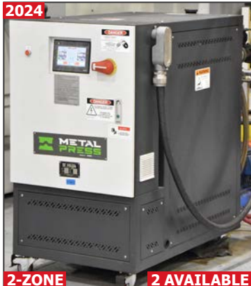
2-ZONE 2 AVAILABLE

METAL PRESS THC-D-24 hot oil temperature controllers