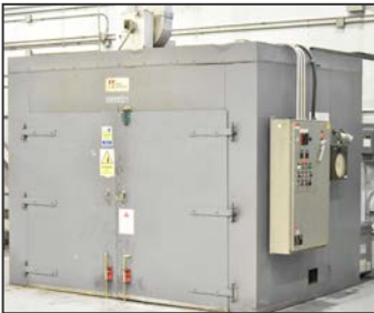
2023 PARK THERMAL 60 kW electric batch oven