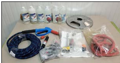
View of OPTIMA DMF steamer / pressure washer accessories