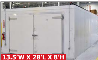
2023 13.5' W X 28' L X 8' H SUMIT SSW-C-L thermo-insulating temperature controlled room