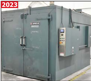
2023 GRIEVE WRC686-500 60 kW electric convection oven