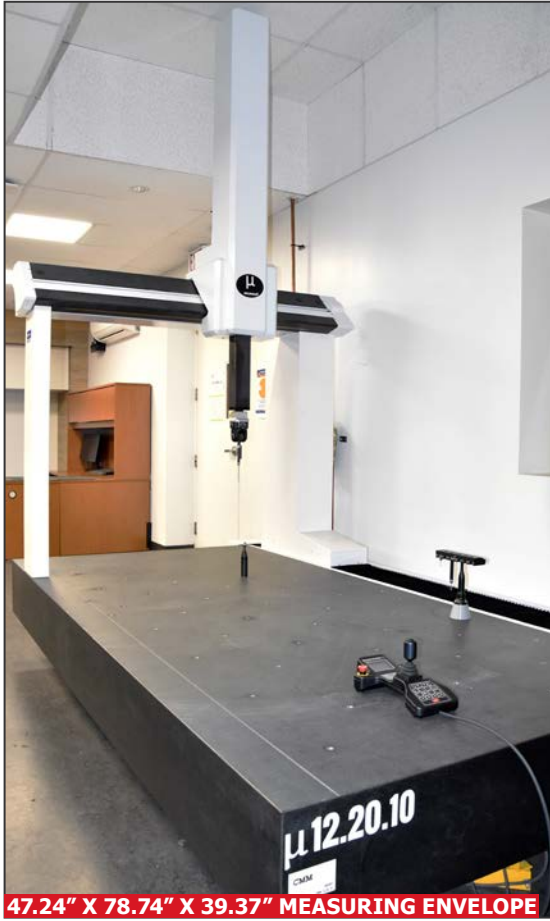
47.24" X 78.74" X 39.37" MEASURING ENVELOPE

CMM XYZ 12.20.10 MICRON II slant bridge coordinate measuring machine