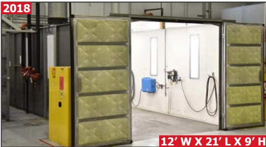
2018 RAYMAR INDUSTRIAL cross draft paint booth