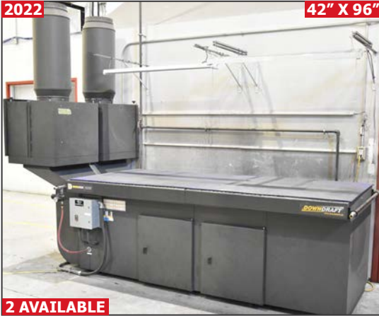
2022 42" X 96" 2 AVAILABLE DIVERSITECH DD3X8 (HEPA) down draft sanding table