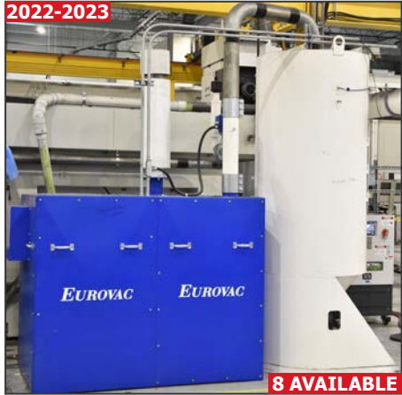
2022-2023 8 AVAILABLE EUROVAC cyclonic type dust collector systems