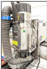
View of XYZ HSD high speed spindle