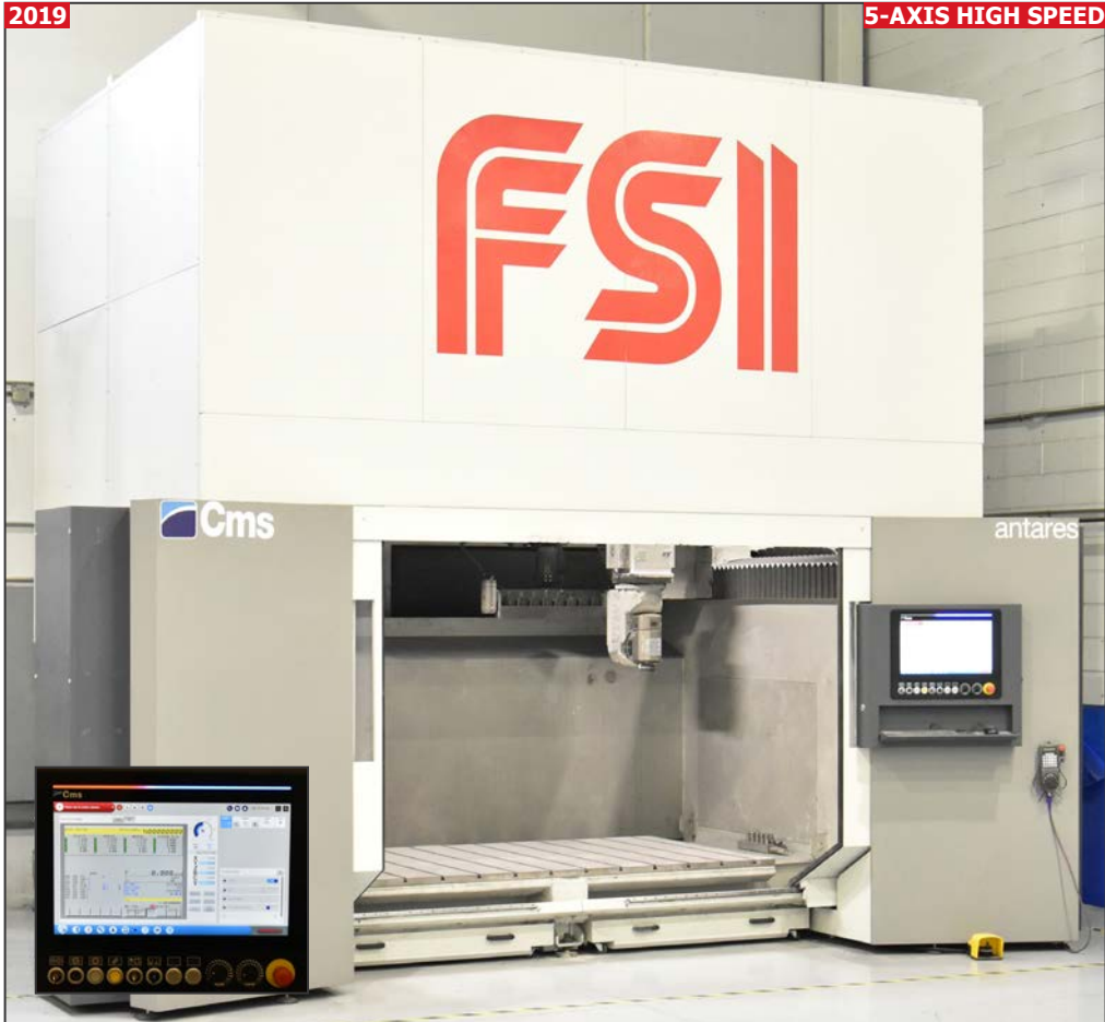
CMS ANTARES 2615 PX5 5-axis, high speed gantry-type CNC machining center