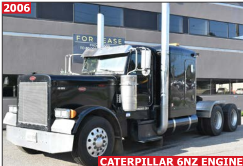
CATERPILLAR 6NZ ENGINE