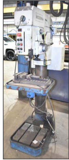
MODERNE ZW5050 gearhead drill