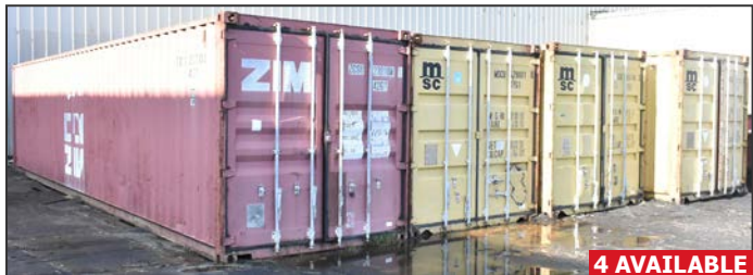
View of 40' shipping containers available