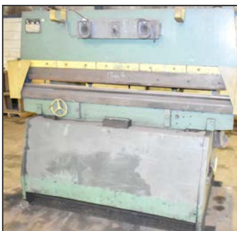
PNEUCO MACHINERY V6-50 6' hydraulic press brake