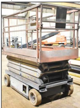
SKYJACK SJ3626 electric scissor lift