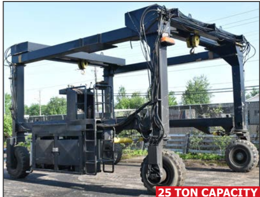
25 TON CAPACITY