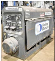
LINCOLN ELECTRIC CLASSIC 300 gas welder generator

View of LINCOLN ELECTRIC and MILLER welders available