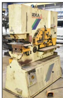
GEKA HYDRACROP 110-S ironworker