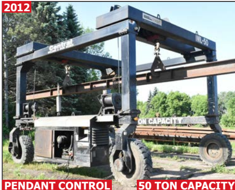
PENDANT CONTROL 50 TON CAPACITY