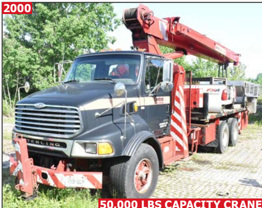
50,000 LBS CAPACITY CRANE