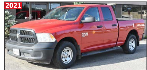
DODGE RAM 1500 pickup truck

CONTACT 416.962.9600 TO CONSIGN EQUIPMENT AT AN UPCOMING AUCTION