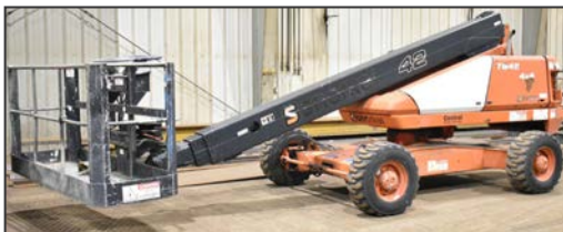
SNORKEL TB-42R0V articulating personnel lift