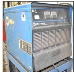
MILLER DELTAFAB mig welder