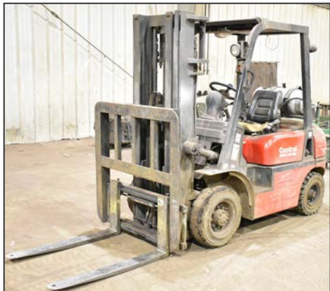
STARK FG25 LPG forklift