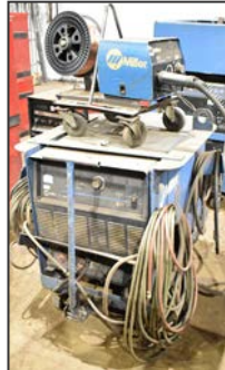
MILLER DELTAFAB mig welder