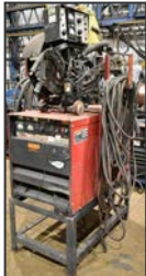
View of welding equipment