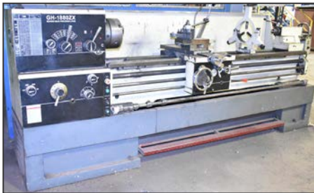
JET GH-1880ZXG gap bed engine lathe