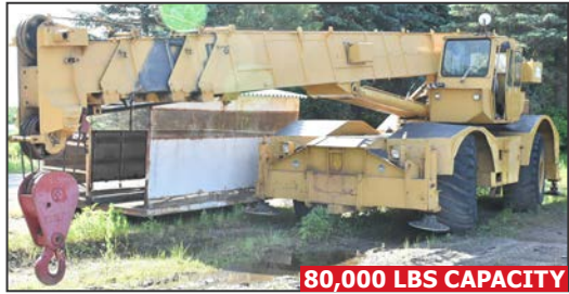
80,000 LBS CAPACITY