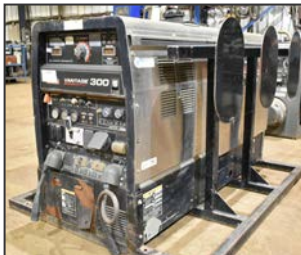
LINCOLN ELECTRIC VANTAGE 300 diesel powered welder generator