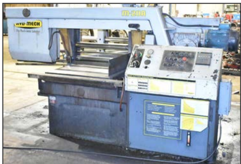
HYDMECH M-20A hydraulic horizontal band saw