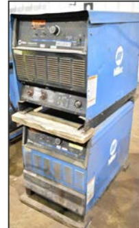
MILLER DELTAFAB mig welder