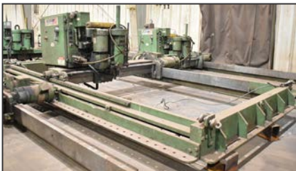
HEARN D17A XY portable table type gantry drill