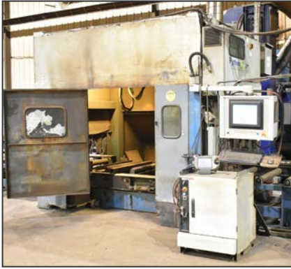
PYTHONX / ABB CNC plasma cutting robot cell