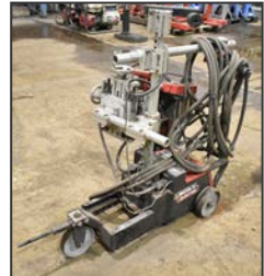
Welding machines and accessories

TO SCHEDULE AN AUCTION CONTACT 416.962.9600