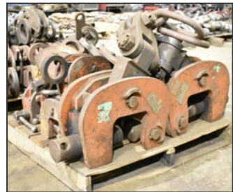
Partial view of lifting equipment available