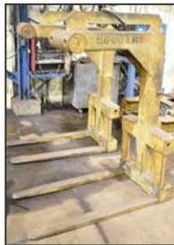
Partial view of lifting equipment available