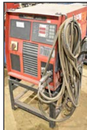
NELSON NELWELD 4000 stud welder