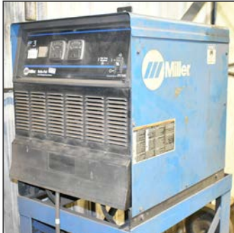
MILLER DELTAFAB mig welder