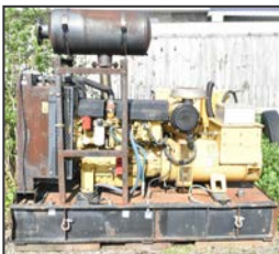
CATERPILLAR D150-8 205KW generator set