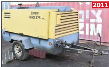
ATLAS COPCO XAS375 tow behind air compressor