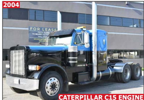
CATERPILLAR C15 ENGINE