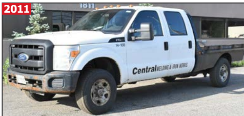
FORD F250 flat deck truck