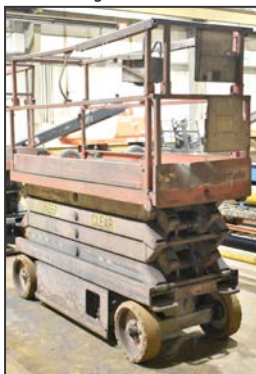
SKYJACK SJIII 3226 electric scissor lift