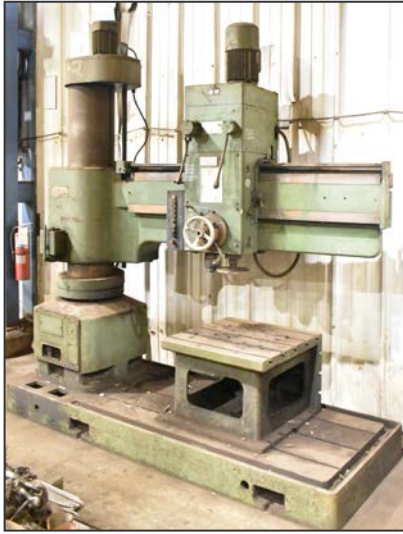
HECKER 6' radial arm drill