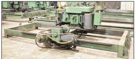
HEARN STD7BA XY portable table type gantry drill

TO SCHEDULE AN AUCTION CONTACT 416.962.9600