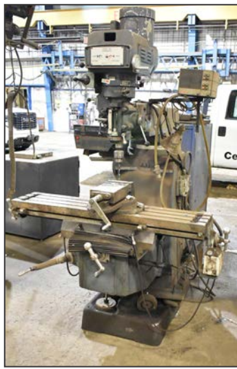
KBL 20VS vertical mill