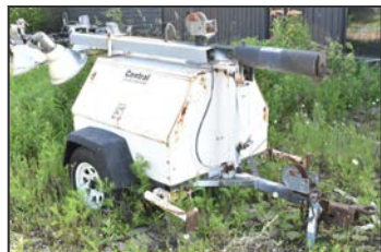
MAGNUM NIGHTBUSTER tow behind light tower