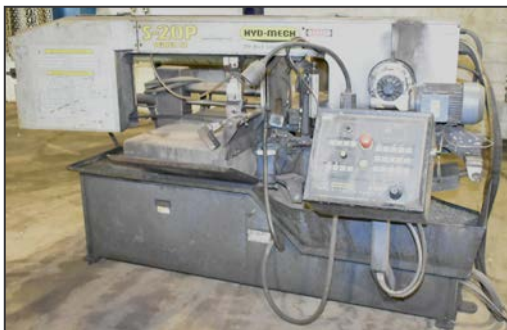
HYDMECH S-20P SERIES III horizontal band saw