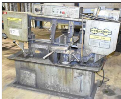
HYDMECH S20 horizontal band saw