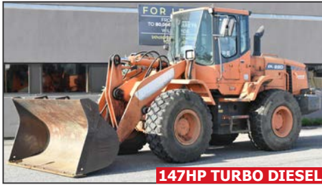
147HP TURBO DIESEL