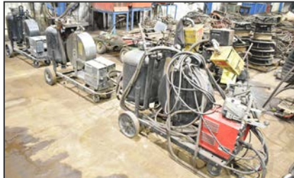
Welding machines and accessories