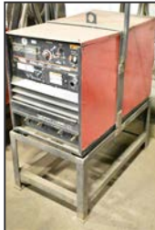
Partial view of welding equipment