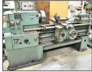
TOS SN50B engine lathe