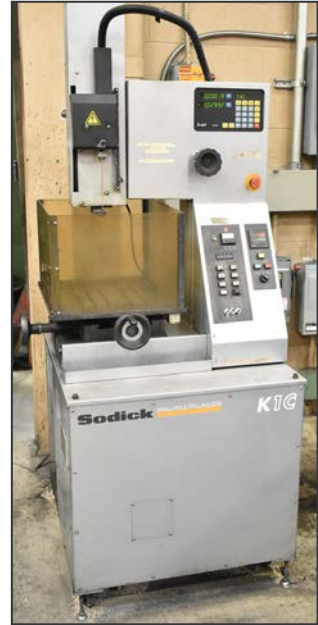
SODICK K1C small hole drilling EDM