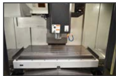
View of interior RODERS vertical machining center