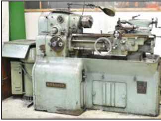
MONARCH 10BE tool room lathe