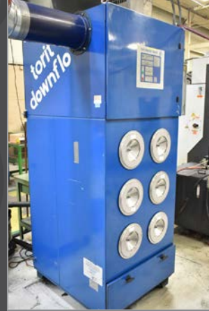
TORIT MODEL SDF6 10HP 6 bag dust collector

THIS IS A PARTIAL LISTING ONLY! FOR FURTHER INFORMATION, PLEASE VISIT WWW.CORPASSETS.COM