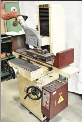
FREEPORT 5GS-618 surface grinder