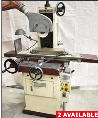
CHEVALIER FSG-618M surface grinder