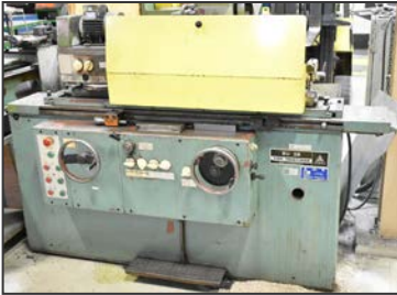
TOS BU28 universal cylindrical grinder