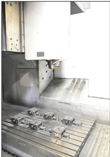
View of interior RODERS vertical machining center