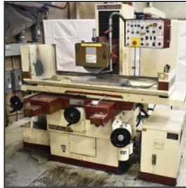
CHEVALIER FSG-3A1224H hydraulic surface grinder