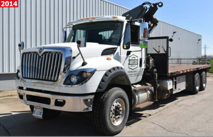
INTERNATIONAL 7600 tandem axle flat deck crane truck