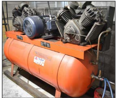
DEVILBISS 25HP air compressor

TO SCHEDULE AN AUCTION CONTACT 416.962.9600