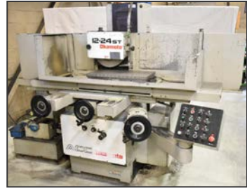
OKAMOTO 12-24ST hydraulic surface grinder