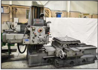
TOS WH63 horizontal boring mill