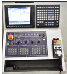
View of interior AWEA control