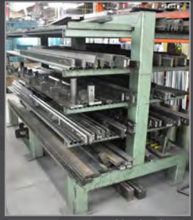
Large assortment of brake dies available