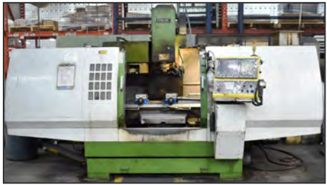
FORWARD FM-250ATG-IM CNC vertical machining center