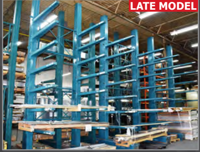
Large assortment cantilever racking available

ALSO FEATURING A LARGE OFFERING OF: press brake tooling, punch tooling, adjustable racking, numerous maintenance and spares departments, material handling equipment, production support related assets, factory support equipment & MUCH MORE!