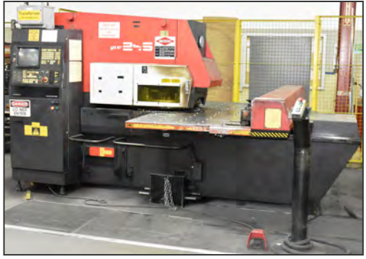
AMADA ARIES 245 20 ton CNC turret punch