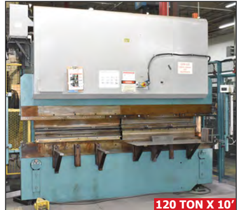
ALLSTEEL 120-10 hydraulic press brake