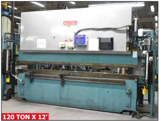
ALLSTEEL 120-12 CNC hydraulic press brake