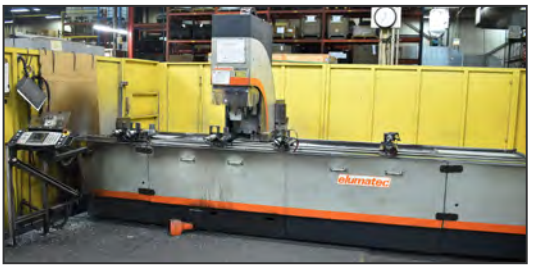
ELUMATEC SBZ122 CNC profile machining center