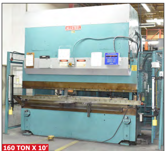
ALLSTEEL 160-10 hydraulic press brake