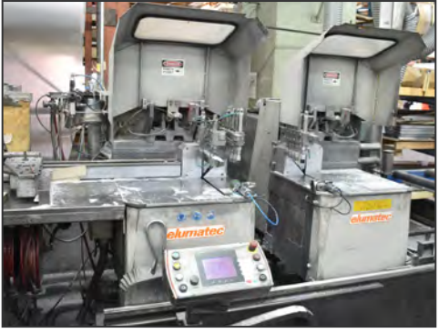
ELUMATEC DG142 twin head up acting miter saw