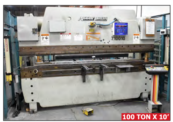
ACCURPRESS 710010 hydraulic press brake

CONTACT 416.962.9600 TO CONSIGN EQUIPMENT AT AN UPCOMING AUCTION