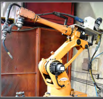
NACHI SC06F-02 robotic welding cell