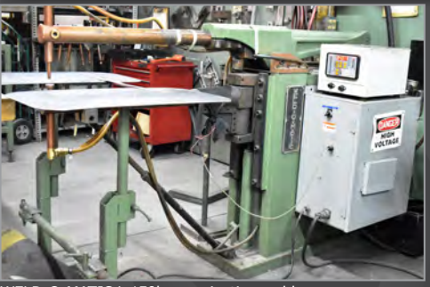
WELD-O-MATIC L 150kva projection welder