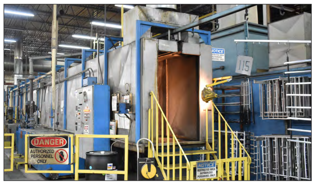
Partial overview of paint line