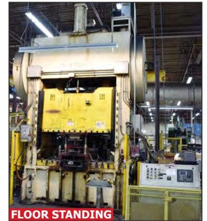
BLOW SD 4094 400 ton straight side press