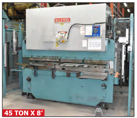
ALLSTEEL 45-8 hydraulic press brake