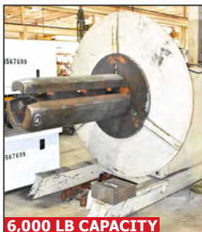
6,000 LB CAPACITY

COLT CHDR-2000-60 20,000 lb. capacity traveling uncoiler