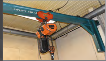
MOTIVATION free standing jib arm with JET 1/4 ton capacity electric hoist