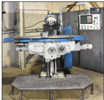
BYJC XAE5750/63 universal milling machine