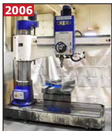
ZJ DRILLMASTER 6' radial arm drill

CONTACT 416.962.9600 TO CONSIGN EQUIPMENT AT AN UPCOMING AUCTION