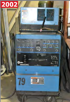
2002 MILLER SYNCROWAVE 250 DX digital TIG welder