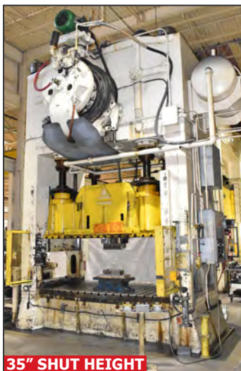
35" SHUT HEIGHT

CLEARING F-4600-132 600 ton capacity mechanical straight side stamping press