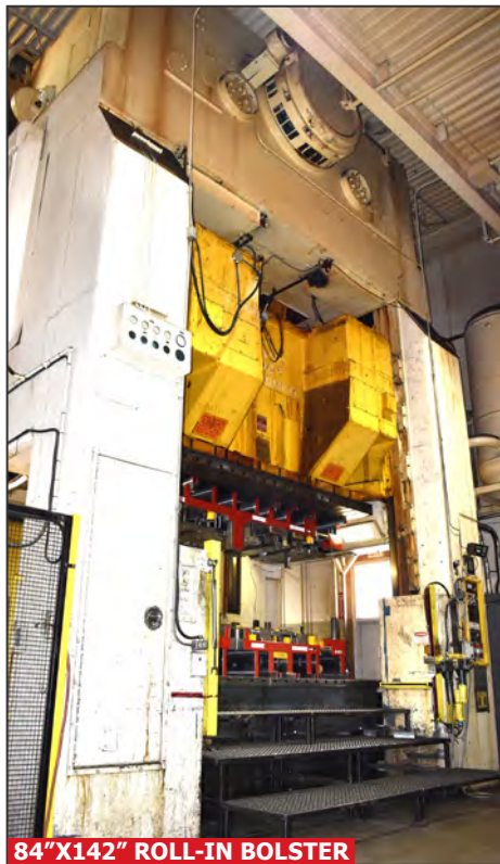
84"x142" ROLL-IN BOLSTER

DANLY D4-800/500-120x84 QDC 800 ton capacity mechanical straight side stamping press