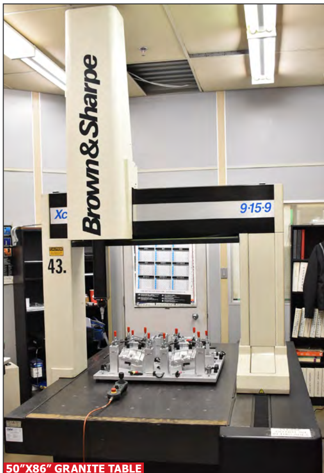
50"X86" GRANITE TABLE