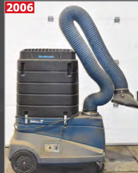
2006 NEDERMAN FILTERCART portable welding fume extractor