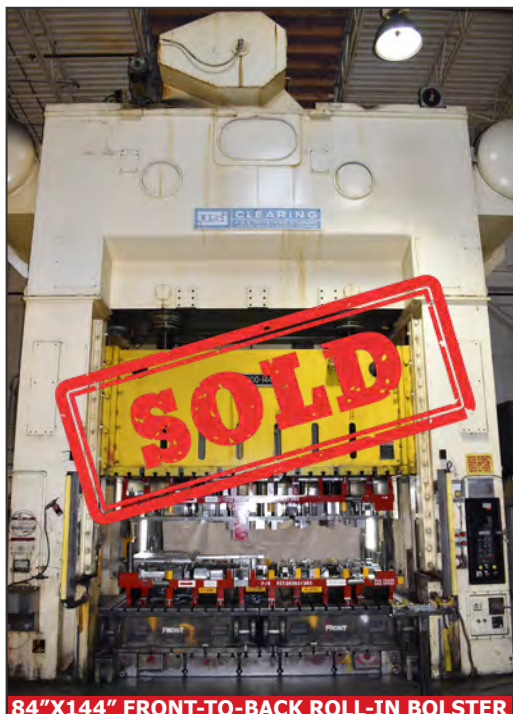
84"x144" FRONT-TO-BACK ROLL-IN BOLSTER

USI CLEARING S4-1000-144-84 1000 ton capacity mechanical straight side stamping press