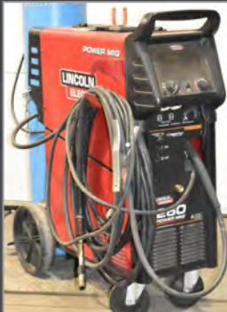
LINCOLN ELECTRIC POWER MIG 260 portable MIG welder