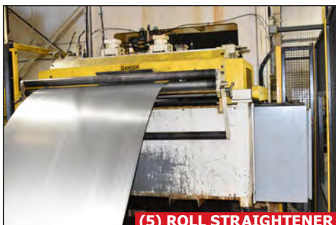
(5) ROLL STRAIGHTENER

COLT CHDR-2000-65 20,000 lb. capacity motorized traveling uncoilers