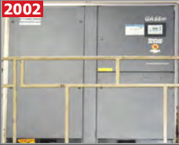
2002 ATLAS COPCO GA55 75 HP rotary screw air compressor