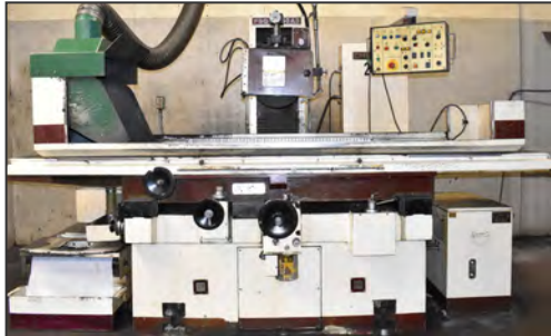
CHEVALIER FSG-1640AD hydraulic surface grinder