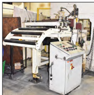
COLT 38" servo feeder/straightener

COLT CERFS-40-60 60" servo feeder/straightener