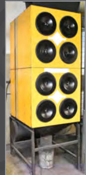
Cartridge-type dust collector

ALSO: HUGE QTY of CAT 50 & CAT 40 conventional & heat shrink tool holders; machine tool accessories including 72"x72" heavy duty angle plate, (2) 98"x40" heavy duty angle plates, machine vises, rotary tables, setup blocks and fixtures; INSPECTION EQUIPMENT including granite surface plates, precision vises, height gauges, gauge blocks; machine. LRG SELECTION of LISTA-type multi-drawer tool cabinets; (50+) engineered steel saw horses; lifting magnets; lifting chains; swivel eyebolts; lifting shackles; power tools; hand tools; PERISHABLE TOOLING comprising drills, end mills, reamers, carbide insert cutters, carbide insert face mills, carbide insert boring bars, carbide inserts; work benches; shop carts; die racks & MUCH MORE!