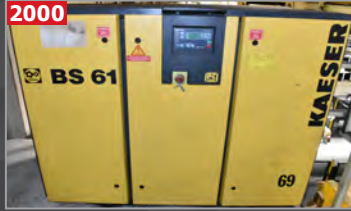
2000 KAESER BS61 50 HP rotary screw air compressor