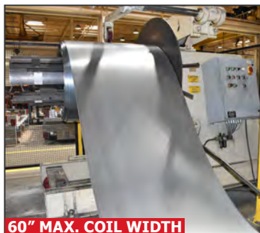
60" MAX. COIL WIDTH

USI CLEARING S4-1000-144-84 1000 ton capacity mechanical straight side stamping press