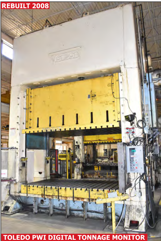
TOLEDO PWI DIGITAL TONNAGE MONITOR

DANLY D4-800/500-120x84 QDC 800 ton capacity mechanical straight side stamping press