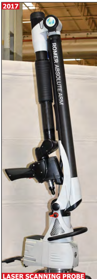
LASER SCANNING PROBE

HEXAGON METROLOGY RA-7525 SEI ROMER ABSOLUTE portable CMM arm