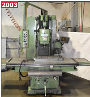
DAHLIHL DL-V1600 bed-type universal milling machine