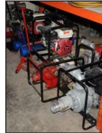
Partial view of pumps available