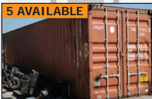
Storage sea container