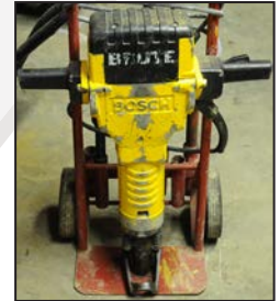
BOSCH brute electric jack hammer