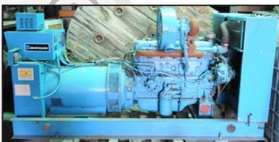
SIMPOWER 60KW diesel genset