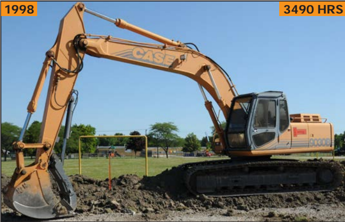
CASE 9030B hydraulic excavator