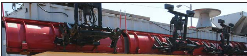
Partial view of western plow attachments available