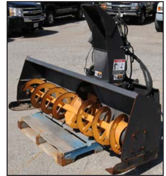
CASE 70" snow blower attachment