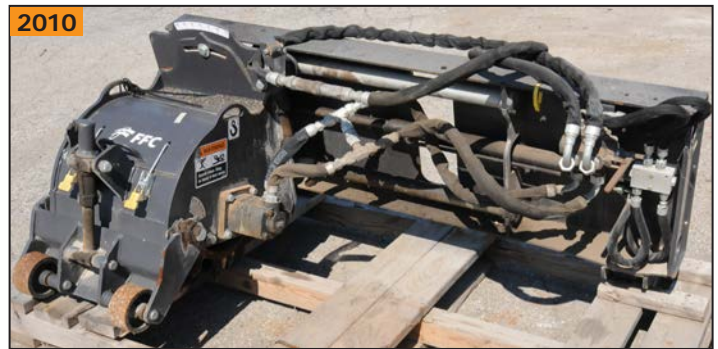
2010 PALLADIN FFC SERIES II hydraulic asphalt miller/planer