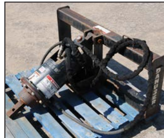
DANUSER 1025H hydraulic auger drive