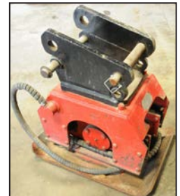
NPK C4A hydraulic tamper attachment