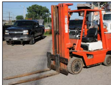
TOYOTA 8,000 LBS cap LPG forklift

(10+) assorted snow plow truck attachments; (2) Diesel storage tanks with metering pumps; HUGE ASSORTMENT OF storage containers, wire reel winders, flatbed & storage trailers, mobile office units, large qty of late model skid steer & loader attachments (NEW AS 2014!)