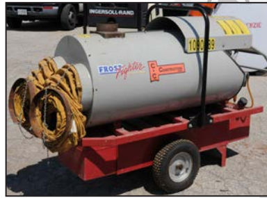
FROST FIGHTER 40,000 BTU indirect heater