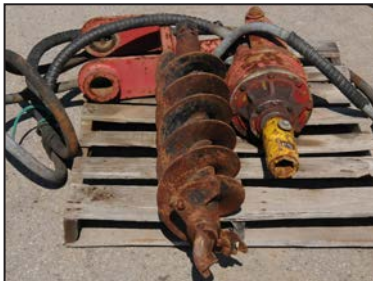
View of hydraulic augers available