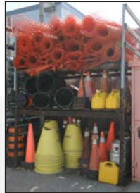
Partial view of barricades available