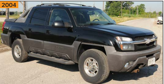
CHEVROLET AVALANCHE 2500 SLE crew cab pickup truck

(130+) TRANSFORMERS with up to 1500 KVA cap; (4) HONDA gas powered generators up to 5KW capacity; (5) LDG diesel generators up to 60 KW capacity; (15+) HONDA, TSURUMI & HYDROMATIC gas powered and electric water pumps; (10+) RIDGID 300 portable power threaders & MORE!