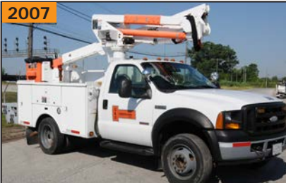
FORD F550 XL SUPER DUTY regular cab bucket truck