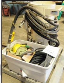
EMPIRE sand blaster