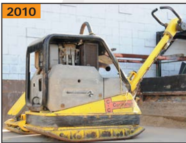
WACKER DP46055 reversible plate diesel tamper compactor