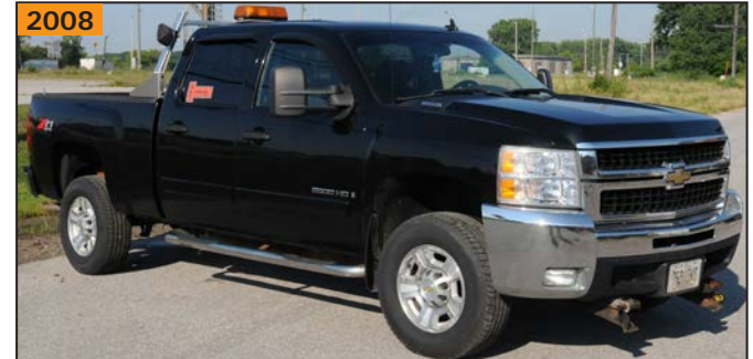
CHEVROLET SILVERADO 2500HD LT2 crew cab pickup truck