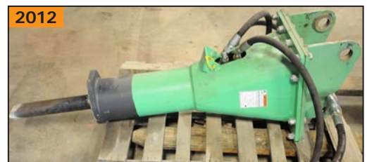
2012 TRAMAC SC36 hydraulic jack hammer attachment