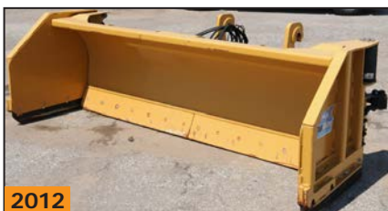
2012 HLA SNOW HLA4200 10' - 15' snow blade