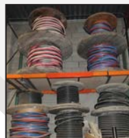
Partial view of high voltage wire