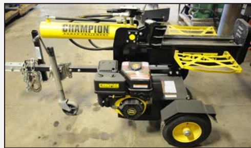
CHAMPION hydraulic log splitter