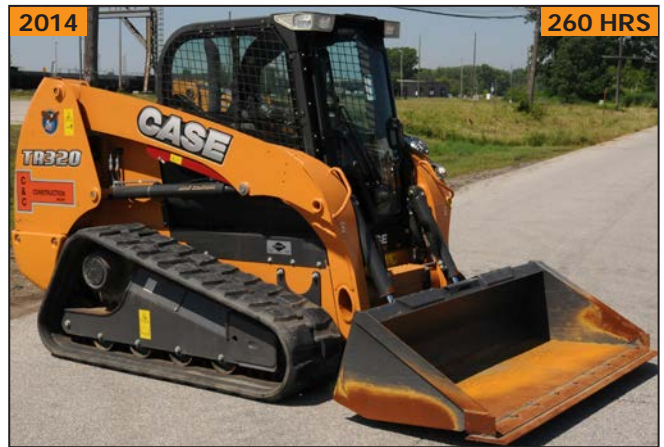
CASE TR320 compact track loader