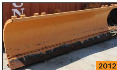
2012 HLA SNOW HLA4000 10' snow blade