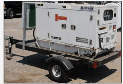
DINGOL 11 KW diesel gen set