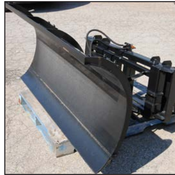
HORST SBCT06 5' plow blade attachment