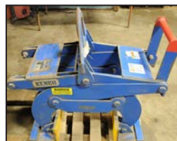
KENCO barrier lifter