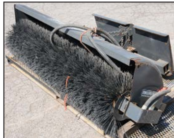
PALLADIN SWEEPSTER 72" sweeper attachment