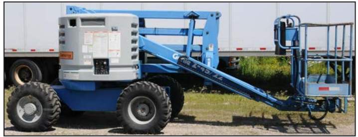
GENIE Z45-22 articulating boom lift