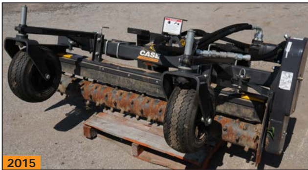
2015 CNH HARLEY RAKE 72" hydraulic soil conditioner attachment