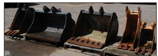
Partial view of buckets available

This brochure is only a partial listing. PLEASE VISIT OUR WEBSITE