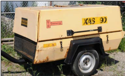
ATLAS COPCO XAS 90 DIESEL powered air compressor