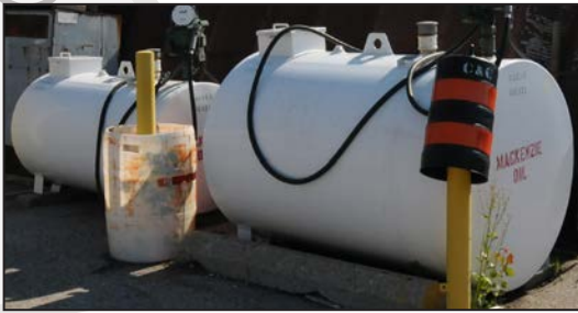
Partial view of fuel tanks available