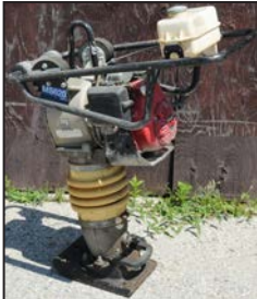
HONDA gas powered tamper