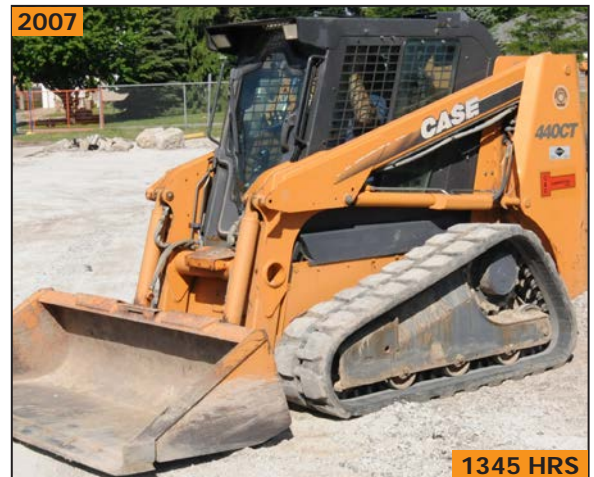
CASE 440CT skid steer loader