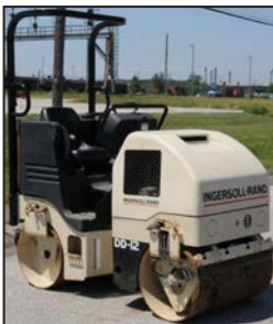
INGERSOLL RAND DD12 double tandem roller