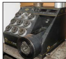
OMNICRIMP 2 hydraulic hose crimper

HUGE SELECTION of POWER TOOLS, HAND TOOLS & PNEUMATIC TOOLS all like new in excellent overall condition; portable hydraulic power packs; tray rollers; cable pullers; manual pipe & conduit benders; huge quantity of SHERMAN-RILEY travelers; CONCRETE FORMING equipment consisting of floats and screeds, large selection of forms (100+) from 10"x5' to 24"x5'; regular and high voltage scaffolding sets with frames, railings, levelers, platforms, wheel sets, clamps, pins and hardware; large selection of steel, concrete and wood construction fences and barricades; (3) fuel storage tanks with up to 335 liter capacity; (3) portable water tanks up to 1,000 gal capacity; traffic control and construction signage consisting of barrels, pylons, full assortment of road construction signs; and MUCH MORE!