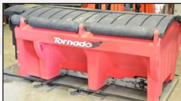
TORNADO pickup truck salter