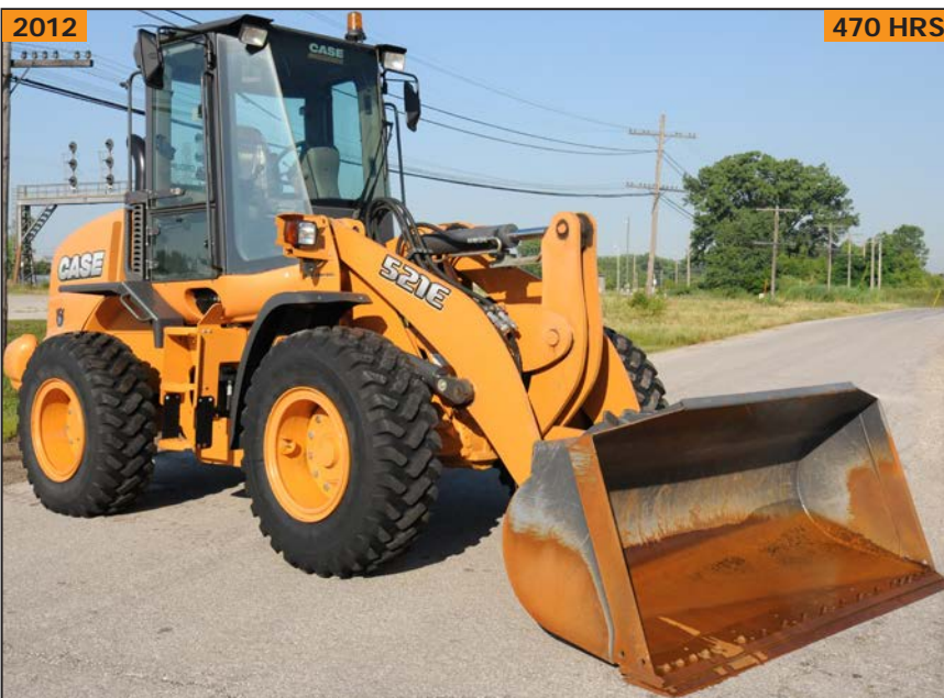
CASE 521E front end wheel loader