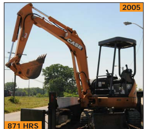
CASE CX31 mini hydraulic excavator

Huge assortment of MILWAUKEE heavy duty electric hammer drills and power tools; (5+) BOSCH BRUTE & SDS heavy duty electric jack hammers & MORE!