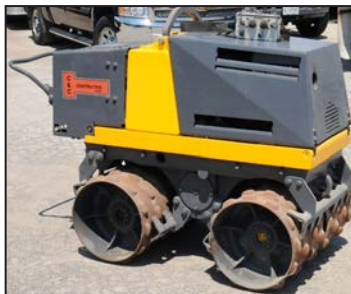
BOMAG remote controlled tandem roller