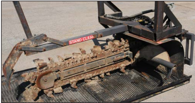
BRADCO 100269 60" hydraulic trenching attachment