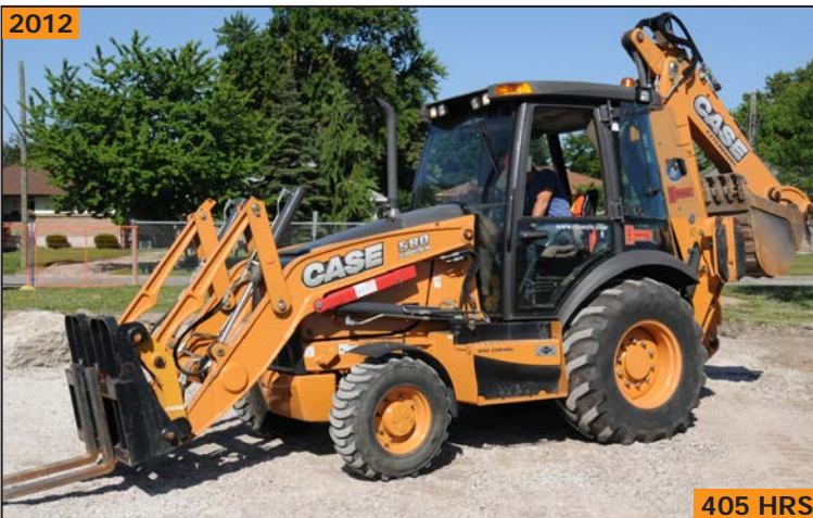
CASE 580SN T4 backhoe loader