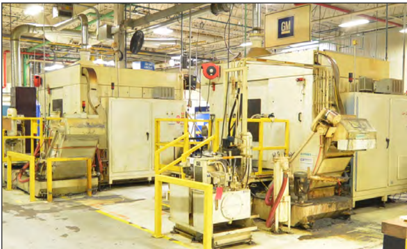
TRI-WAY FLEX automotive flexible manufacturing line