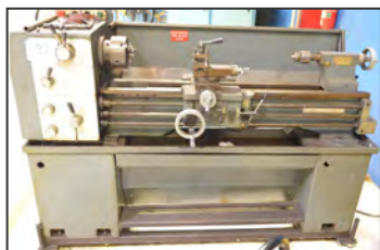
GRIP 1345 tool room lathe