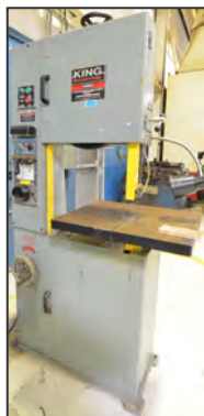
KING KC-450 metal cutting band saw