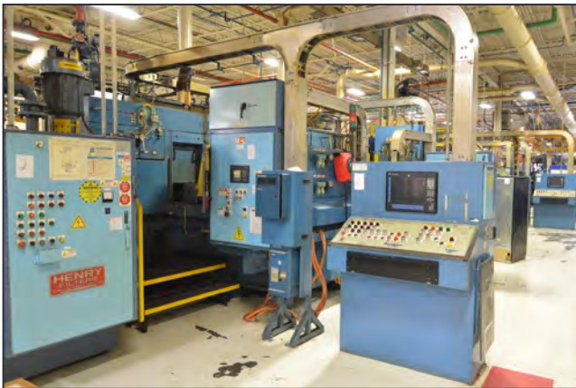
TRI-WAY FCA-CHRY automotive flexible manufacturing line