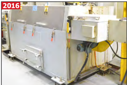
MDI-JD NORMAN OP70 high volume through type uplift hot parts washer