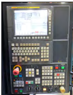
View of FANUC 321B CNC control