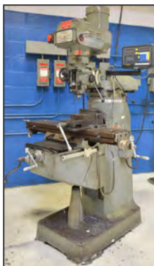
KBC S-2A vertical turret milling machine