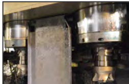
View of CHIRON 12,000 RPM twin spindles