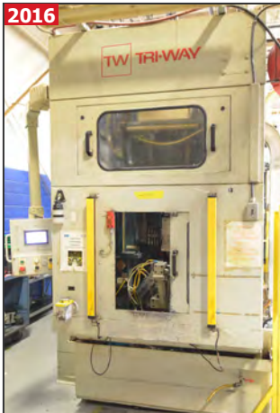
TRI-WAY OP20 hydraulic fracturing and assembly machine