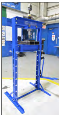
Late model shop press