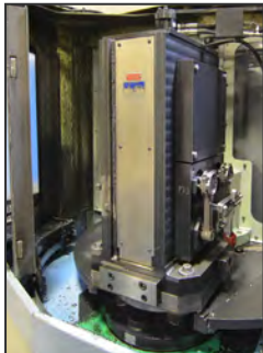
View of hydraulic clamping tombstones