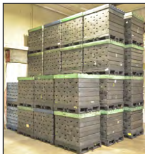
Large quantity of stacking bins available