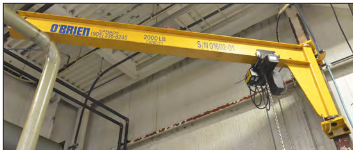
O'BRIEN 2000 lb jib crane