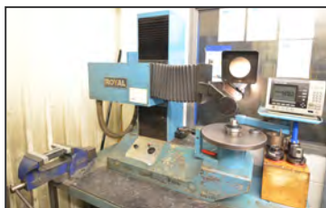
ROYAL digital tool presetter