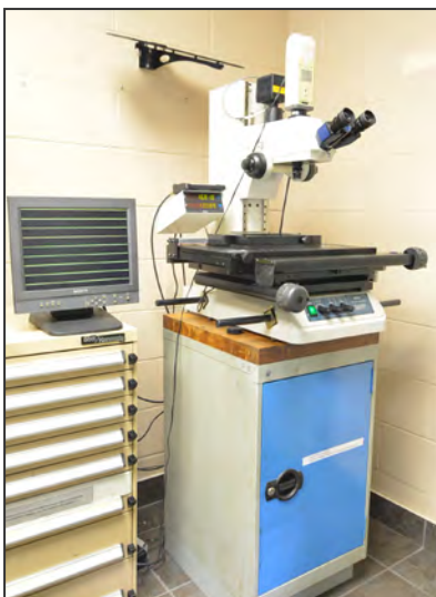
MITUTOYO MF 176-532A digital measuring microscope