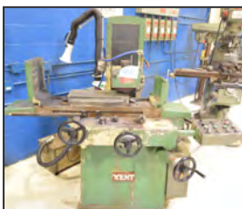
KENT KGS-250AH hydraulic surface grinder