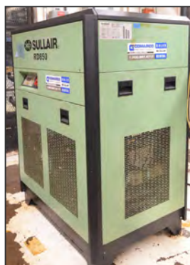
SULLAIR RD850 refrigerated air dryer