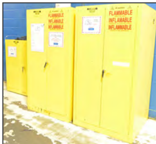
JUSTRITE safety cabinets