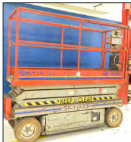
SKYJACK SJI-3220 electric scissor lift