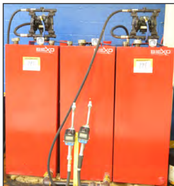
BIEXI oil storage tanks with digital metered dispensing guns