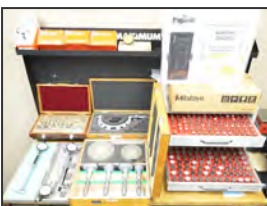
Partial view of QC inspection equipment available