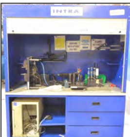
View of gauge bench

THIS BROCHURE IS ONLY A PARTIAL LISTING. PLEASE VISIT OUR WEBSITE