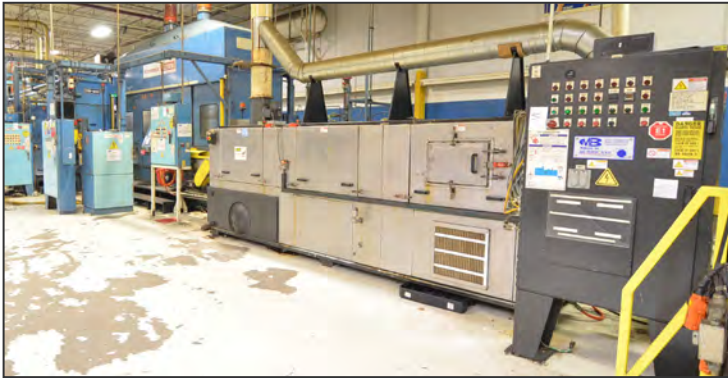
TRI-WAY L850 automotive flexible manufacturing line