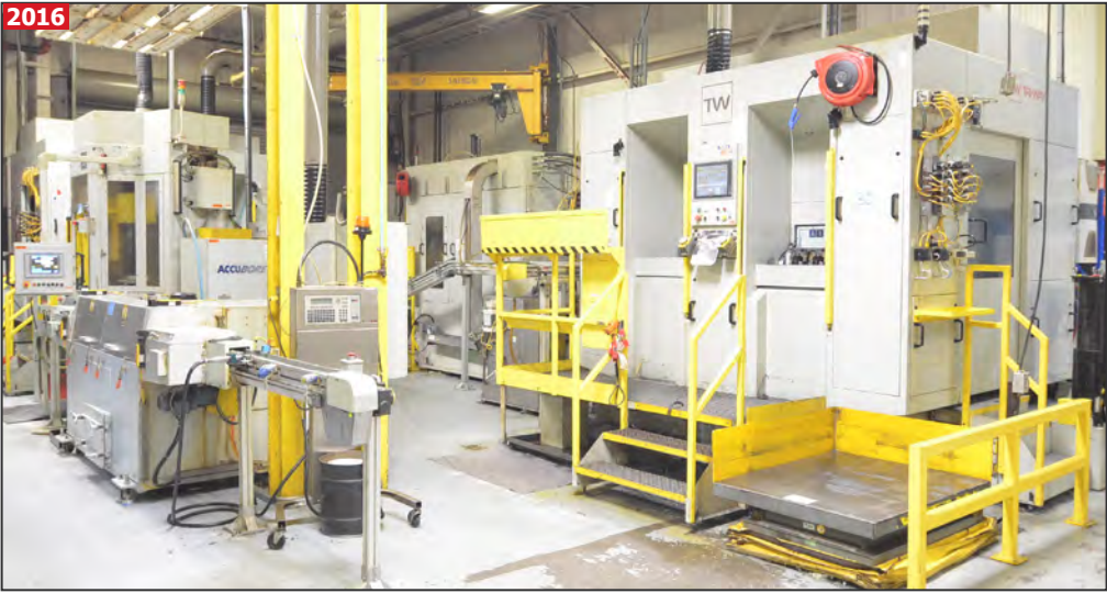
TRI-WAY LVL automotive flexible manufacturing line