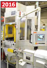
ACCU-CUT vertical honing machine