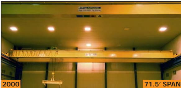
2000 71.5' SPAN

View of JMF 12.5 TON and JMF 5 TON bridge cranes