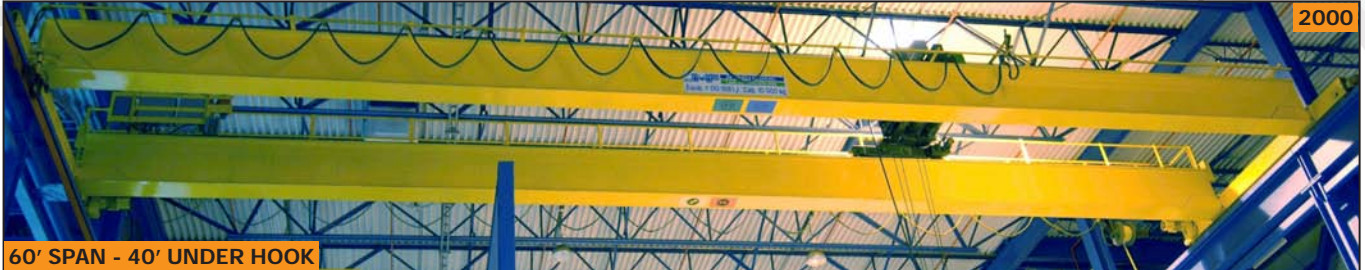
60' SPAN - 40' UNDER HOOK