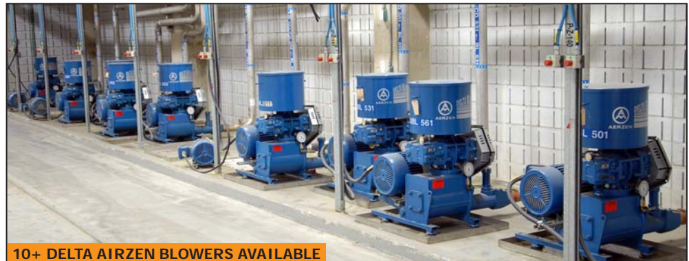
10+ DELTA AIRZEN BLOWERS AVAILABLE

FOR MORE DETAILED LISTINGS AND PHOTOS www.corpassets.com