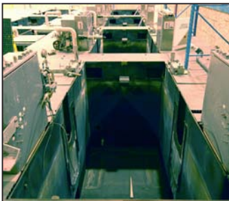
Top view of electro-plating tanks