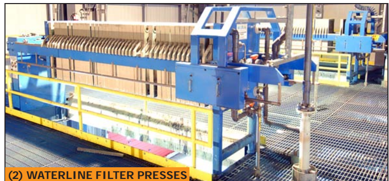
(2) WATERLINE FILTER PRESSES