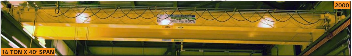
16 TON X 40' SPAN