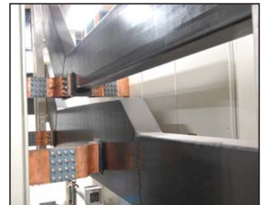
Copper/Aluminium buss bar