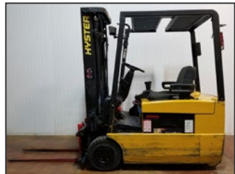
HYSTER J35XM 36V 3 wheel electric forklift