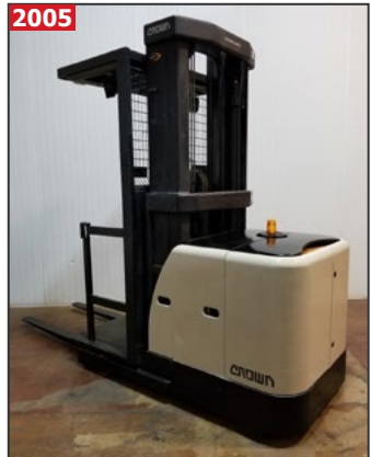
CROWN SP3400 24V electric order picker forklift