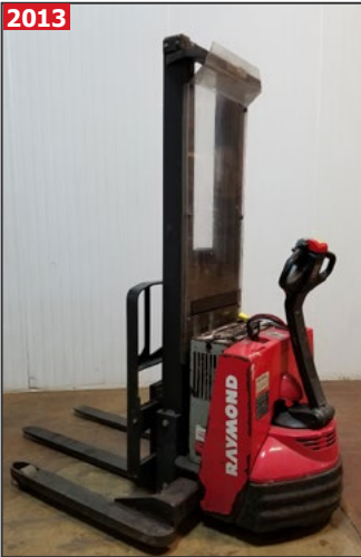
RAYMOND RAS25-TF 24V walk-behind electric pallet stacker