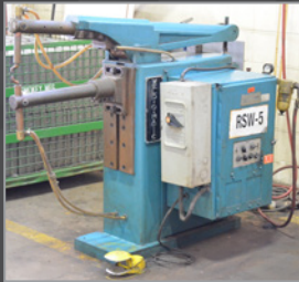
WELD-O-MATIC AF rocker arm type spot welder