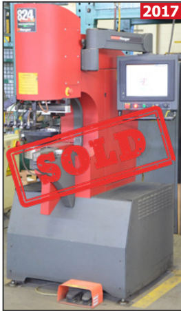
HAEGER 824 ONETOUCH 4E CNC fastener insertion press