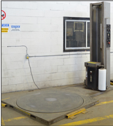
SAMUEL SLP-175 rotary pallet wrapper