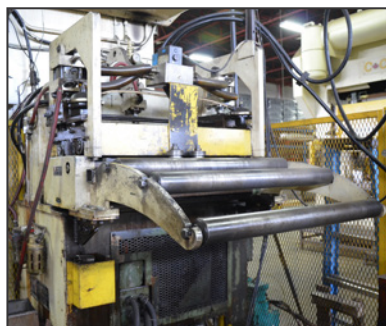
MECON 24X250 servo feeder