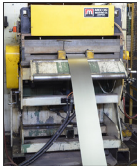
MECON 36x0.166 servo feeder