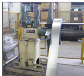
MECON 60DBLDCH 36 6,000 lb. capacity motorized uncoiler