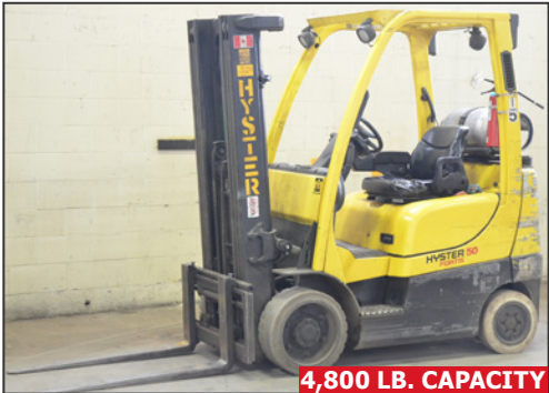
4,800 LB. CAPACITY