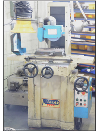
PERFECT PFG-2040M manual surface grinder