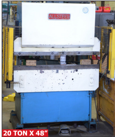
20 TON X 48" ALLSTEEL MODEL 20-4 press brake