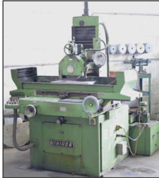
KIKINDA URB-550A hydraulic surface grinder