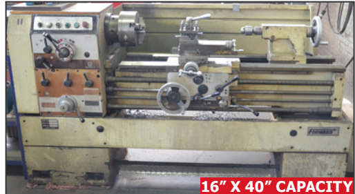
16" X 40" CAPACITY FORWARD IF-1640 gap bed engine lathe