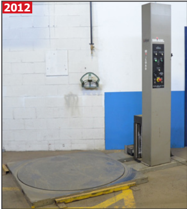
SAMUEL DEFENDER EZ-LOAD rotary pallet wrapper