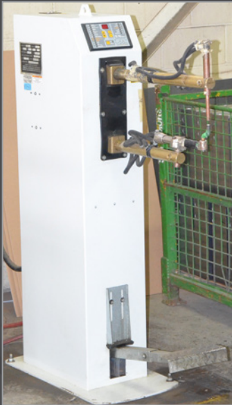
Rocker arm type spot welder with TE90 MARK II digital control