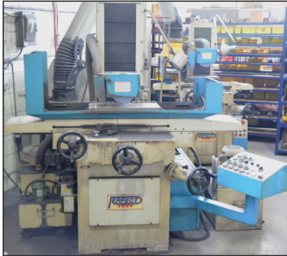
PERFECT PFG-2550AH hydraulic surface grinder