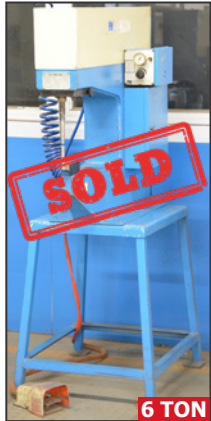
PEMSTER pneumatic insertion press

HAEGER (2017) 824-ONETOUCH 4E CNC fastener-insertion press with CNC touchscreen-control, 8-ton-capacity, (4) bowl feeders, 575V/3PH/60HZ, s/n: 80T40023 SOLD!