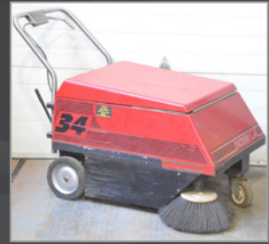
FACTORY CAT MODEL 34 walk-behind floor sweeper