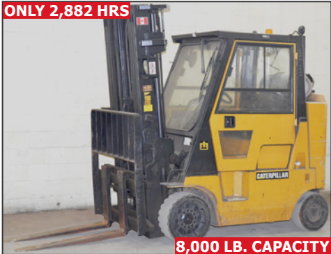
8,000 LB. CAPACITY