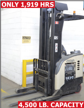
4,500 LB. CAPACITY