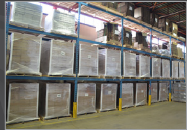
Large selection of medium duty pallet racking

ALSO: LARGE SELECTION of BRAKE DIES and PUNCHES; ROUSSEAU multi-drawer tool cabinets; KENT HVA-150 pad printer; pallet jacks; self-dumping hoppers; strapping caddies; pedestal-type shop fans; INSPECTION EQUIPMENT including ELEPHANT EHT-CE3R dial-type hardness tester, MITUTOYO digital height gauges, MITUTOYO MODEL B-251 80"x50"x12" granite surface table, STARRETT 48"x38"x8" granite surface plate with stand, STARRETT 46"x38"x8" granite surface table; DRILLS and DRILL CHUCKS; CANTILEVER material racks; (10+) sections of 99.5"x42"x192"H medium duty pallet racking; (15+) sections of 126"x40"x192"H medium duty pallet racking; steel shop tables and work benches AND MORE!