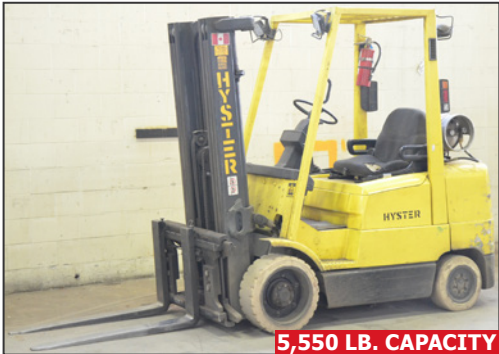
5,550 LB. CAPACITY