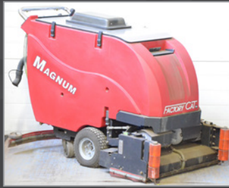
MAGNUM 30-C walk-behind electric floor cleaner