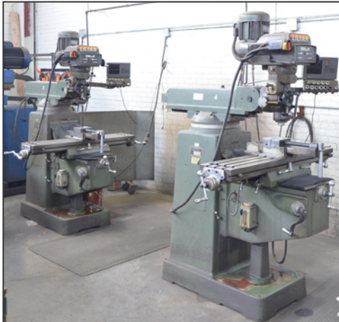
View of LILIAN vertical turret mills available