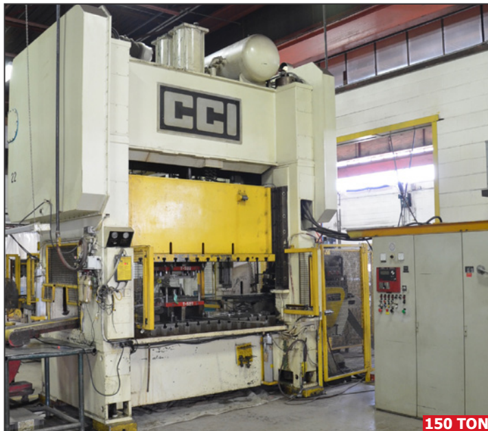
CCI S2-150-48X48 mechanical double crank straight side press