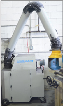
MAXICART portable 3 HP snorkel-type dust collector