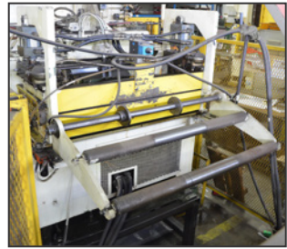
MECON 36x0.166 servo feeder