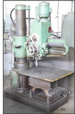
MFG. UNKNOWN 3' radial arm drill