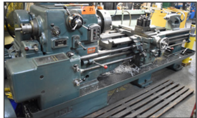
DEAN SMITH & GRACE TYPE 17 gap bed engine lathe