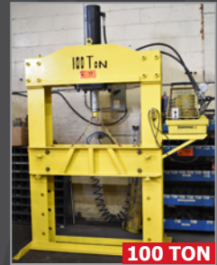
100 TON Hydraulic H-frame shop press

ALSO: LARGE ASSORTMENT OF PERISHABLE TOOLING including drills, reamers, end mills, cutters, CARBIDE INSERTS; (2) vertical sanders; inspection equipment; tie-down clamping; tapping heads; hand tools; electric & pneumatic tools; hydraulic & pneumatic fittings; office furniture and MORE!