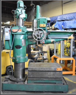
ASQUITH 5' radial arm drill