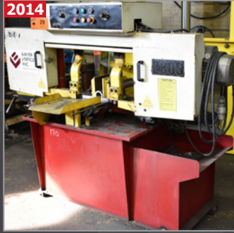
2014 BAXTER 280S verticut horizontal bandsaw