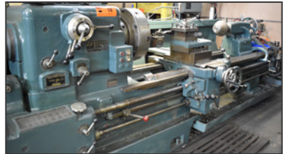
DEAN SMITH & GRACE TYPE 30LD engine lathe