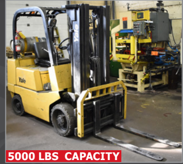
5000 LBS CAPACITY YALE MODEL GLC050 LPG forklift