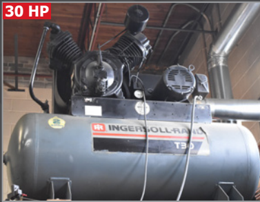
30 HP INGERSOLL-RAND T-30 piston-type tank mounted air compressor