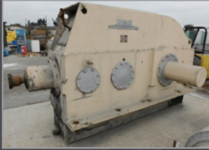
FALK 196YB3 enclosed gear drive

Tuesday, November 17 South Gate, California, USA