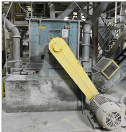
STEDMAN A-36D4-47 cage mill