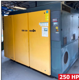
KAESER SIGMA ESD250 rotary screw air compressor