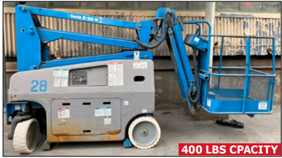
GENIE Z-20/8 electric articulating boom