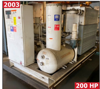
GARDNER DENVER EAU99M rotary screw air compressor