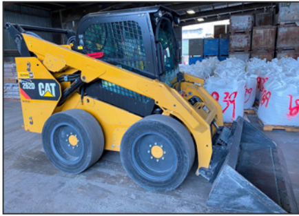
CATERPILLAR 262D skid steer