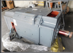
Partial view of gear reducers available