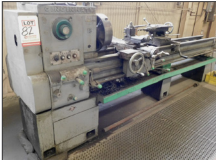
CINCINNATI NO. 18 engine lathe