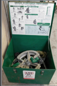
GREENLEE mechanical conduit bender