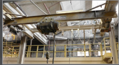
5 ton single girder underslung bridge crane