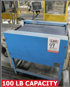
100 LB CAPACITY