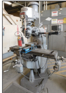
BRIDGEPORT SERIES II vertical milling machine