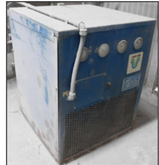
VAN-AIR RA-75 refrigerated air dryer