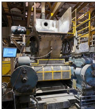
FARREL 28"x60" (2) roll mill