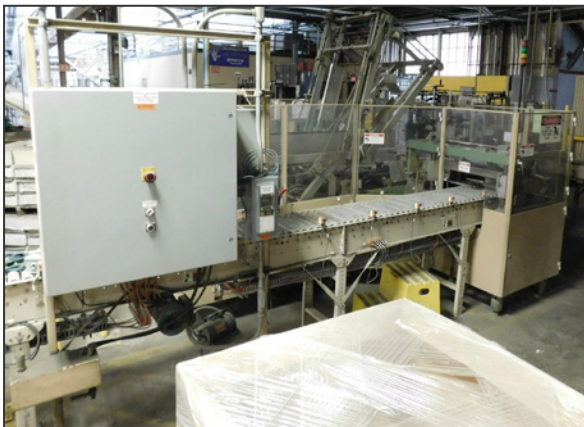
DOUGLAS packaging/labeling line