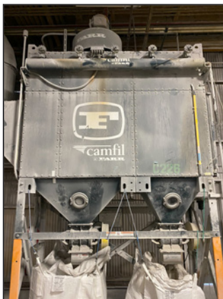
FARR-CAMFIL GOLD SERIES bag type dust collector