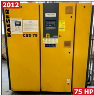
KAESER CSD75 rotary screw air compressor