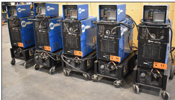
MILLER INTELLIFIRE 250 induction heating welding power sources