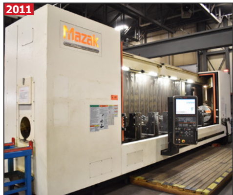
MAZAK SUPER VELOCITY CENTER 2000L/200-II high speed CNC travelling column vertical machining center