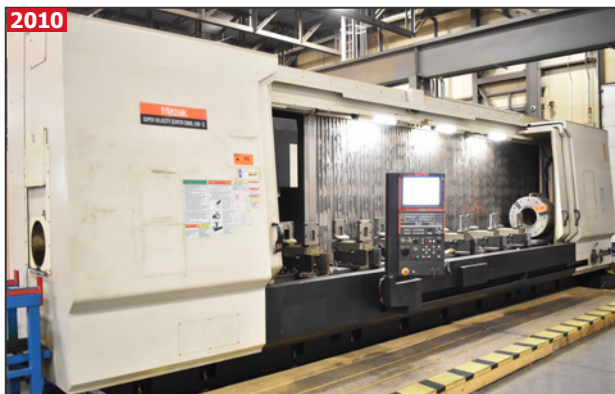
MAZAK SUPER VELOCITY CENTER 2000L/200-II high speed CNC travelling column vertical machining center