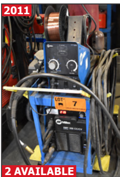
MILLER XMT 350 MIG welder & MILLER 70 SERIES wire feeder