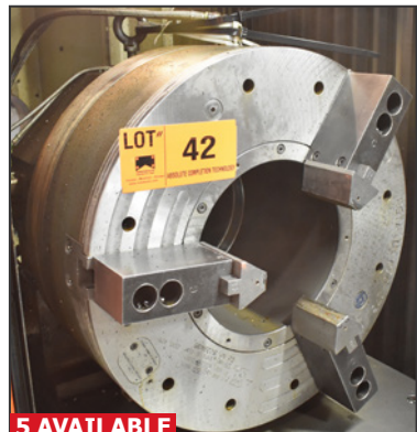
5 AVAILABLE SCHUNK ROTA TB 600-275 4th axis horizontal 24" 3 jaw chuck

INSPECTION IS BY APPOINTMENT ONLY. Please email info@corpassets.com to arrange a date & time.