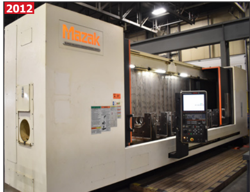
MAZAK SUPER VELOCITY CENTER 2000L/200-II high speed CNC travelling column vertical machining center