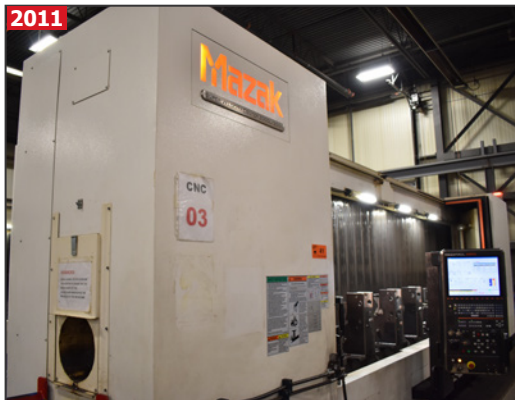
MAZAK SUPER VELOCITY CENTER 2000L/200-II high speed CNC travelling column vertical machining center