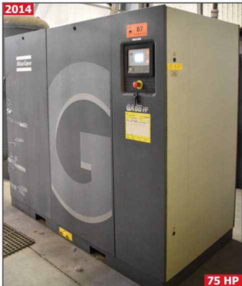
ATLAS COPCO GA55 FF rotary screw air compressor