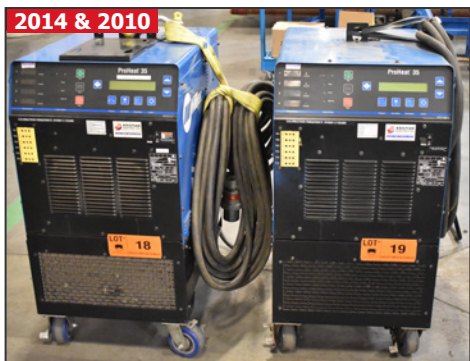
MILLER PROHEAT 35 digital induction heating welding power sources