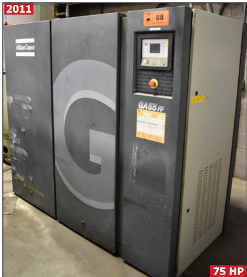
ATLAS COPCO GA55 FF rotary screw air compressor