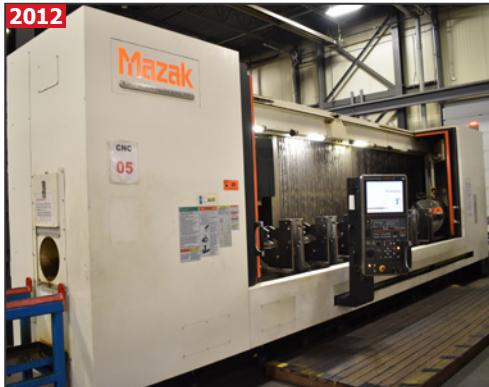
MAZAK SUPER VELOCITY CENTER 2000L/200-II high speed CNC travelling column vertical machining center