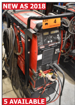
LINCOLN ELECTRIC ASPECT 375 digital TIG welder