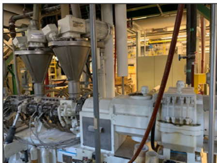
Dual crammer feeder