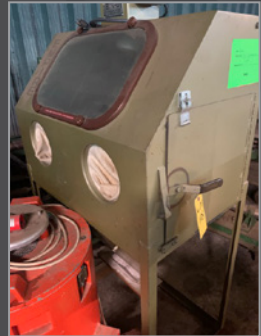
Shot blast cabinet

ALSO FEATURING: PRODEX HENSCHEL 50JSS 50/25 HP high intensity mixer with air actuated discharge; EW BLISS C-45 45 ton gap frame OBI punch press; BRUCKNER gas fired oven with 32"x65" opening & 10' cooling zone; (2) CERAMIC COATING COMPANY CR68H 650 deg. max. temperature glass lined reactor with agitator; (2) Stainless Steel jacketed reactors approx. 14" X 22" OD with agitator; (5) HOTPACK electric ovens; WABASH Model 100-1818-2TSTM 100 ton upacting 4 post lab press; EMPIRE ECONO FINISH blast cabinet approx. 25" X 35" X 30"; (2) HAMILTON-FISHER fume hoods and MUCH MORE!