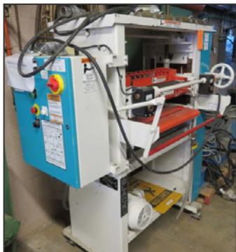
BLACK BROTHERS MODEL 22D500CTR 24" glue spreader