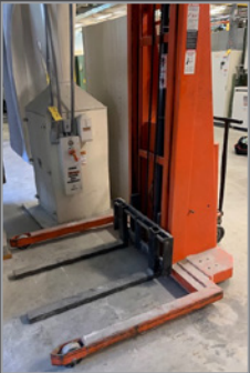
Portable die cart