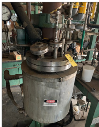
Stainless Steel jacketed reactor with agitator