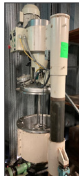
DRAIS RM-80 post mixer