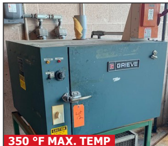
GRIEVE EBS-350 electric oven