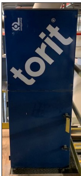
TORIT VS 1200 dust collector