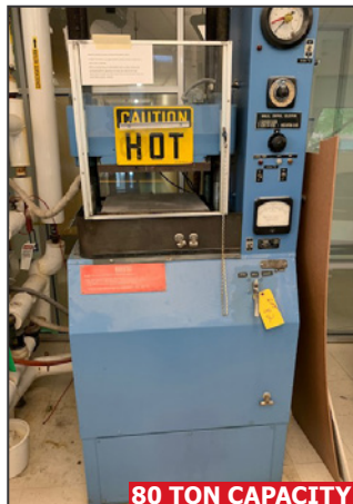
80 TON CAPACITY

WABASH MODEL 100-1818-2TSTM up-acting 4 post hydraulic lab press