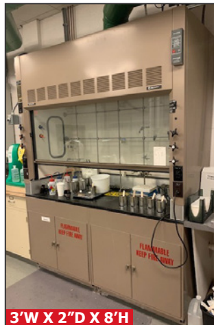
3'W X 2'D X 8'H

HAMILTON fume hood with glass panel front