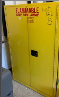
Flammable proof cabinet