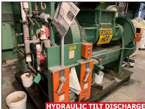
BAKER PERKINS MODEL 52829 double armed mixer