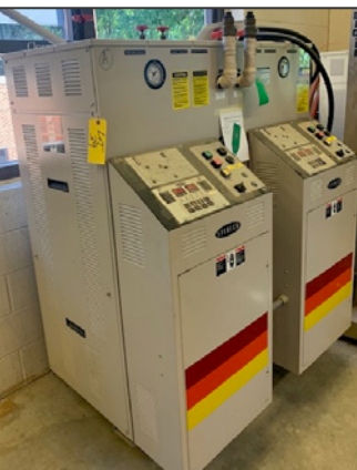
Partial view of STERLCO hot oil heaters available