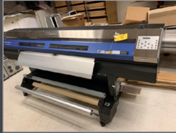
ROLAND SOLJET PRO XC-540 colour printer/plotter