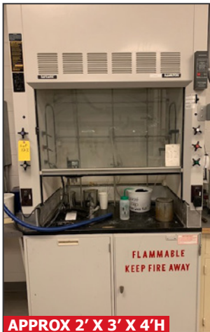
APPROX 2' X 3' X 4'H

HAMILTON fume hood with glass panel front