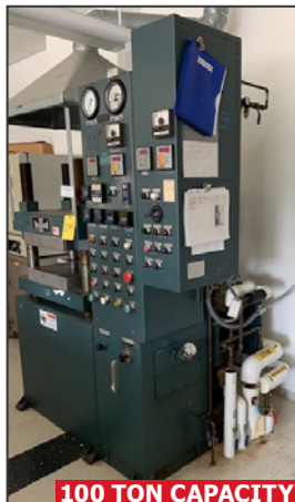
100 TON CAPACITY

WABASH MODEL 100-1818-2TSTM up-acting 4 post hydraulic lab press