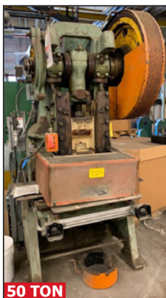
LJ PRESS mechanical OBI press