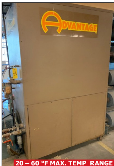
ADVANTAGE NC 10A-42-SB air cooled chiller