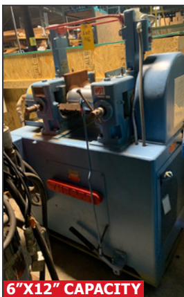
6"X12" CAPACITY THROPP 2 roll mill