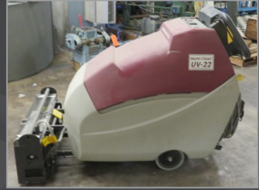
MULTI CLEAR UV22 walk-behind electric floor sweeper