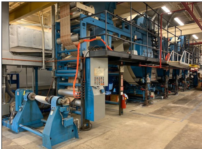
ROTOMECH ROTOGRAVURE approx. 35" 4 colour printing press