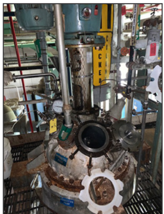
Black Knox Co. NB 5621 stainless steel jacketed reactor