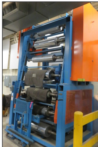
ROTOMECH roll storage racking system with elevator storage arms