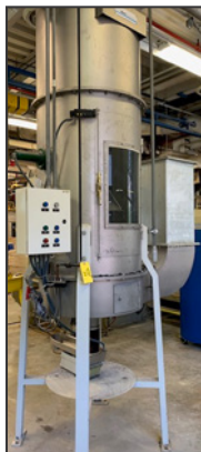
SS air cooled pellet cooling chamber