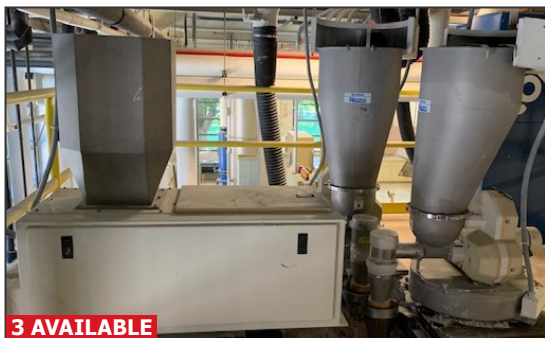
3 AVAILABLE KRON feeders