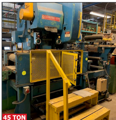
EW BLISS C-45 gap frame OBI punch press