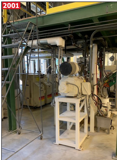
2001 BUSS PR 70 70mm pelletizing line