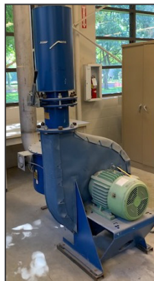
Pneumatic conveyor with blower