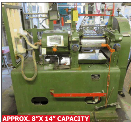
APPROX. 8"X 14" CAPACITY STEWART BOLLING & CO MODEL 5405 2 roll mill