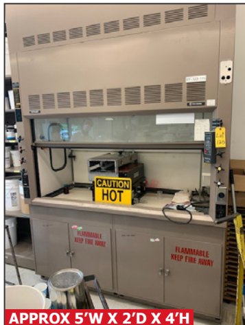
APPROX 5'W X 2'D X 4'H

PRECISION humidity controlled stainless steel electric oven