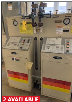
2 AVAILABLE STERLCO hot oil heaters