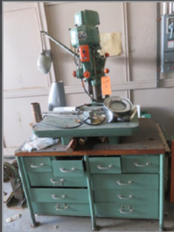
Bench type drill press