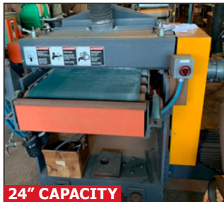
DUBOIS MACHINE CO SB-24 panel sander