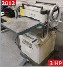
2012 GRIZZLY G0453PX planer