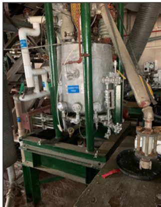
Stainless Steel jacketed reactor with agitator