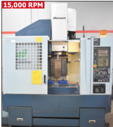
MATSUURA MC-660VG CNC vertical machining center