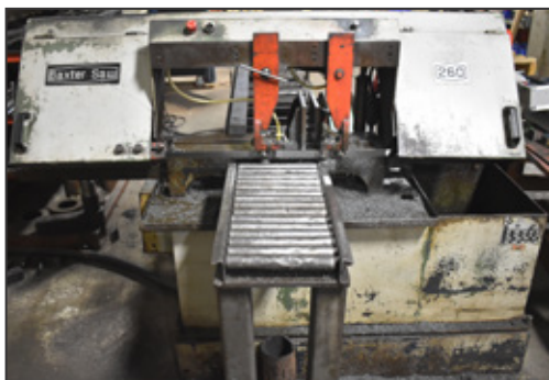
BAXTER VERTICUT MODEL 260 horizontal band saw