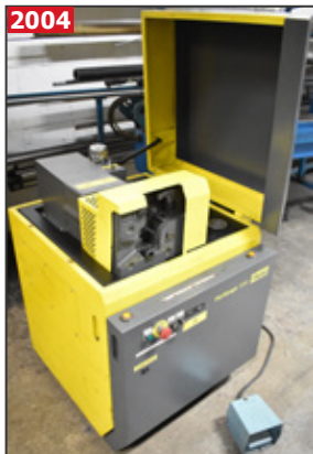
PARKER PARFLANGE 1040 hyd. tube flanging/flaring machine