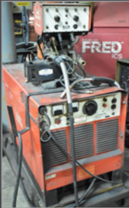
CANOX C-650-DW MIG welder

Tuesday, August 11 Burlington, Ontario, Canada