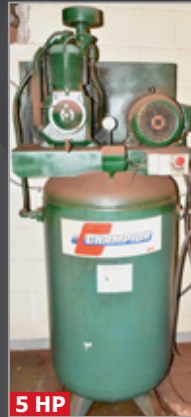
5 HP CHAMPION 5 HP air compressor