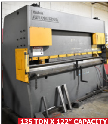
DARBERT AUTOBENDER MPF10-135 hydraulic press brake