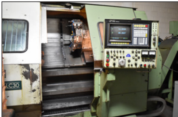
OKUMA LC30-1S CNC turning center