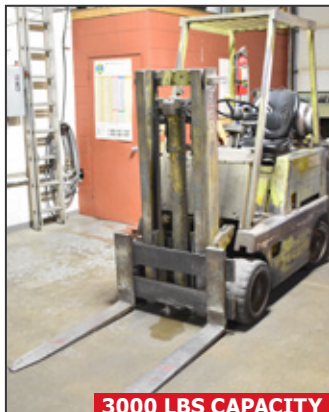
CLARK C300 LPG forklift