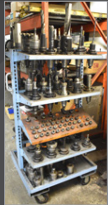
Partial view of CAT 50 tool holders available

FEATURING: (5) LISTA tool cabinets, (2) EQUIPTO tool cabinets, (3) 4-way brake dies, (120+) CAT 50 tool holders, (20) BT40 tool holders, LARGE QUANTITY of perishable tooling comprising DRILLS, END MILLS, CARBIDE INSERT tooling, TAPS & DIES, tie-down clamping, (2) self-dumping hoppers, MEWS rotary indexing head, (2) CM electric hoists, VARIETY of INSPECTION TOOLS including DIGITAL VERNIER CALIPERS, DIGITAL OUTSIDE MICROMETERS, STANDARD OUTSIDE MICROMETERS, office furniture and MUCH MORE!