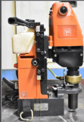
JEIN KBB38 mag-base drill