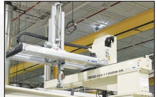
HI-MORE DES1100SW-2R robot