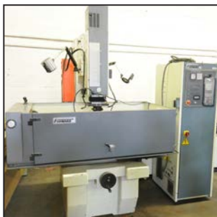
FORWARD 90A NC sinker type EDM