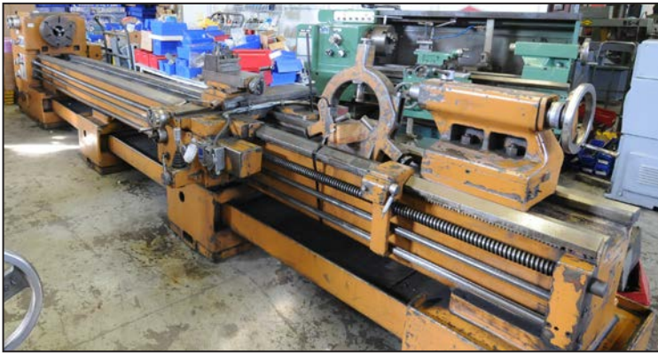
PBR TM-30-4000 gap bed engine lathe