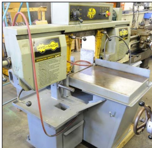
HYDMECH S20 SERIES II horizontal band saw