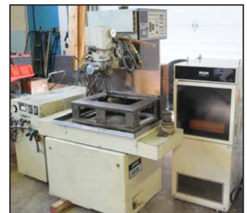
JAPAX JAPT3F-LU3B CNC wire EDM