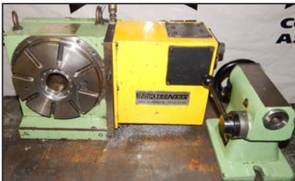
CNC 4TH axis rotary table