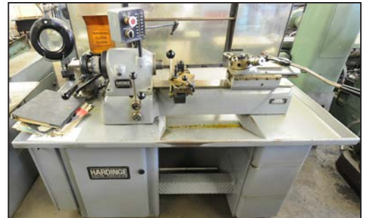
HARDINGE DV59/DSM-59 dove tail bed turret lathe