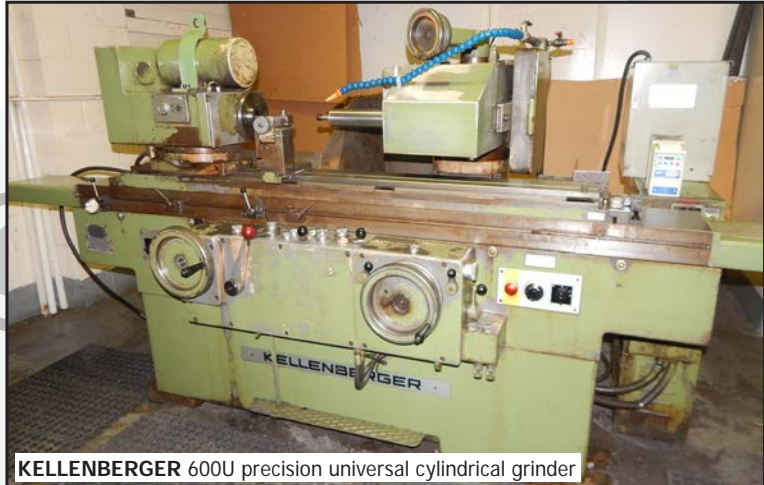
KELLENBERGER 600U precision universal cylindrical grinder

PROFESSIONALLY PACKAGED & READY FOR SHIPPING