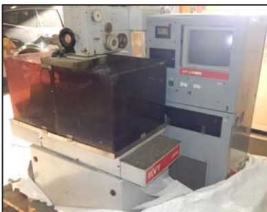
JAPAX ELVY CNC wire EDM (Professionally packaged & ready for shipping)