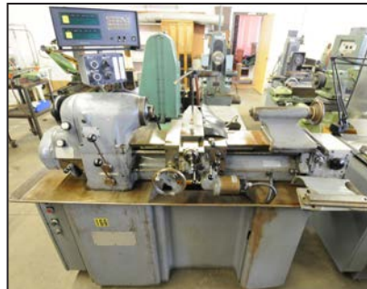
HARDINGE HLHV tool room lathe