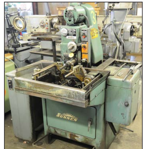
SUNNEN honing machine

FOR MORE DETAILED LISTINGS AND PHOTOS. www.corpassets.com