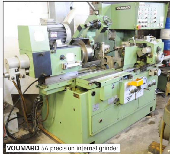
VOUMARD 5A precision internal grinder