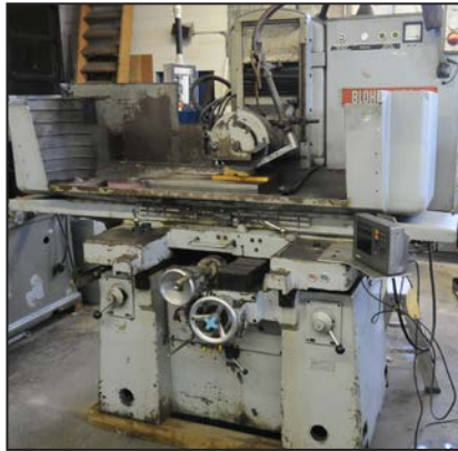
BLOHM HFS6 hydraulic surface grinder