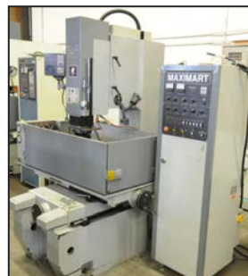
MAXIMART V45-75A sinker type EDM