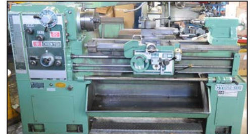
CHIEN-YEH MORTON CY405GX1000 gap bed engine lathe