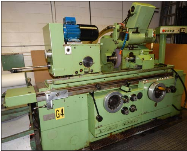
JOTES-SCHAUDT E450 NP precision universal cylindrical grinder