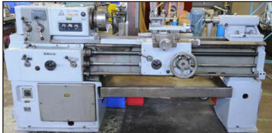
TOS SN40 gap bed engine lathe