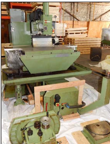
HERMLE UWF900E HS385 CNC universal milling machine