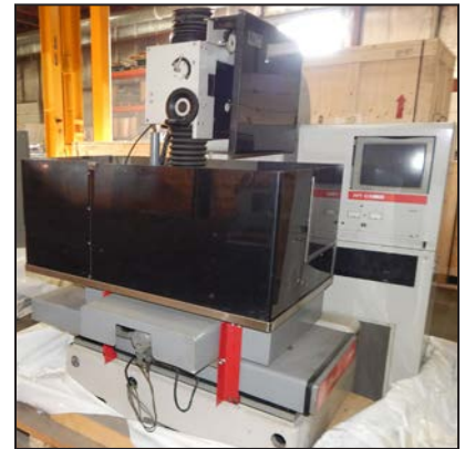
JAPAX LDM FULL AUTOMATIC-S CNC wire EDM (Professionally packaged & ready for shipping)