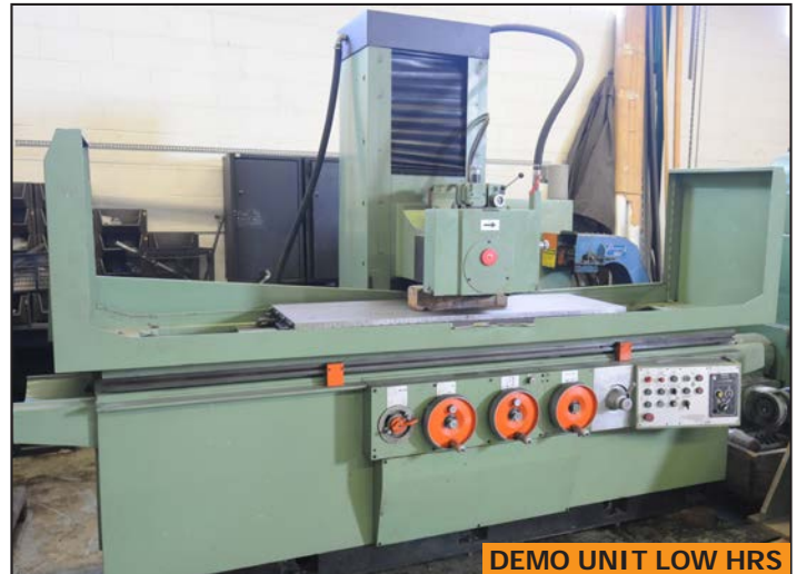
CUMMET BM612 hydraulic surface grinder