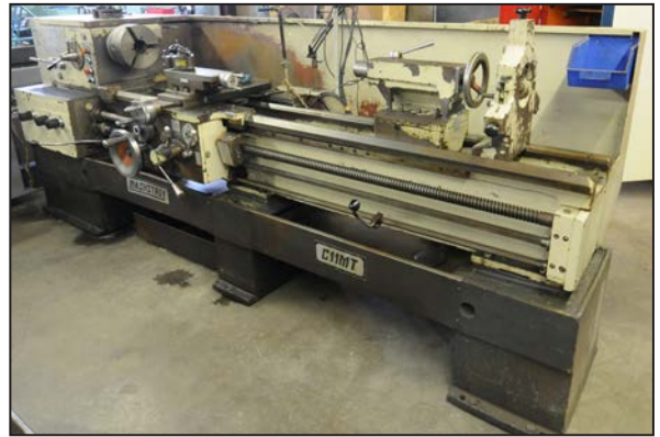
SOPHIA MASHSTROY C11MT gap bed engine lathe