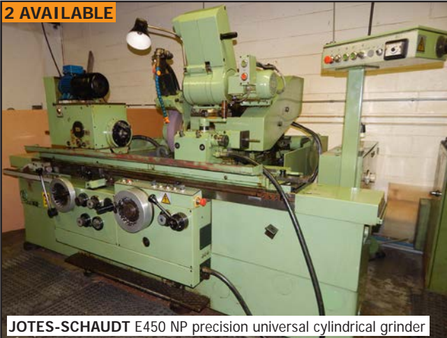
JOTES-SCHAUDT E450 NP precision universal cylindrical grinder