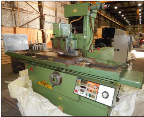
ELB SCHLIFF SWN10ND hydraulic surface grinder (Professionally packaged & ready for shipping)