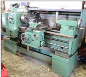
TOS SUI 50 engine lathe