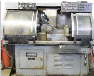
HARDINGE AHC super precision turret lathe