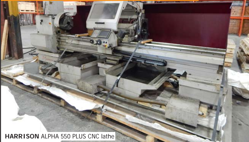
HARRISON ALPHA 550 PLUS CNC lathe

PROFESSIONALLY PACKAGED & READY FOR SHIPPING