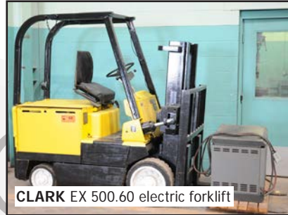
CLARK EX 500.60 electric forklift