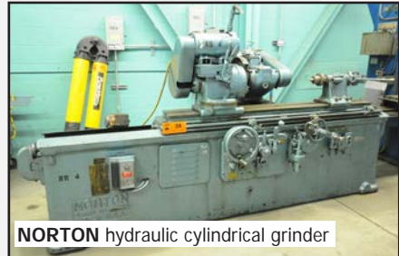
NORTON hydraulic cylindrical grinder