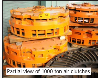
Partial view of 1000 ton air clutches