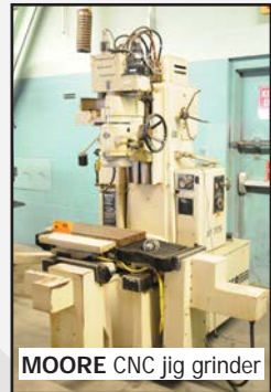
MOORE CNC jig grinder