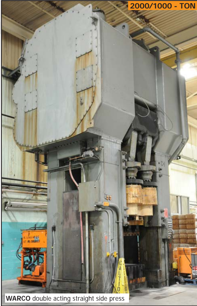
2000/1000 - TON

MAJOR AUTOMOTIVE & ALUMINUM FOUNDRY SURPLUS EVENT