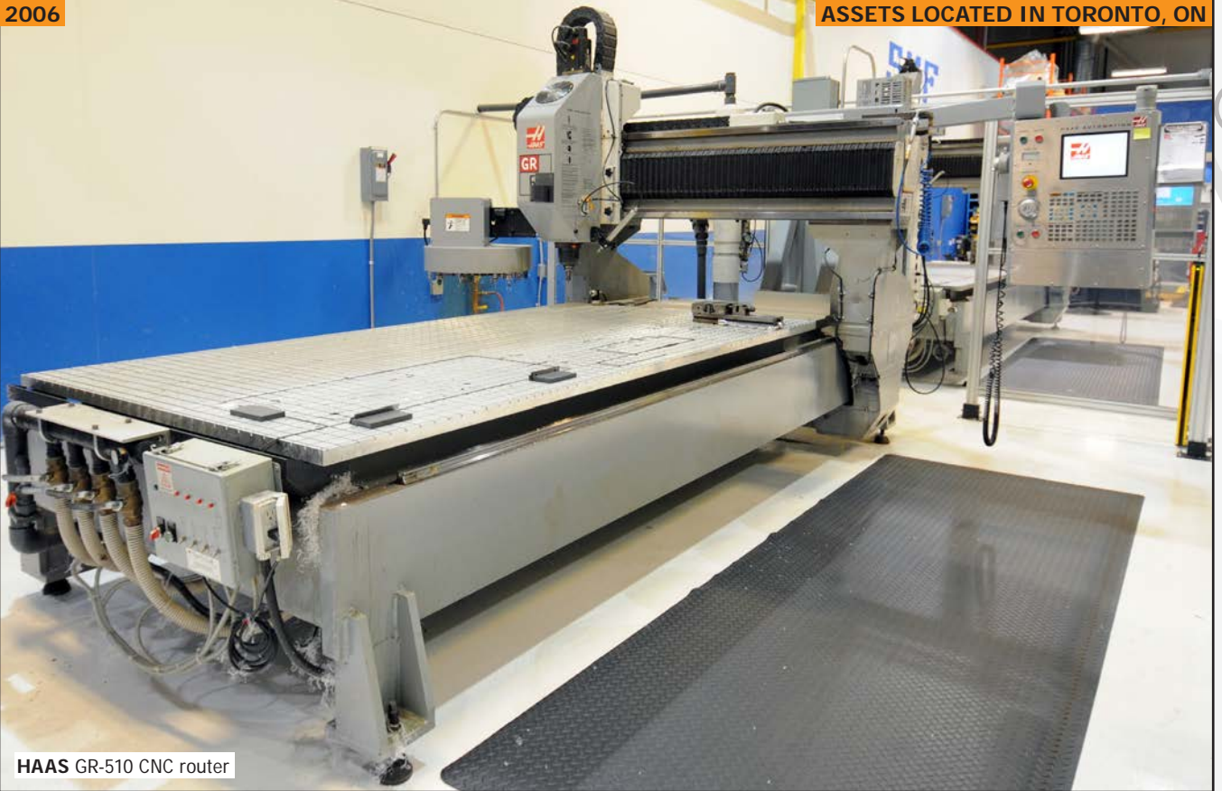
HAAS GR-510 CNC router