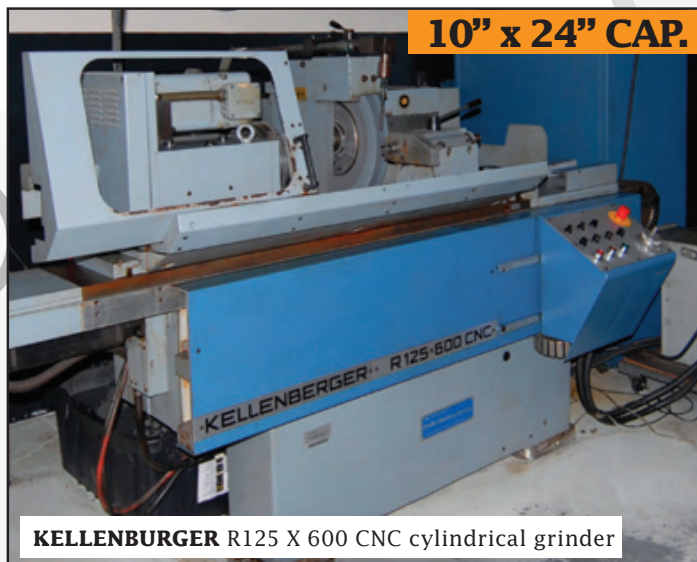
KELLENBURGER R125 X 600 CNC cylindrical grinder