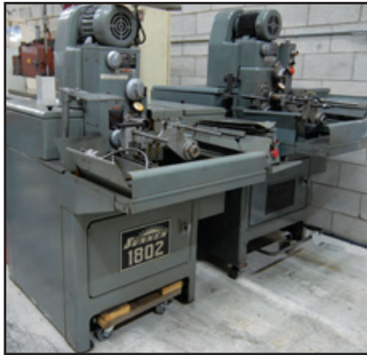
SUNNEN MBB-1800 & MBC-1802 hones