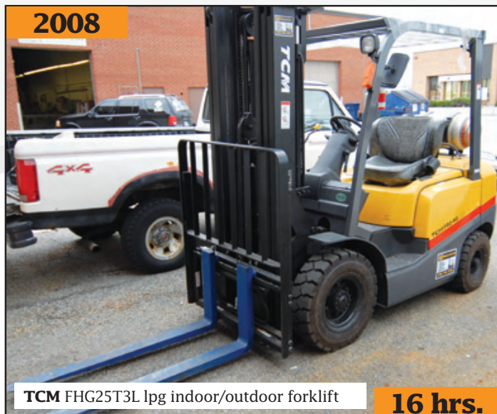
TCM FHG25T3L lpg indoor/outdoor forklift