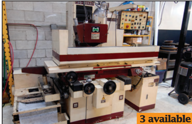
CHEVALIER FSG-1224AD automatic hydraulic surface grinders