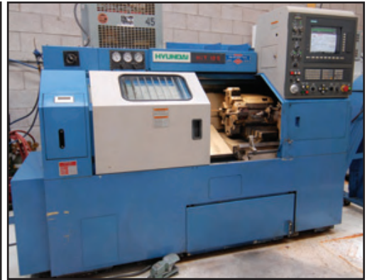
HYUNDAI HIT 18S CNC turning center