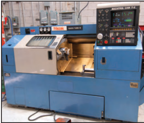
MAZAK QUICK TURN 15 CNC turning center