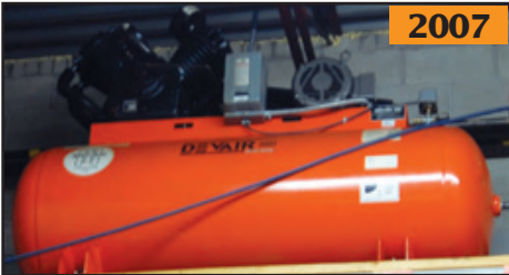
DEVAIR 15-hp air compressor