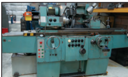
TOS BHU 25 universal cylindrical grinder