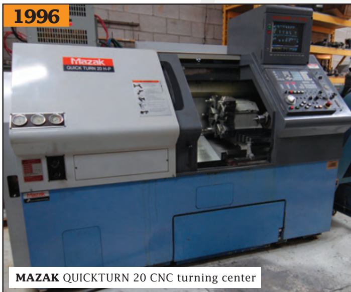
MAZAK QUICKTURN 20 CNC turning center