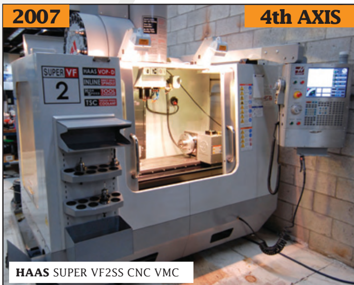
HAAS SUPER VF2SS CNC VMC