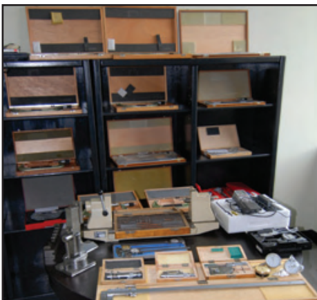
view of inspection equipment