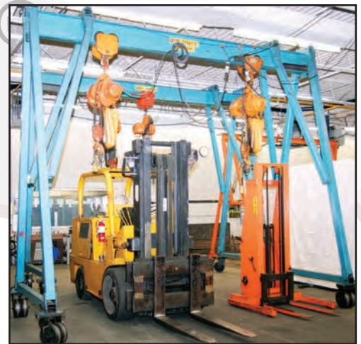
View of Material Handling Equipment