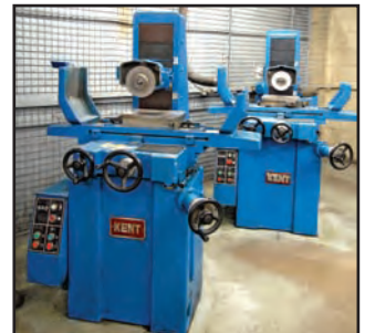
KENT 6" X 12" manual surface grinders