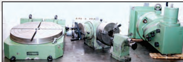
View of Machine Accessories

ALSO: 10' X 12' portable office, granite & steel surface plates, work benches, vices, stands, carts, cabinets, angle plates to 48" X 24", parallels, magnets, racks, etc.