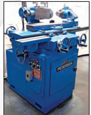
PEDERSEN USL tool & cutter grinder