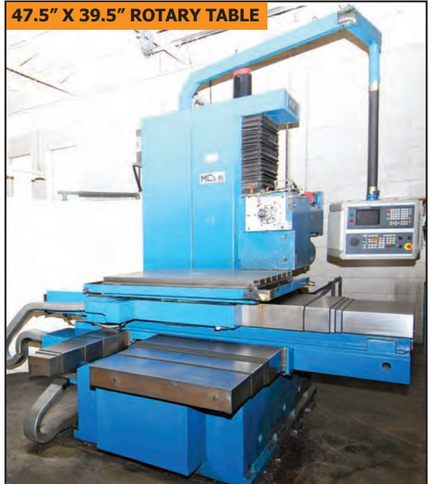
MONTI MCS 85 CNC table type HBM

MORE DETAILED LISTINGS AND PHOTOS www.corpassets.com