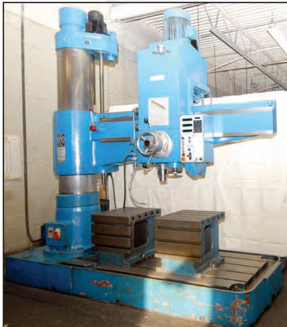
CSEPEL HFR/75-2000 6' radial arm