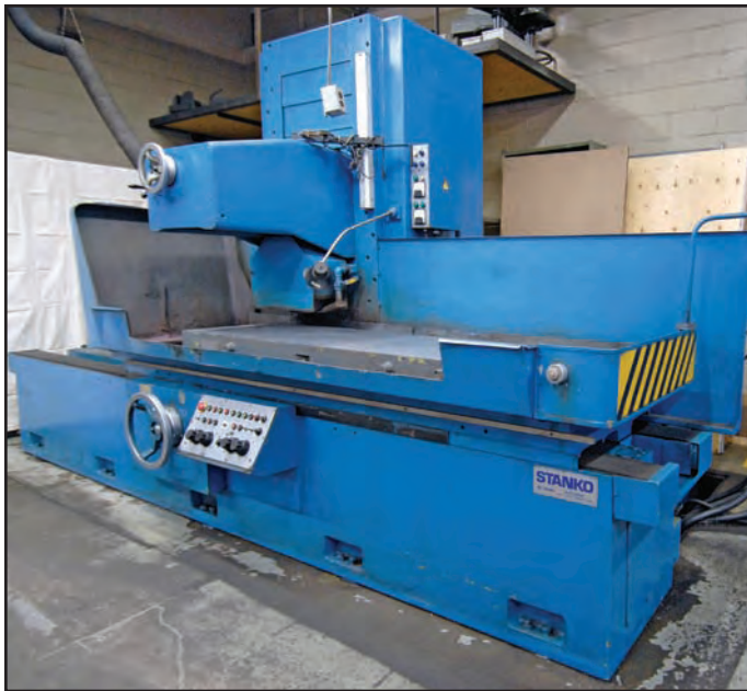
STANKO 79" X 24.5" hydraulic surface grinder