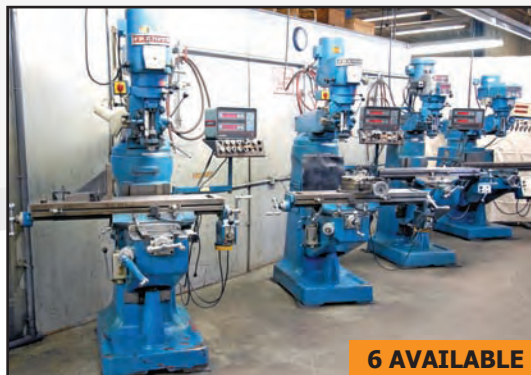
Partial View Of Milling Machines Available