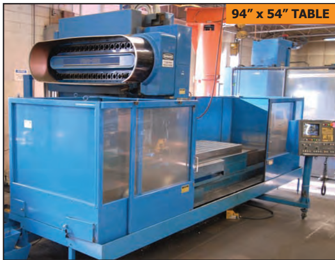
94" x 54" TABLE