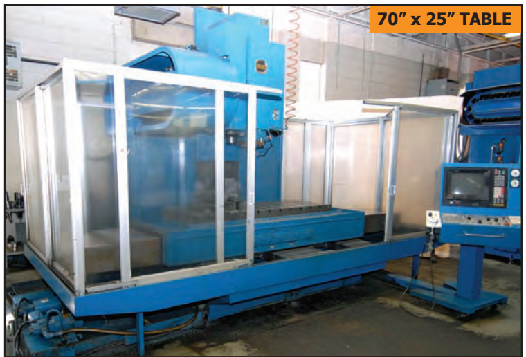
70" x 25" TABLE