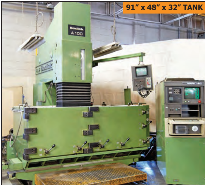
SODICK A10C CNC sinker type EDM