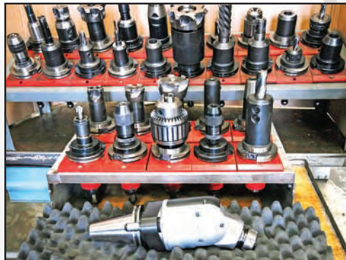
Tool Holders & Milling Head