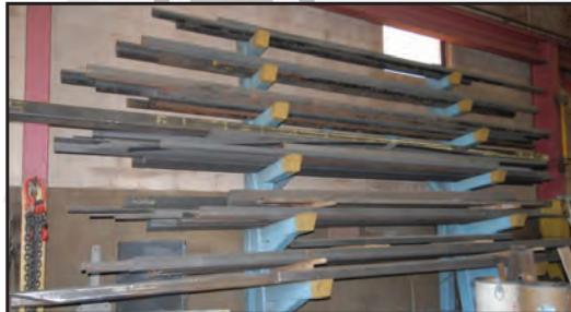
View of steel