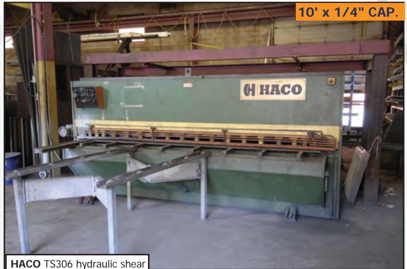
10' x 1/4" CAP.