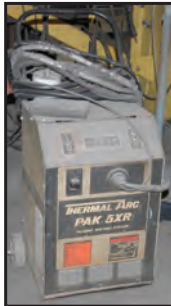
THERMAL ARC plasma cutter