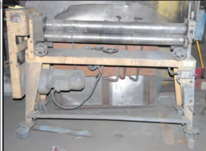
METALEX METALSTARR 50/10 50" x 10 ga. power bending roll