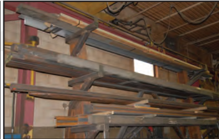
View of steel