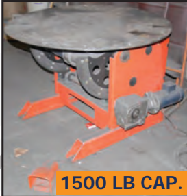
1500 LB CAP.