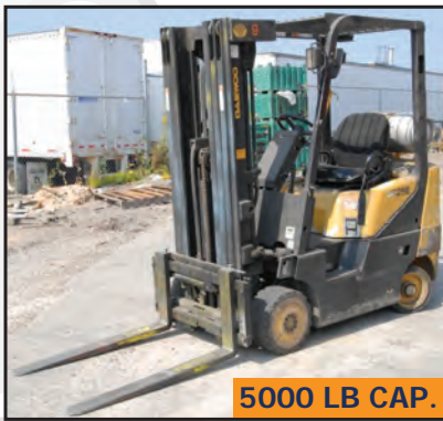
5000 LB CAP.