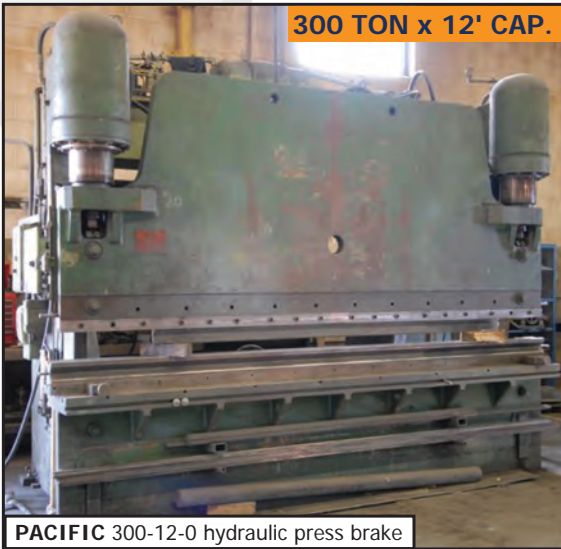
300 TON x 12' CAP.