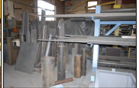
View of steel