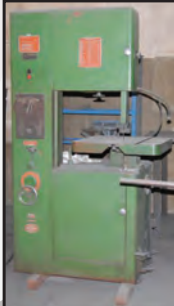
POWERMATIC band saw