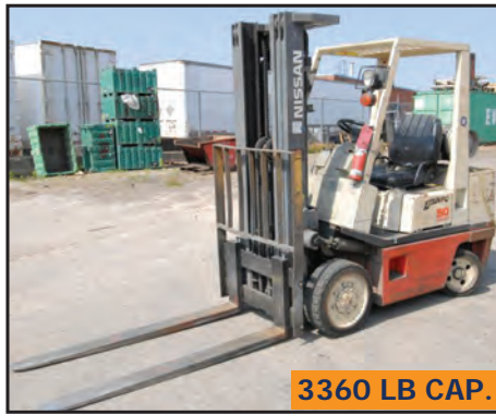
3360 LB CAP.