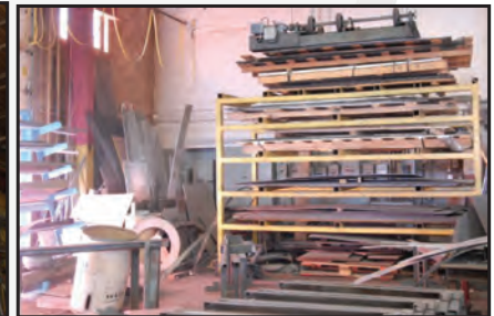
View of steel