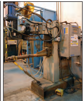
AH rocker arm spot welder