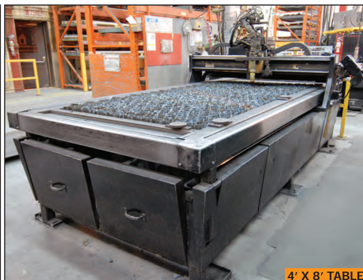
HYPERTHERM HD 3070, CNC plasma cutting system