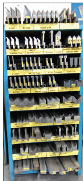
View of AMADA press brake dies