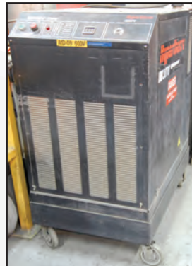
HYPERTHERM 3070 plasma power supply