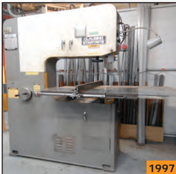
CLAUSING STARTRITE vertical band saw

MFG UNKNOWN vertical band saw with 30" throat, 25" x 39" table, 12" max work piece height, s/n n/a