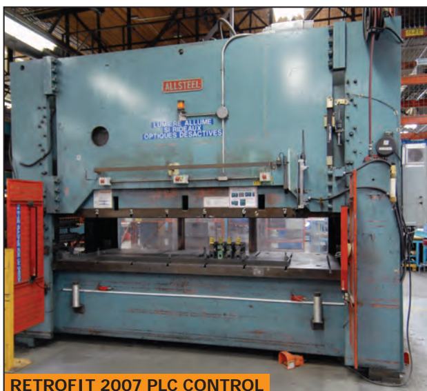
ALLSTEEL 200-10x4, 200 ton hydraulic press