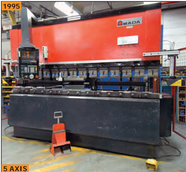
AMADA 1253F, 125 ton CNC hydraulic press brake