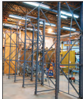
STANLEY VIDMAR STACK SYSTEM storage retrieval system