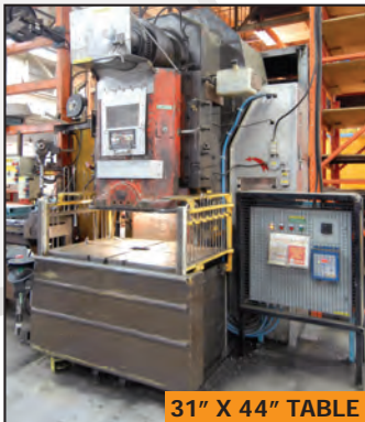
31" X 44" TABLE