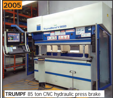
TRUMPF 85 ton CNC hydraulic press brake