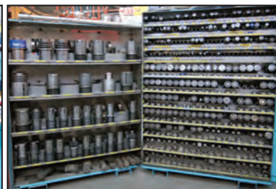
Partial view of punch tooling available