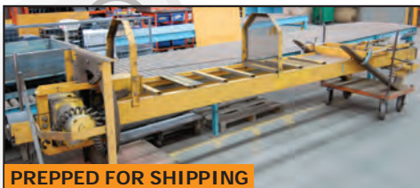
PREPARED FOR SHIPPING

KALAMAZOO 36" x 4" horizontal belt sander with 3 HP, s/n n/a