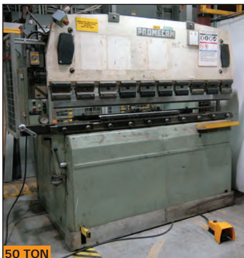
AMADA PROMECAM RG 50-20 hydraulic press brake