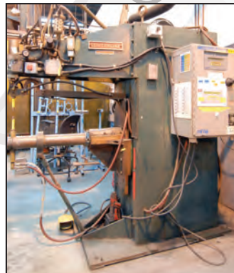
CENTRELINE rocker arm spot welder