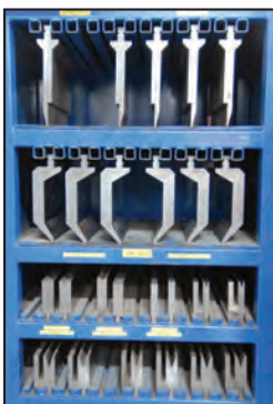
View of TRUMPF press brake dies