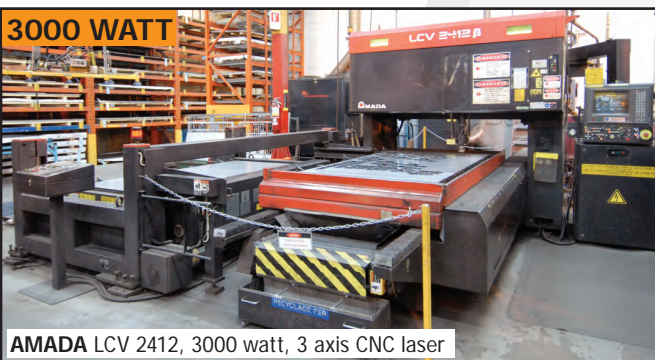
AMADA LCV 2412, 3000 watt, 3 axis CNC laser