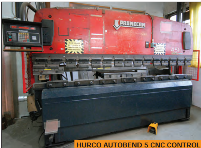
AMADA PROMECAM RG-103, 110 ton CNC hydraulic press brake