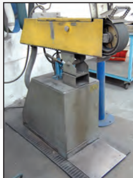
KALAMAZOO belt sander