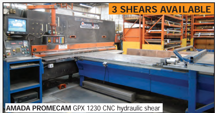
AMADA PROMECAM GPX 1230 CNC hydraulic shear

LATE MODEL & HEAVY CAPACITY CNC FABRICATING FACILITY LIVE OFFSITE & ONLINE AUCTION