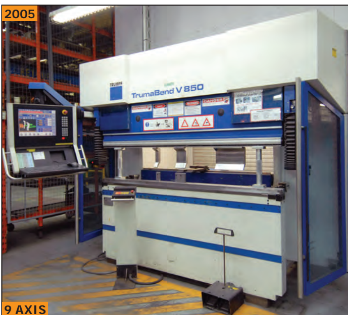
TRUMPF TRUMABEND V850 85 ton CNC hydraulic press brake