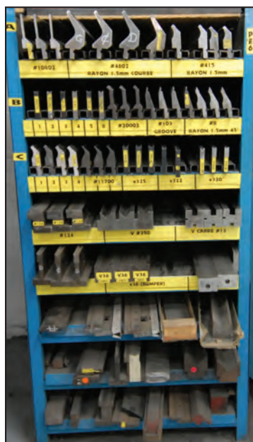
View of AMADA press brake dies