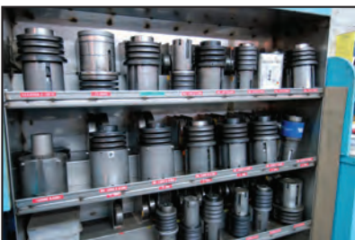
Partial view of punch tooling available