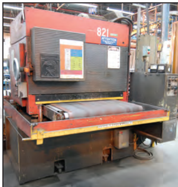
TIMESAVERS dual head, wet type belt sander