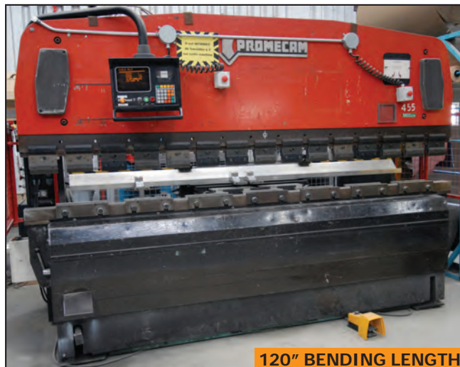
AMADA PROMECAM RG-103, 110 ton CNC hydraulic press brake