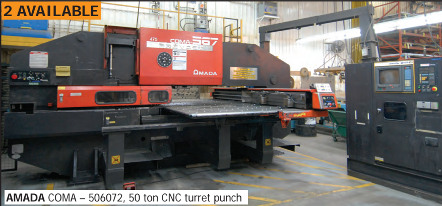
AMADA COMA – 506072, 50 ton CNC turret punch