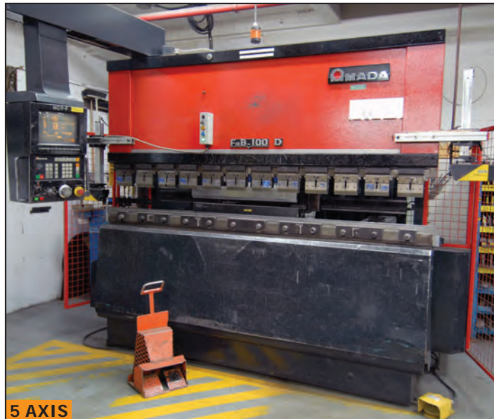
AMADA 1025F, 100 ton CNC hydraulic press brake