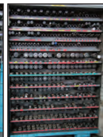
Partial view of punch tooling available