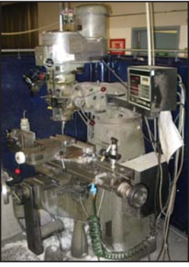
BRIDGEPORT CNC milling machine