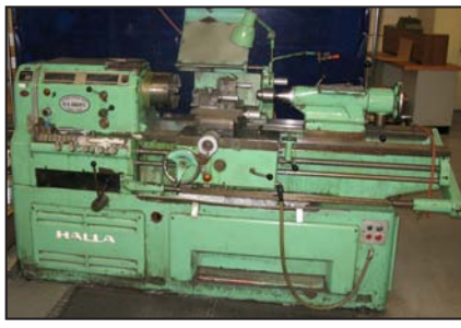
HALLA engine lathe