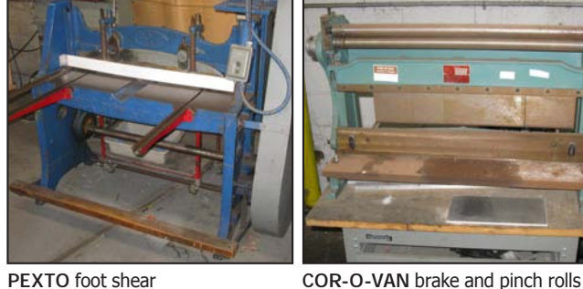
PEXTO foot shear