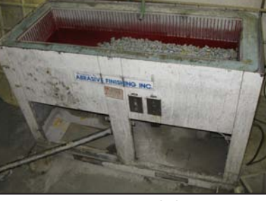
ABRASIVE FINISHING de-burring system