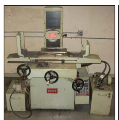
KENT 6" X 12" surface grinder