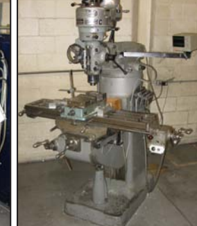
Vertical milling machine Vertical milling machine