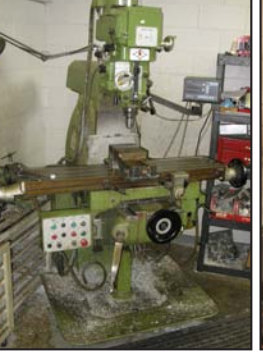
Vertical milling machine

This brochure is only a partial listing. PLEASE VISIT OUR WEBSITE FOR MORE DETAILED LISTINGS AND PHOTOS www.corpassets.com