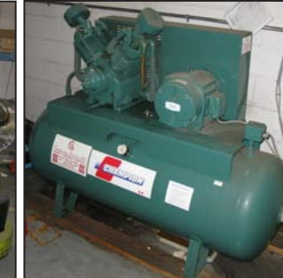
CHAMPION 25 HP air compressor