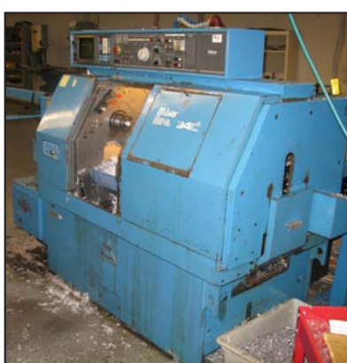
MIYANO CNC turning center