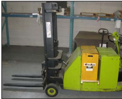
CLARK electric forklift