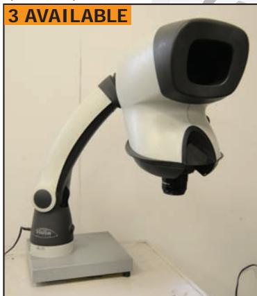
VISION ENGINEERING MANTIS microscope