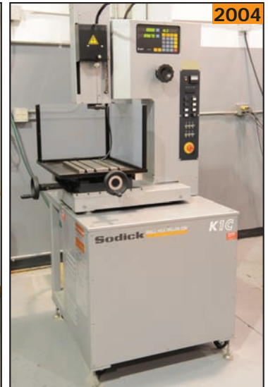
SODICK K1C EDM small hole drill