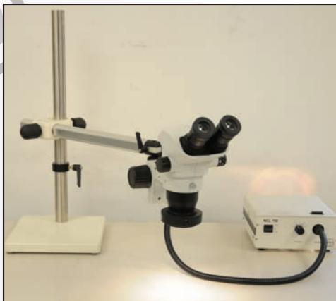
OLYMPUS SZ51 microscope