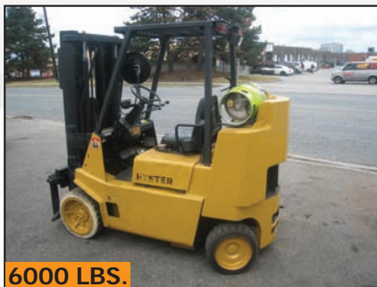
6000 LBS. HYSTER H60XM LPG fork lift