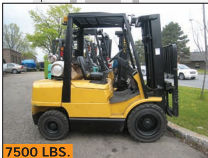
7500 LBS. HYSTER S80XLBCS LPG fork lift