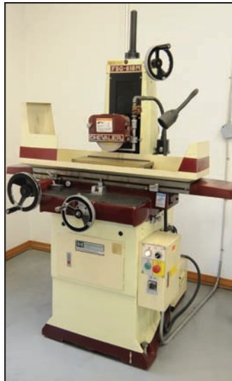
CHEVALIER M618 surface grinder