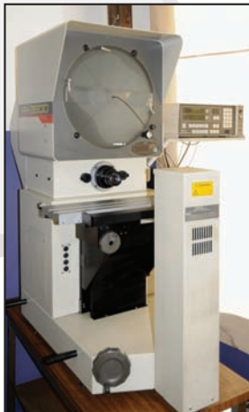
MITUTOYO PH3500 14" optical comparator