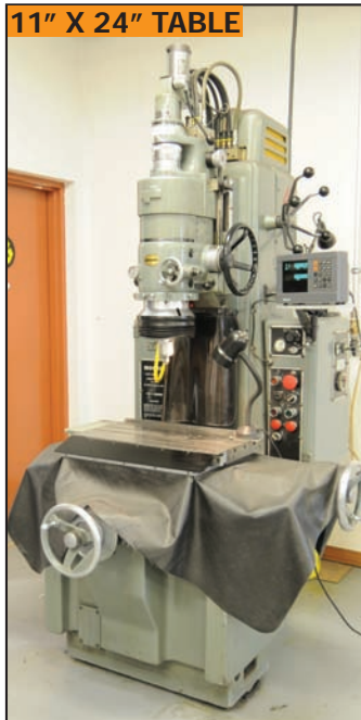
MOORE 3 jig grinder