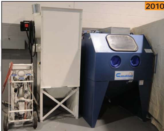
AXXIOM/CANABLAST soda blast system