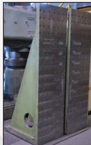
(2) 84" x 24" angle plates