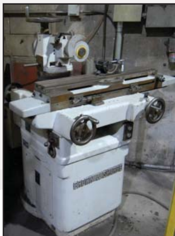
BROWN & SHARPE grinder