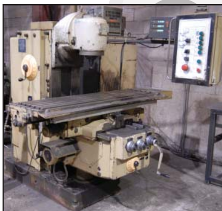
WMW FW 315 2/PS horizontal mill