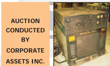
THERMAL DYNAMICS PAK 45 plasma unit