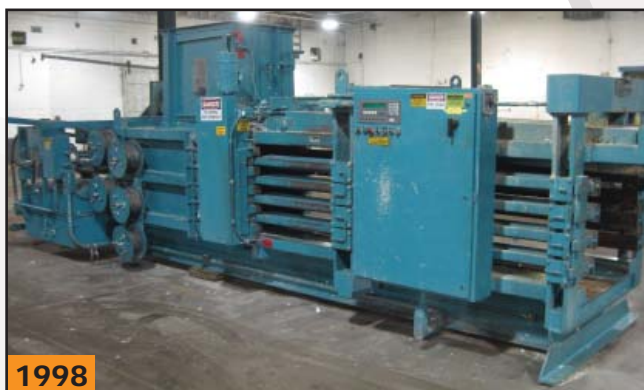
1998 KERNIC 50 HP 10 wire baler