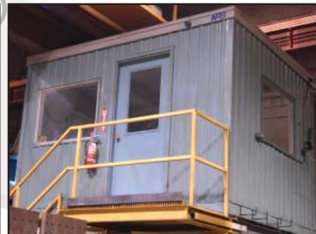
NRB portable office 12ft x 8ft x 8ftH