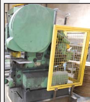
FPA NU13B ironworker

AUCTION CONDUCTED BY CORPORATE ASSETS INC.