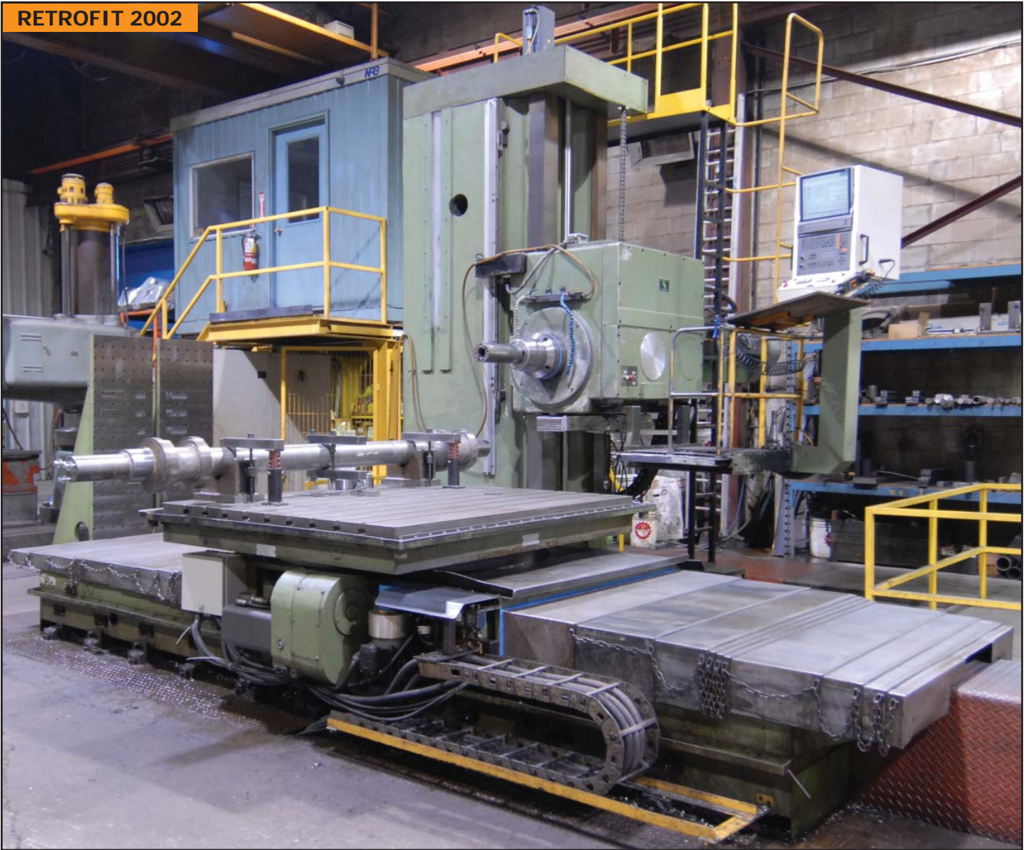
DOMINION CNC table type horizontal boring mill