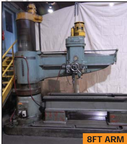
ARCHDALE radial arm drill