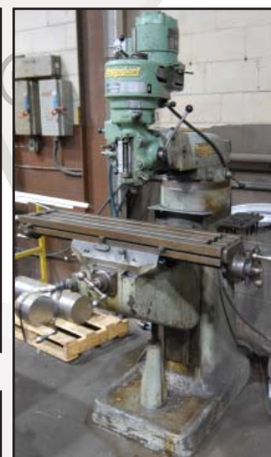
BRIDGEPORT vertical mill