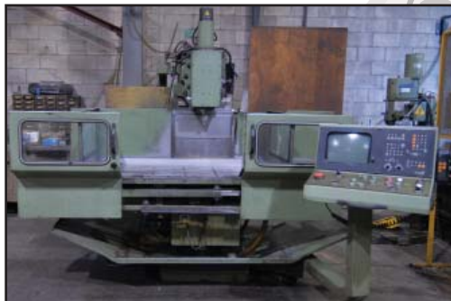
TOS FGS 40/50 CNC vertical machining center