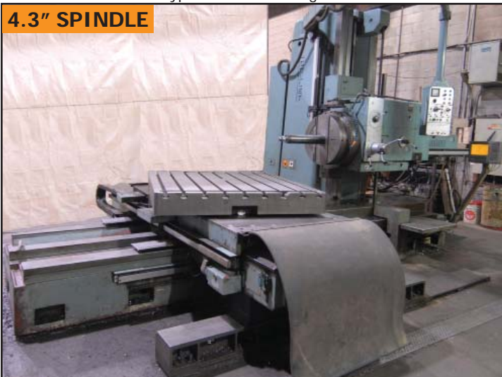
COLLET & ENGELHARDT RC 4-60 table type horizontal boring mill