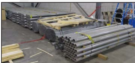
View of EMT conduit