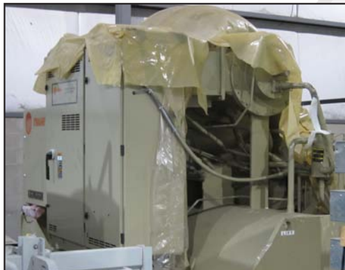
TRANE CVHF 485 500 ton chiller