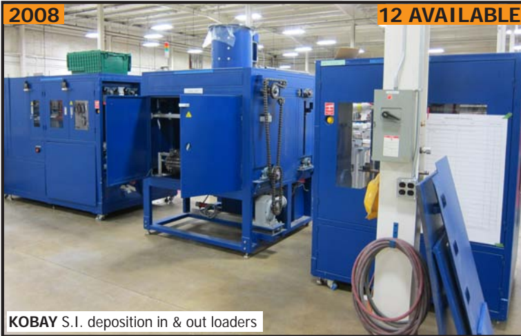
KOBAY S.I. deposition in & out loaders