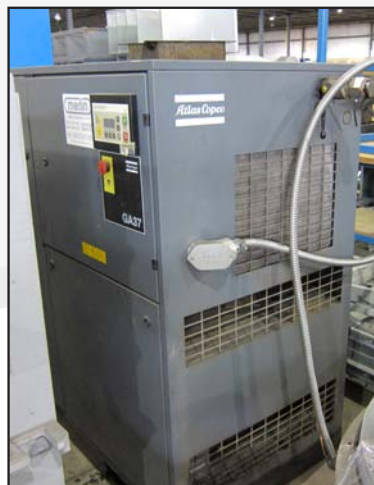
ATLAS COPCO GA37 air compressor