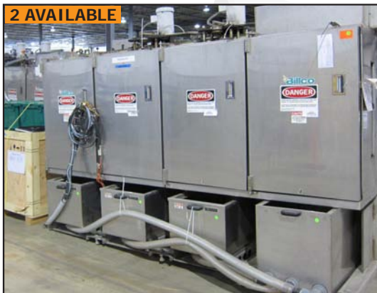
BILLCO V20 4 station vertical brush wash unit