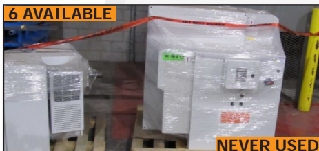
ABB variable frequency drives