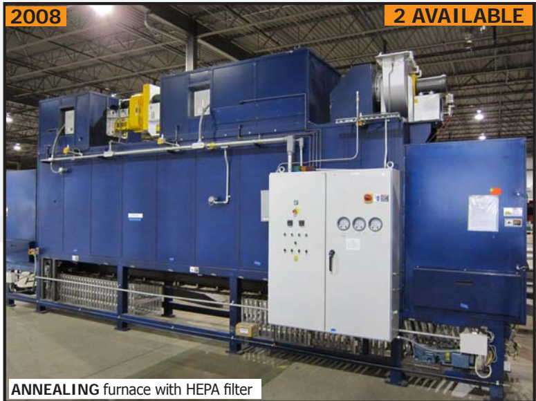
ANNEALING furnace with HEPA filter

HUNDREDS OF LOTS OF FACTORY EQUIPMENT, MACHINE TOOLS, AND SOLAR PANEL SUPPORT EQUIPMENT