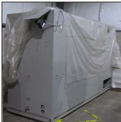
BRYAN HE RV450 gas fired steam boiler