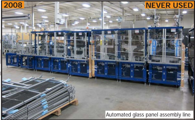
Automated glass panel assembly line