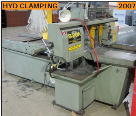
HYD-MECH S20 A horizontal bandsaw