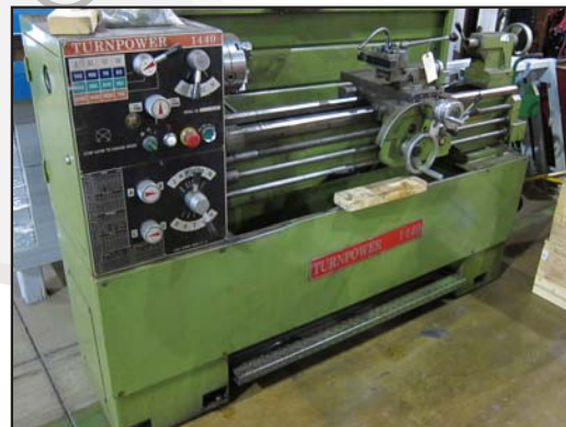
TURNPOWER 1440 lathe