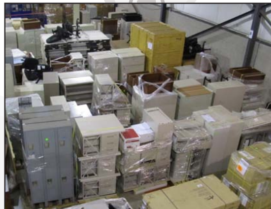
Partial view of office furniture available