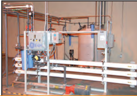
WATER SOFTENING SYSTEMS