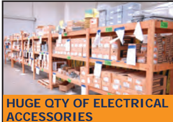
HUGE QTY OF ELECTRICAL ACCESSORIES