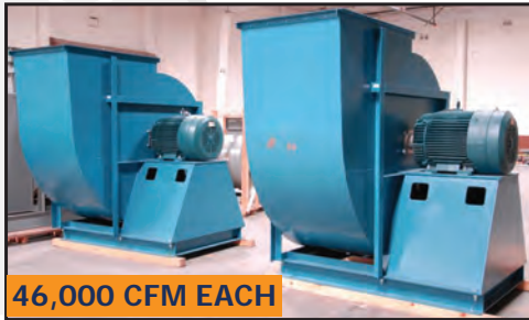
46,000 CFM EACH

ALL ITEMS ARE 2008 OR NEWER & BRAND NEW, NEVER USED