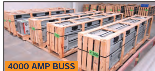
4000 AMP BUSS