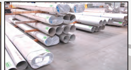
Stainless steel piping

BRAND NEW SURPLUS EQUIPMENT TO A SOLAR PANEL MANUFACTURER - OVER 1000 LOTS!