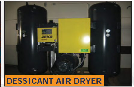
DESSICANT AIR DRYER