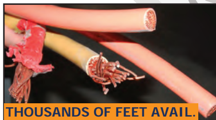
THOUSANDS OF FEET AVAILABLE.