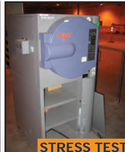
STRESS TEST SYSTEM