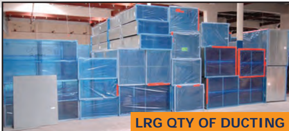
LRG QTY OF DUCTING