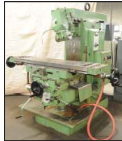
FEXAC milling machine