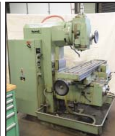
HMT milling machine