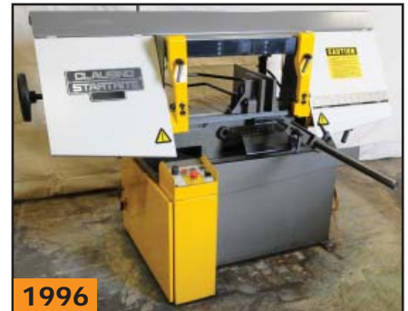
1996 CLAUSING STARTRITE HB208M horizontal metal cutting saw