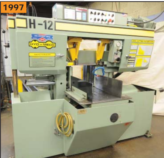
HYD-MECH H-12 dual column horizontal metal cutting saw