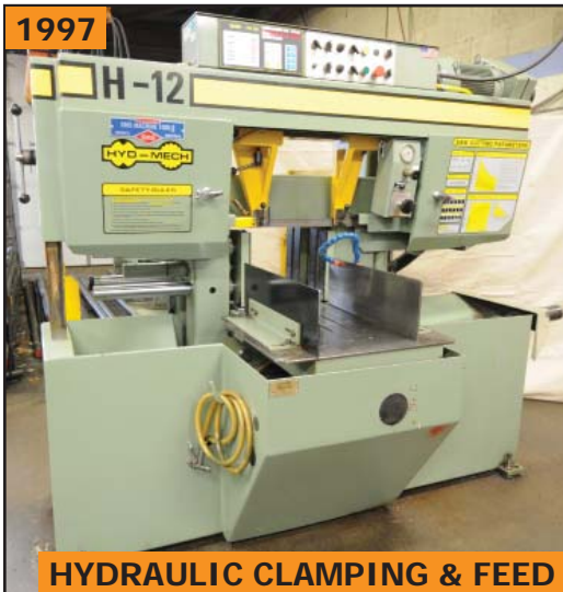
1997 HYD-MECH H-12 dual column horizontal metal cutting saw