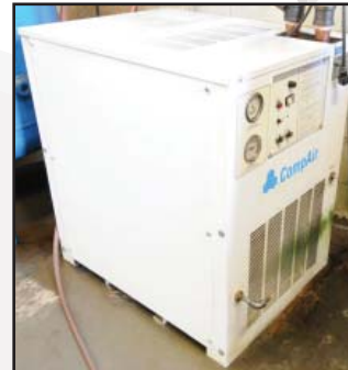
COMPAIR K100A air dryer