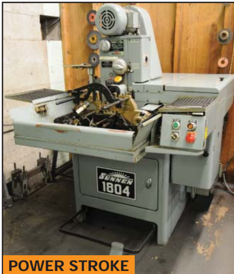
POWER STROKE SUNNEN MBC-1804M horizontal mandrel type honing machine