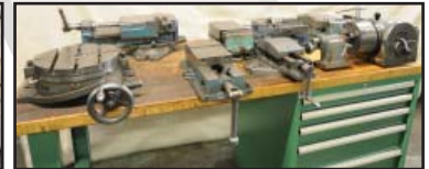
Machine tool accessories