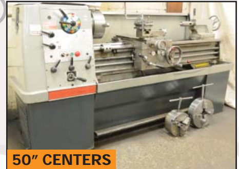
COLCHESTER TRIUMPH 2000 gap bed engine lathe