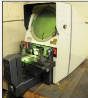
BATY SHADOWMASTER optical comparator