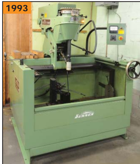
1993 SUNNEN CU-16 vertical mandrel type honing machine