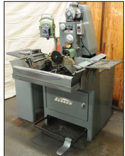
SUNNEN MBC-1660-K horizontal mandrel type honing machine