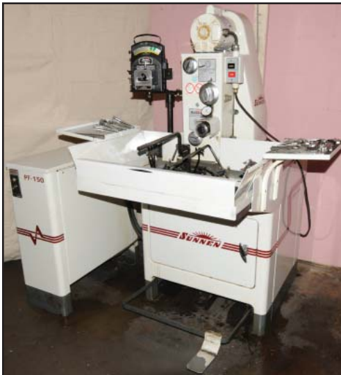
SUNNEN MBB-1660-K horizontal mandrel type honing machine