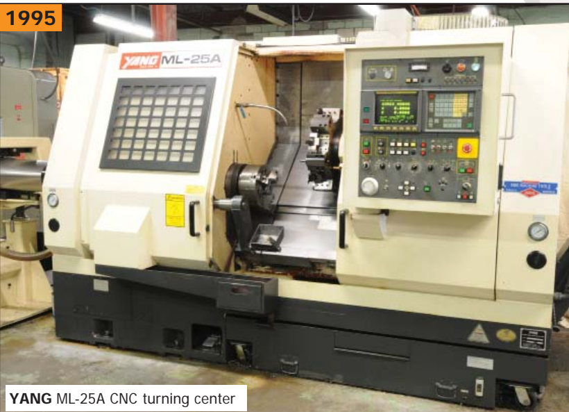
YANG ML-25A CNC turning center