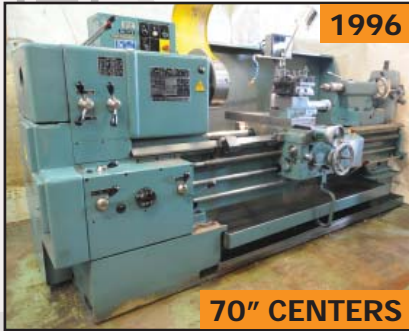
TOS SN71C gap bed engine lathe