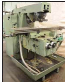
HMT milling machine