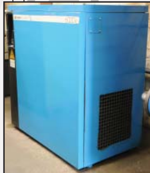
COMPAIR BROOMWADE 6000E air compressor