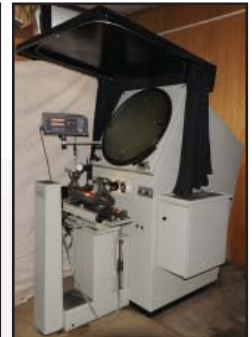
PRAZIS optical comparator

AUCTION CONDUCTED BY CORPORATE ASSETS INC.