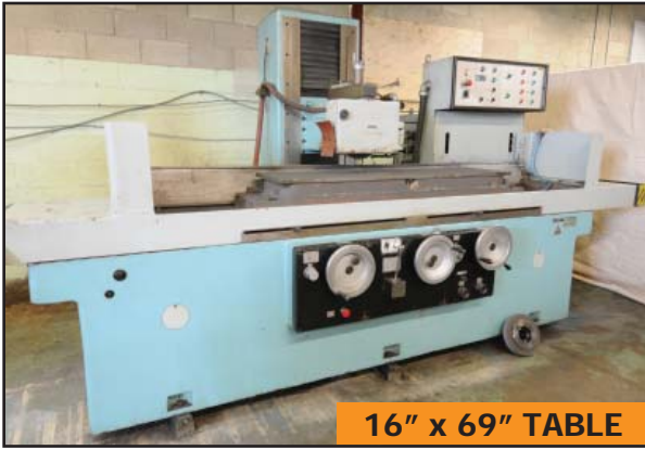
16" x 69" TABLE