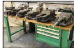
Machine tool accessories