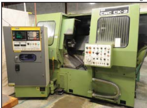
YAM CK-2 CNC turning center

LIPE 225 pneumatic bar feeder, S/n 13976