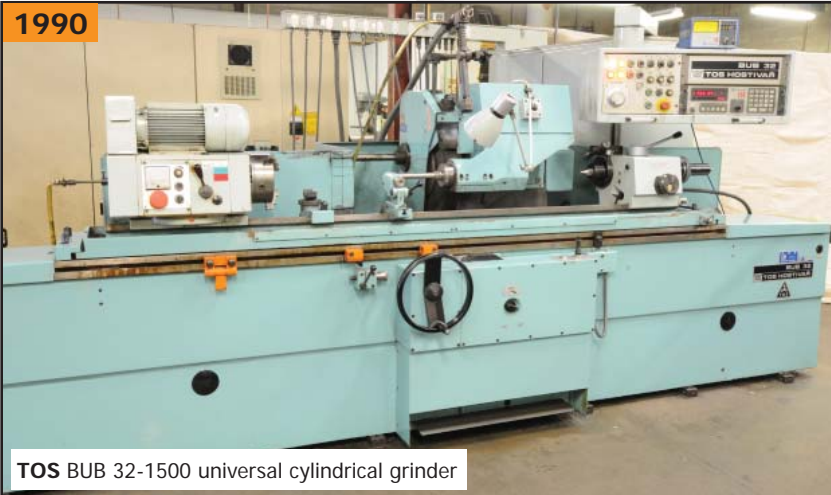
TOS BUB 32-1500 universal cylindrical grinder