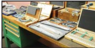
Partial view of inspection equipment