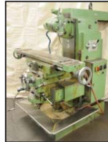
FEXAC milling machine