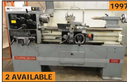
CLAUSING METOSA C1440 gap bed engine lathe