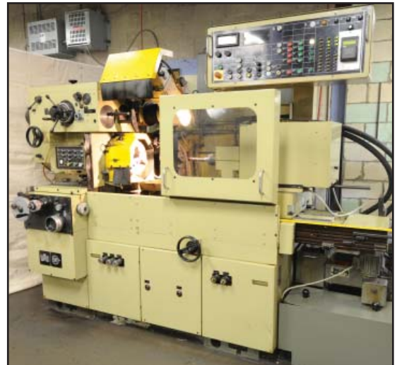
WMW automatic I.D. bore grinder