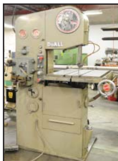
DO-ALL 1612-3 vertical bandsaw