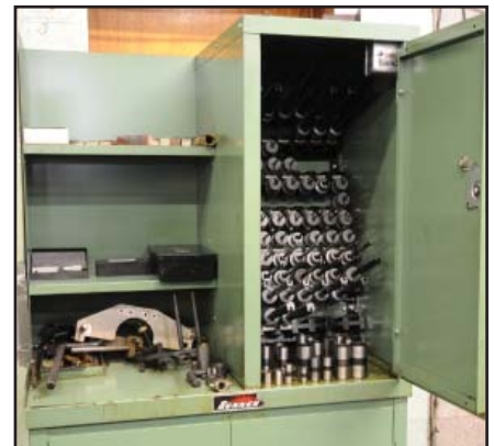
Partial view of hone tooling available