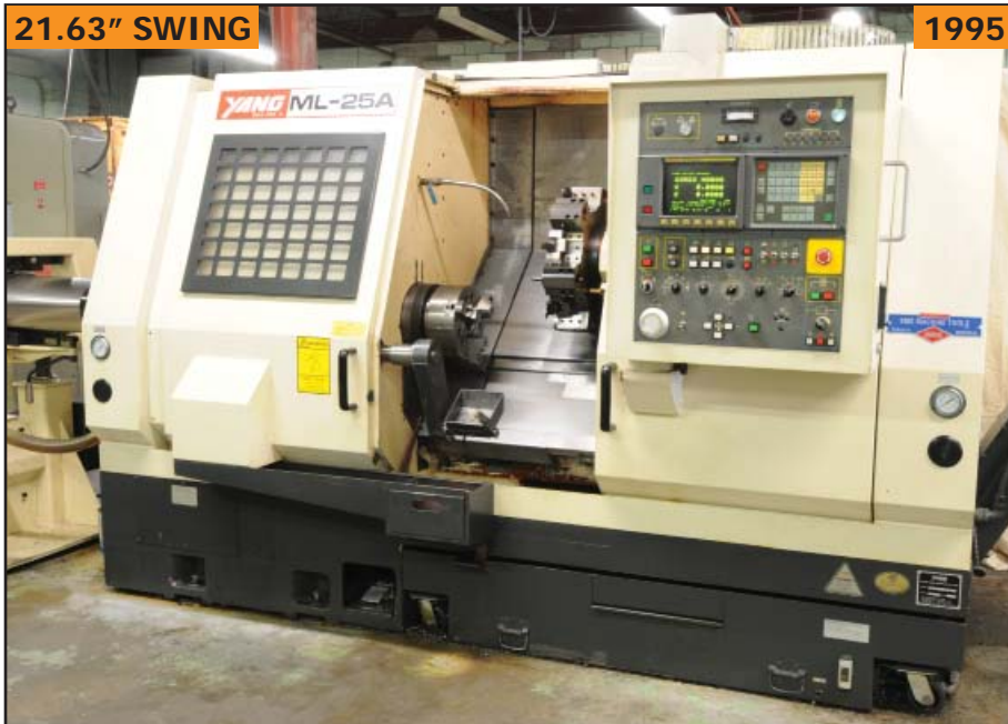
YANG ML-25A CNC turning center