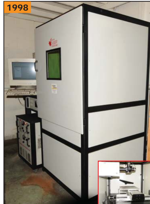
CANADIAN LASER TECHNOLOGIES 100 WATT 3 axis table type CNC laser etcher/marker