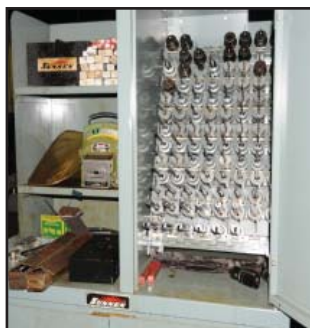
Partial view of hone tooling