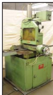
WALTER VMS4SPV cut off saw

AUCTION CONDUCTED BY CORPORATE ASSETS INC.