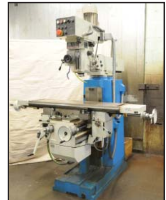
TOS FMK25A vertical milling machine