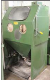
EMPIRE shot blast cabinet