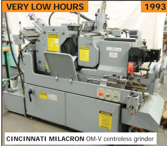
CINCINNATI MILACRON OM-V centreless grinder

WELL MAINTAINED CNC MACHINE SHOP & PRECISION GRINDING FACILITY