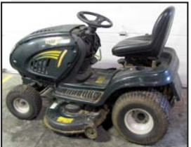
YARDWORKS 19HP, 42" riding lawnmower