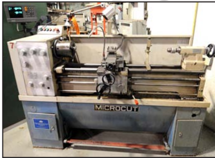
MICROCUT gap bed tool room lathe