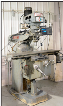
KONDIA FV-1 vertical milling machine