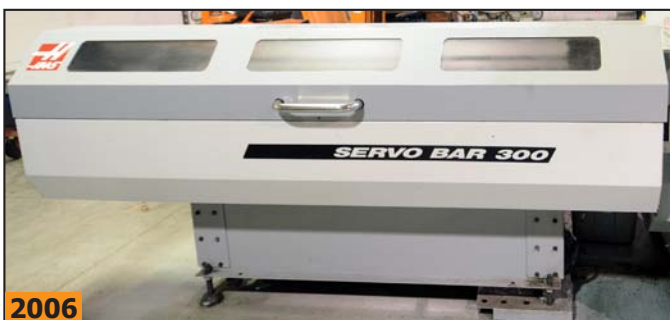
HAAS BAR 300 bar feeder