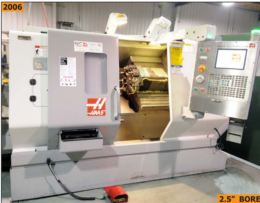
HAAS SL-20B CNC turning center