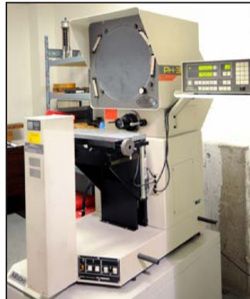
MITUTOYO PH-3500 14" optical comparator