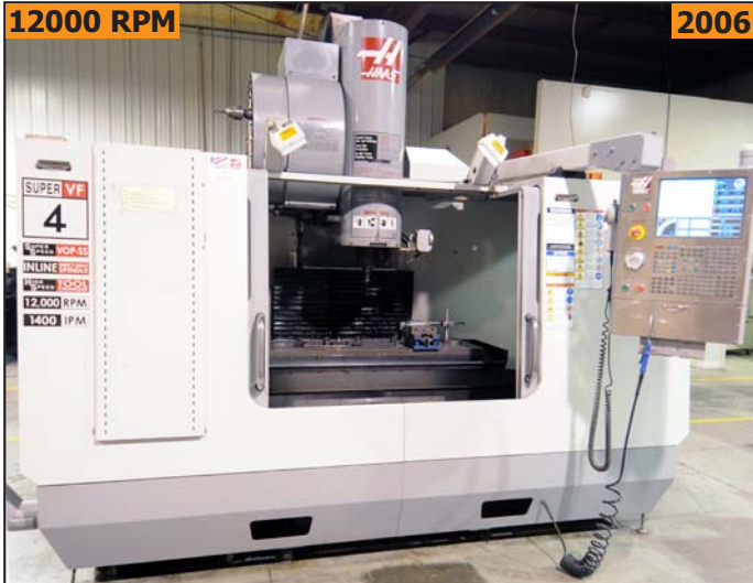
HAAS VF4SS CNC vertical machining center