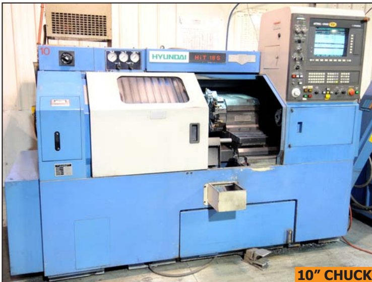
HYUNDAI HIT 18S CNC turning center