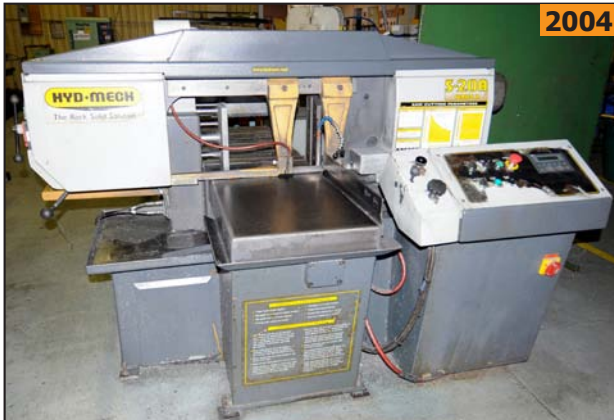
HYD MECH S20A automatic horizontal band saw