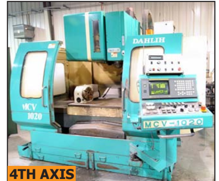
DAHLIHL DL-MCV 1020 B CNC vertical machining center