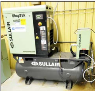
SULLAIR SHOPTEK ST 500 rotary screw air compressor