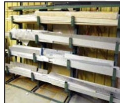
Partial view of raw material inventory available