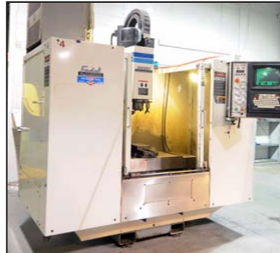
FADAL VMC15RT CNC vertical machining center