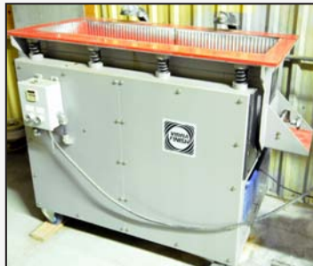
VIBRA FINISH PT5 portable vibratory finishing machine