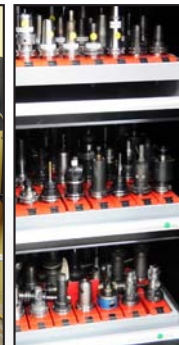
CAT 40 tool holders