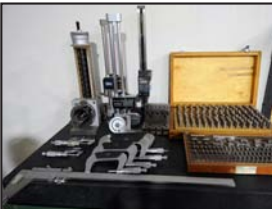
Partial view of inspection equipment available