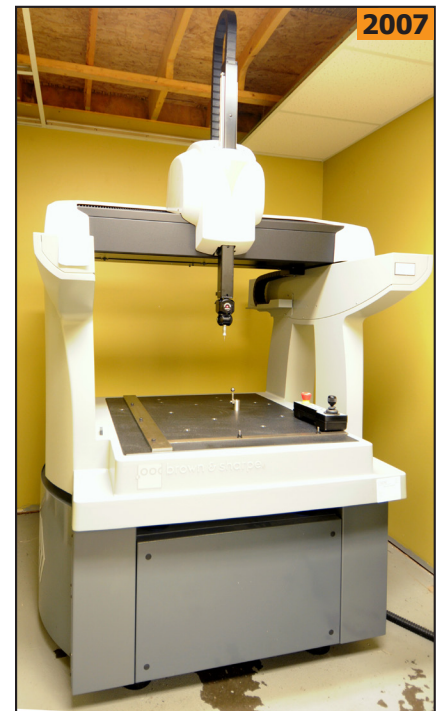
BROWN & SHARPE ONE 7-7-5 CNC CMM