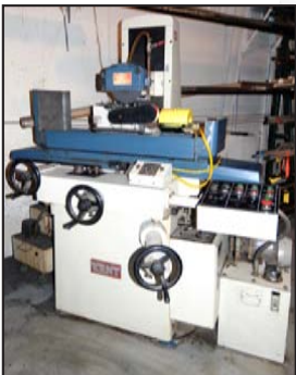
KENT 8" X 18" hydraulic surface grinder

ALSO: (2) 20 ton pneumatic shop presses, drill presses, pedestal grinders, parts w asher, large assortment of tool holders, tool cabinets, collets, pump trucks, fans, office furniture & much more.