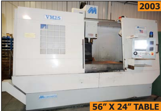
MILLTRONICS VM25 CNC vertical machining center