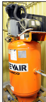
COMAIRCO air compressor