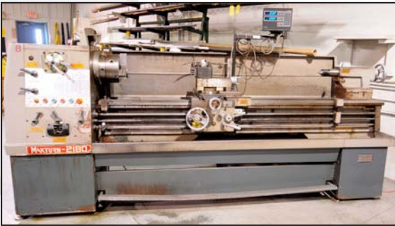
MAXTURN 2180 gap bed engine lathe