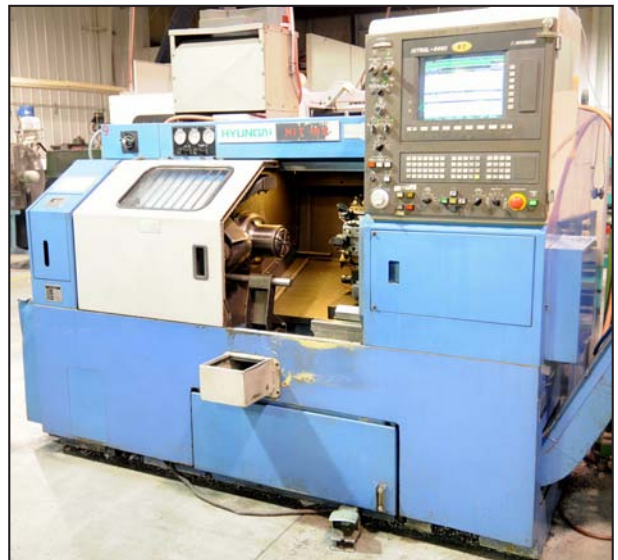
HYUNDAI HIT 18S CNC turning center