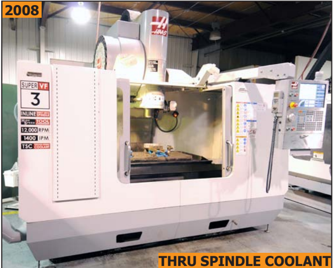
HAAS VF3SS CNC vertical machining center