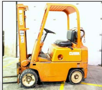
CLARK C500-35 3500 lbs. LPG forklift