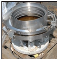
Vibratory bowl feeder