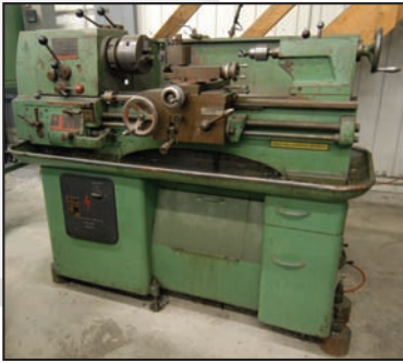
COLCHESTER STUDENT tool room lathe