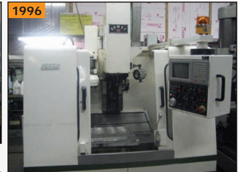
1996 MIGHTY VMC - 500P vertical machining center (Located off-site)