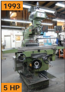
1993 5 HP PRECIMASTER 6KV-FP vertical milling machine