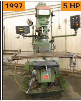
1997 5 HP PRECIMASTER 6 KV-FP vertical milling machine