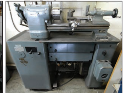
SCHAUBLIM 102 precision speed lathe