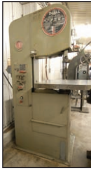
DOALL 1612-0 vertical band saw