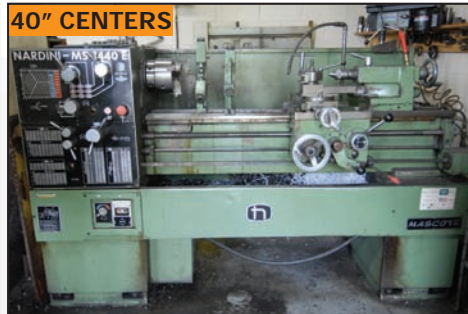
40" CENTERS NARDINI MS-1440 E gap bed engine lathe