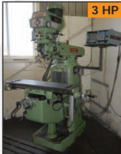
3 HP KONDIA FV-1 vertical milling machine