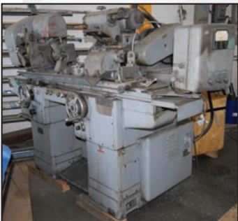
CINCINNATI universal cylindrical grinder