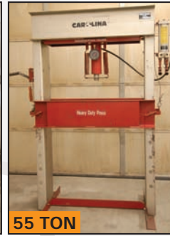
55 TON CAROLINA shop press