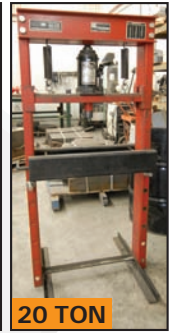
20 TON SHUR-LIFT shop press