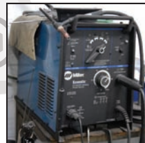
MILLER ECONOTIG CC/AC/DC tig welder