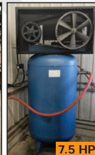
7.5 HP FIERO air compressor