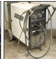
MEMCO 250 mig welder