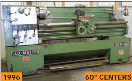
1996 60" CENTERS LUX-MASTER US-1660G gap bed engine lathe