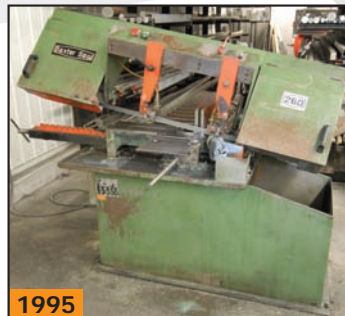
1995 BAXTER 10" horizontal band saw