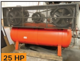
25 HP DEVILBISS air compressor