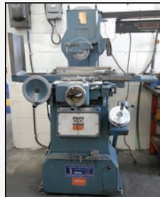
JONES & SHIPMAN 540P hydraulic surface grinder