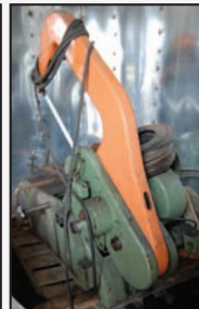
WALTER hack saw