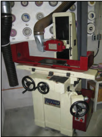
PERFECT hand feed surface grinder with 6"x14" magnetic chuck