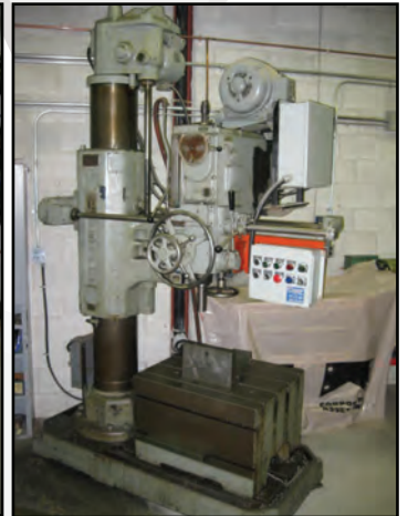
ASQUITH radial arm drill with 3'6" arm, box table