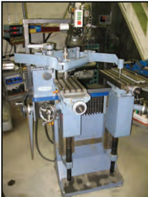
ALEXANDER D380S pantograph