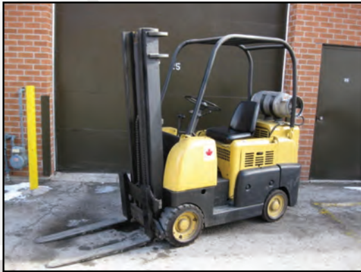
ALLIS CHALMERS F-50PS LPG forklift with 5,000 lbs. lifting capacity, s/n 27104003