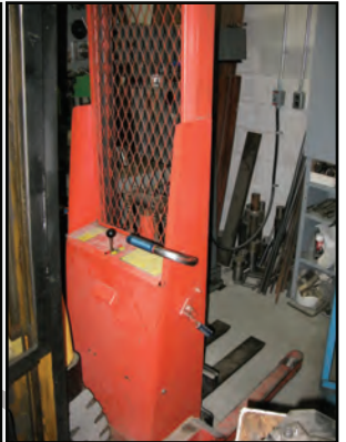
MOBILE LIFT electric die cart