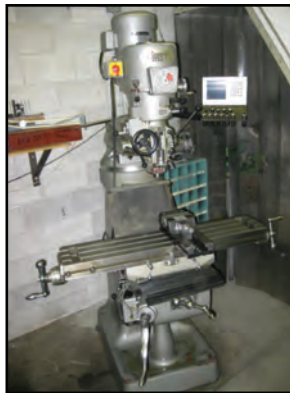
FIRST ram type turret mill with 9"x42" table, 2hp spindle drive, DRO