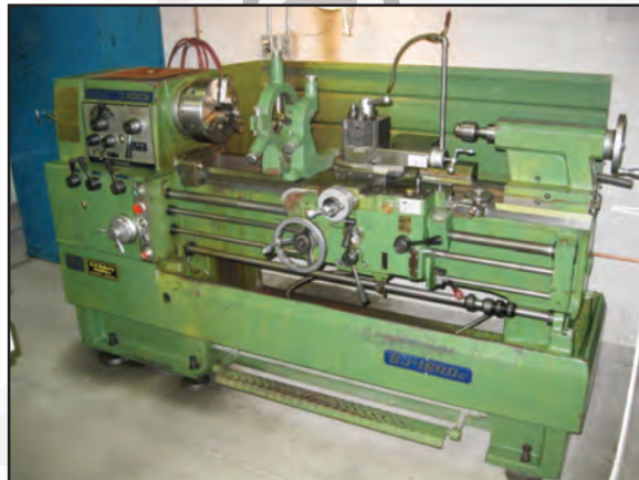
ICOCA SJ-1640G engine lathe with 16" swing x 40" centers, 2.25" spindle bore, s/n 7709010