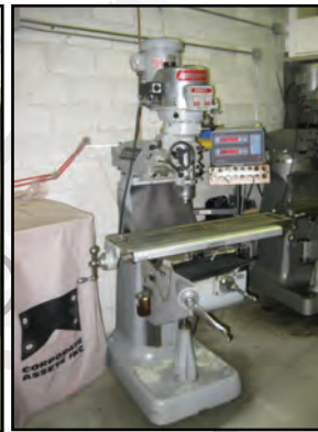
BRIDGEPORT ram type turret mill with 9"x42" table, 2 hp spindle drive, DRO