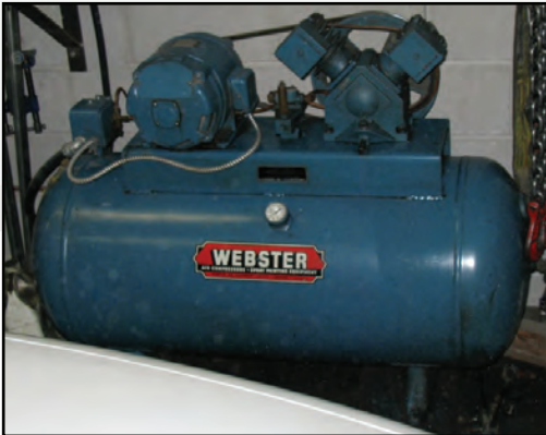
WEBSTER 5hp piston type air compressor