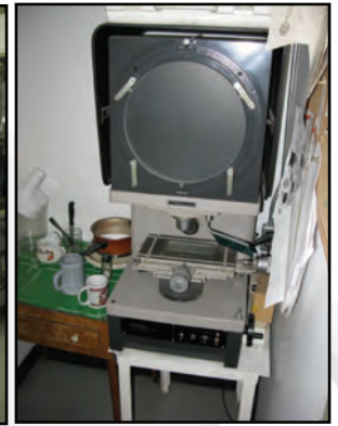
MITUTOYO optical comparator