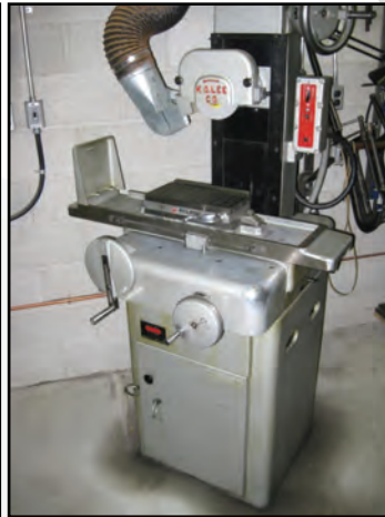
KO LEE hand feed surface grinder with 6"x12" magnetic chuck