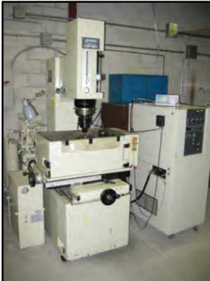
JAPAX DP30 sink type EDM with 3R tooling, 19"x31.5" tank, s/n 05-05-46T