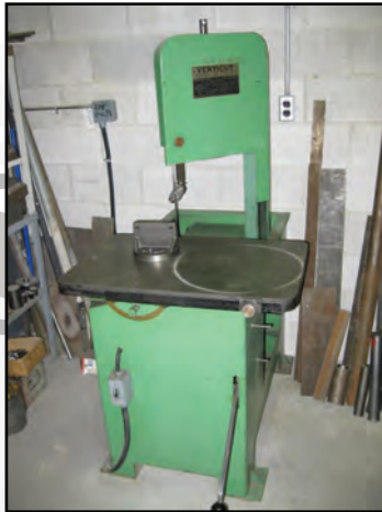
VERTICUT roll in bandsaw