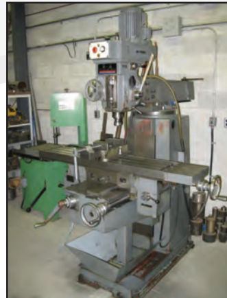
TOS FNK 25 vertical mill with power feed, s/n 25001