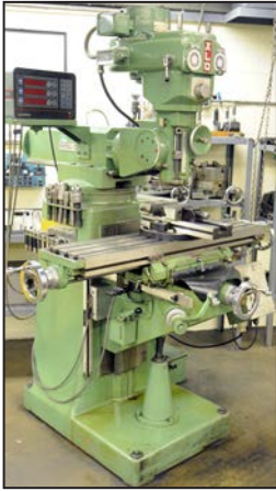
EXCELLO milling machine