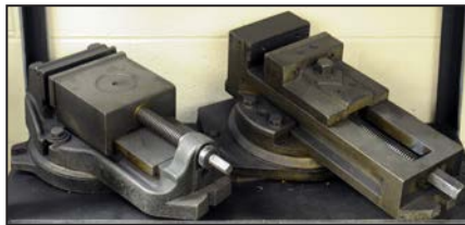
6" machine vises available