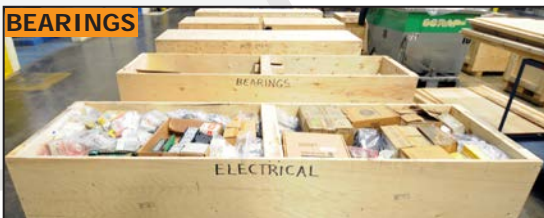
Partial view of spare parts and bearings available