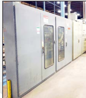
Large selection of AB PLC control cabinets available