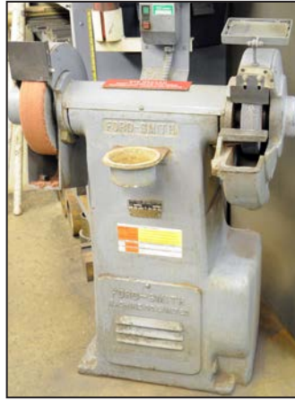
FORD SMITH 12" HD grinder