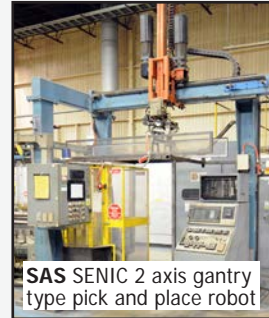
SAS SENIC 2 axis gantry type pick and place robot