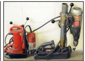
Magnetic base drills available