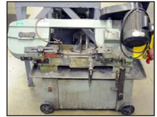
CII RF712 horizontal tilt head band saw