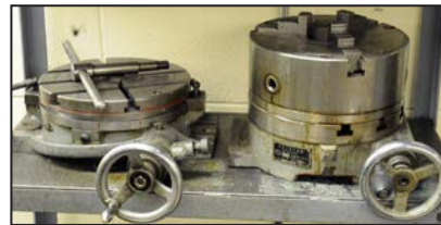
Rotary indexing tables available