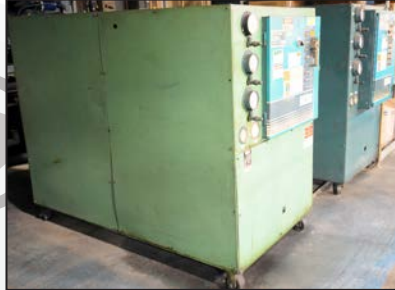
View of BERG 15 ton self contained chillers available