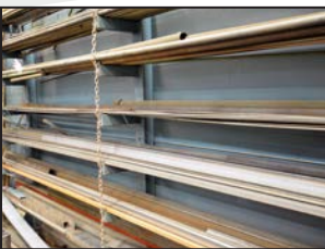
Partial view of raw material available