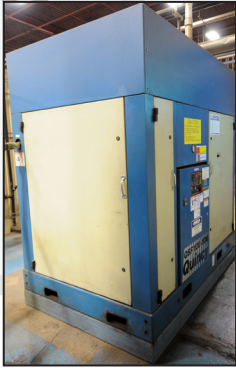
QUINCY QSF 100-100HP screw type air compressor