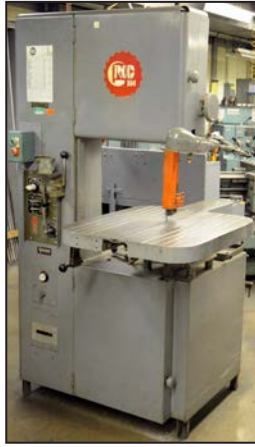
GROB vertical band saw