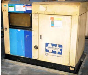
INGERSOLL RAND PAC-AIR 50 50HP screw type air compressor