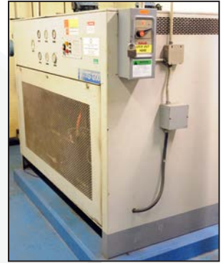
TG AIR 1500A refrigerated air dryer