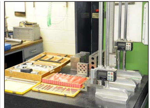
Partial view of inspection equipment available