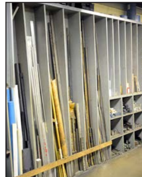
Partial view of raw material stock available