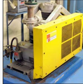
TG AIR T-30 20HP (3) stage piston type vacuum pump