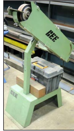
BEE belt sander