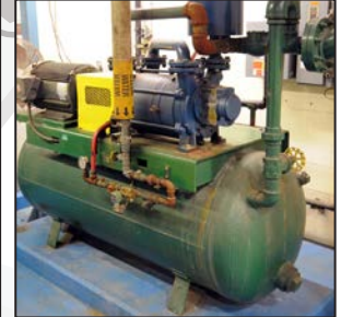
SIEMENS AND HITCH 25HP rotary screw type vacuum pump