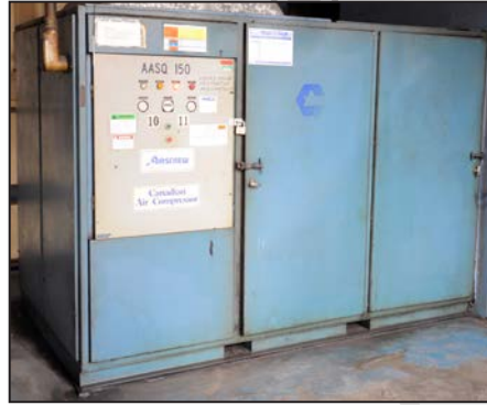
AIRSCREW 150HP screw type air compressor