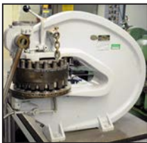
ROTEX 18A53 bench type turret punch