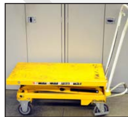
600 lbs hydraulic scissor lift table