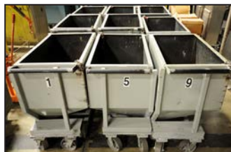
Partial view of rolling bins available