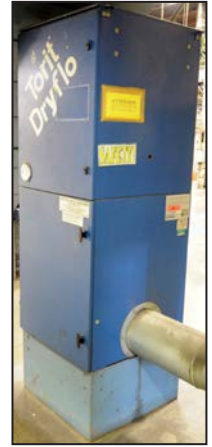
TORRIT 3 HP dust collector