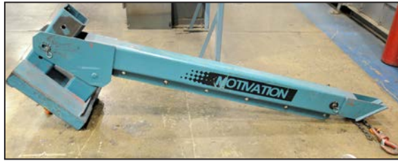
MOTIVATION forklift boom attachment