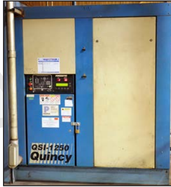
QUINCY QSI 1250 250HP screw type air compressor