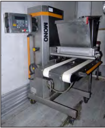
MONO FG077-F20R drop type depositor