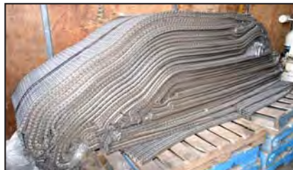
Stainless steel belt conveyors