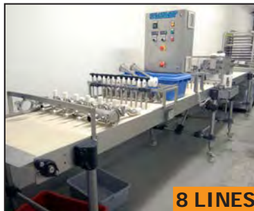
ITALPAST pre-cooked cannelloni production line