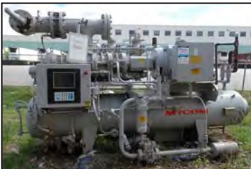
MYCOM spiral air compressor