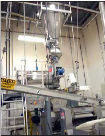
TORESANI pre-mix and extruder