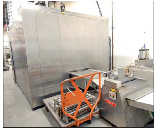
TORESANI pasta cutter with dies and 20ft pass through cooler and conveyor