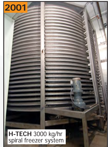
H-TECH 3000 kg/hr spiral freezer system