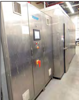
COLDSTREAM 20' pass-through cooler and ITALPAST PLC controls