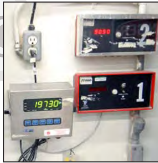
View of PLC control & load cells