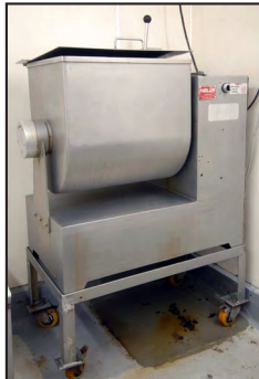
NELLA stainless steel batch mixer