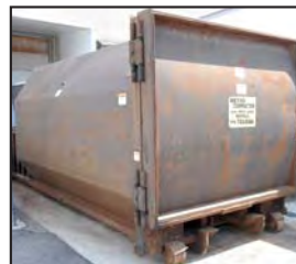
GLOBAL E 10-60 compactor