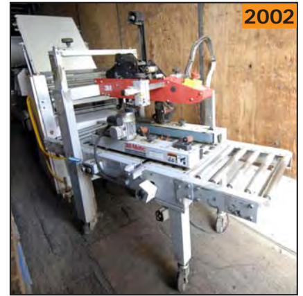
3M-MATIC 120A adjustable case sealer