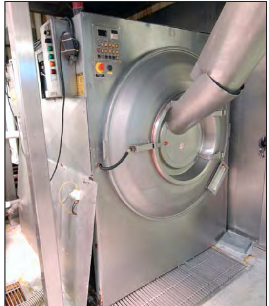
CLEVELAND bagged sauce chiller and ice box