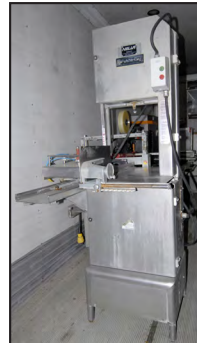
BUTCHER BOY meat saw