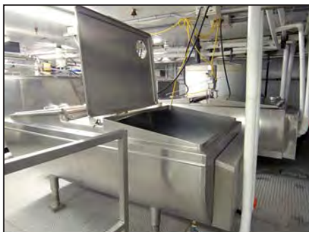
Partial view of holding tanks available