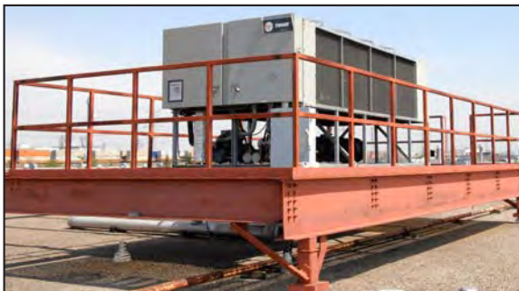
TRANE 30GT060-6 roof-mounted air-cooled chiller