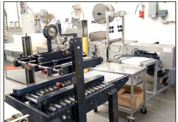
CHAMPION 700-20 case sealer