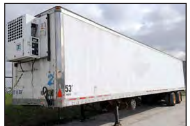
View of refrigerated trailer