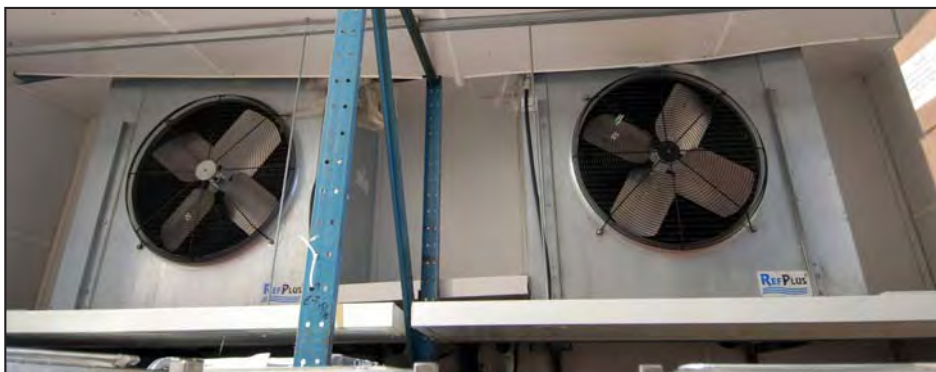
REFPLUS blast freezer condenser units