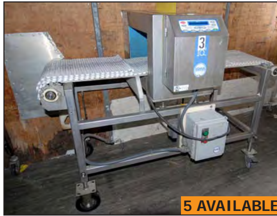
LOMA IQ2 pass-through metal detectors