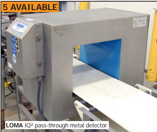
LOMA IQ² pass-through metal detector