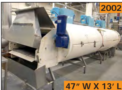
CARDOX ULTRA FREEZE flash freezing tunnel