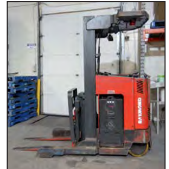
RAYMOND EASI R30TT electric reach truck