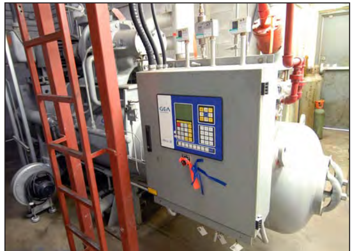
GEA FES system ammonia compressor for H-TECH spiral freezer