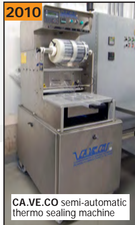
CA.VE.CO semi-automatic thermo sealing machine