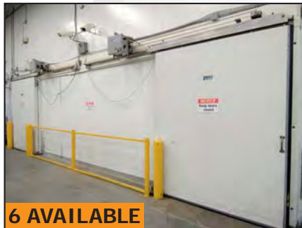
CLARK automatic door systems