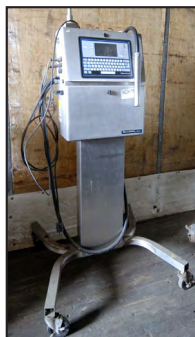
VIDEOJET coding machine