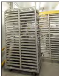
Large quantity of baking racks available