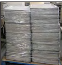
Large quantity of baking trays available