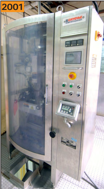
CRYOVAC RC2045B liquid form, fill and seal machine