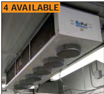
REFPLUS LSA3900 refrigeration unit coolers