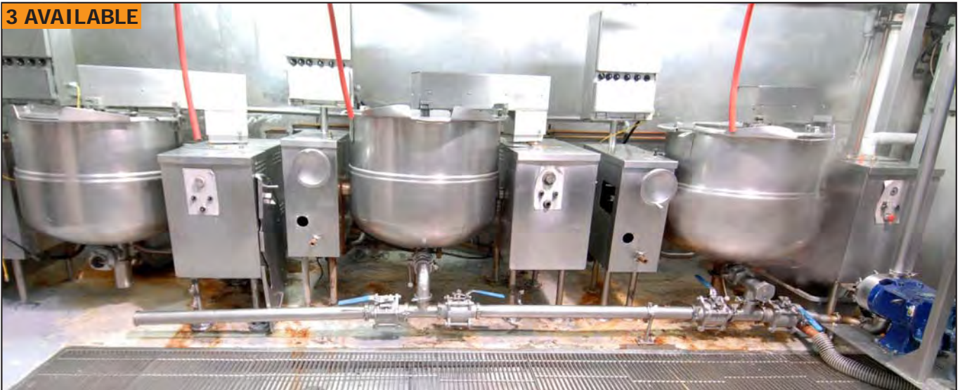
100-gallon steam JACKETED kettles with scrapers & pneumatic agitator tilt