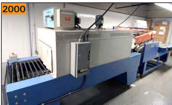
2000 POWER PACKAGING & EQUIPMENT TY 702-120 packaging line