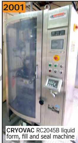
CRYOVAC RC2045B liquid form, fill and seal machine