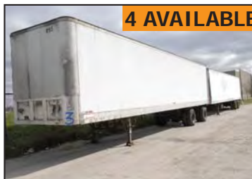
View of 45' trailer