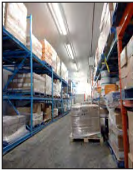
View of 60' X 20' white panel box cooler