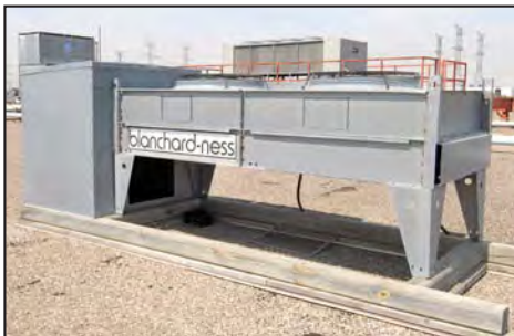
BLANCHARD NESS condensers