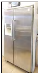
True S/S cooler