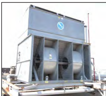
BALTIMORE AIR COIL roof-mounted chiller