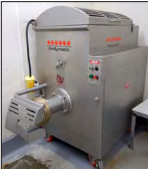
HOLLYMATIC stainless steel mixer/grinder