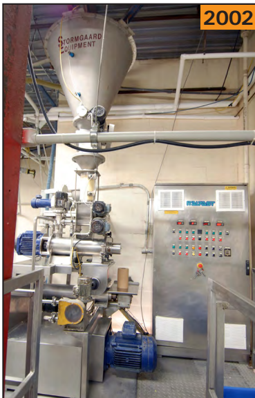
STORMGAARD feed hopper and ITALPAST extruder pre-mixer