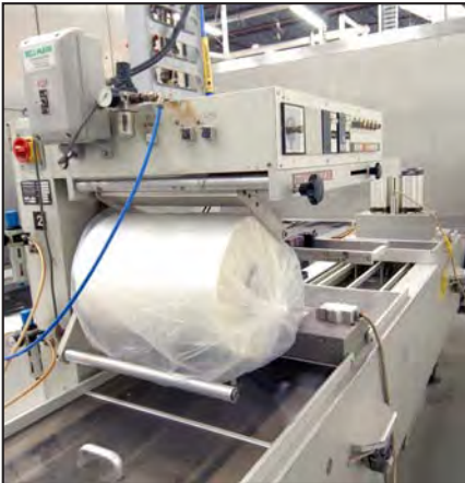
MULTIVAC vacuum packaging machine with label applicator