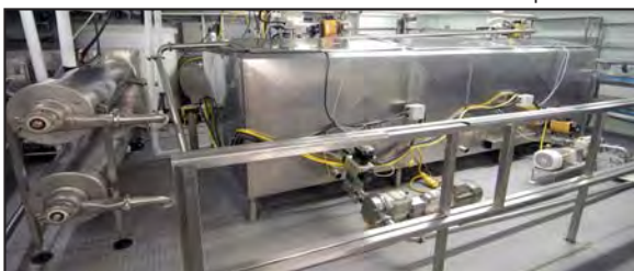
CHERRY BURRELL 672S THERMUTATOR