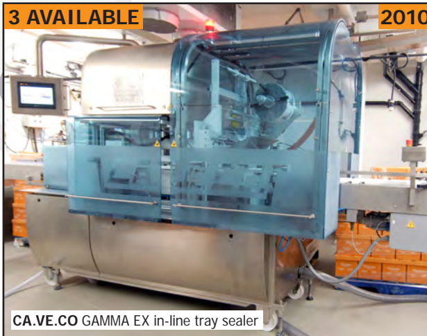
CA.VE.CO GAMMA EX in-line tray sealer