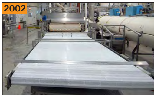
View of exit conveyor