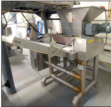
AGNELLI stainless steel single sheeter