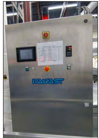
View of PLC control