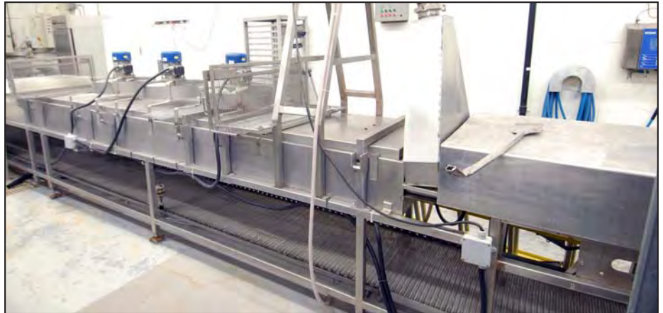
ITALPAST compact pass-through pasteurizer