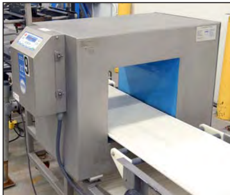
LOMA IQ² pass-through metal detector