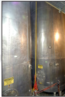
19,000 kg. stainless steel storage silos