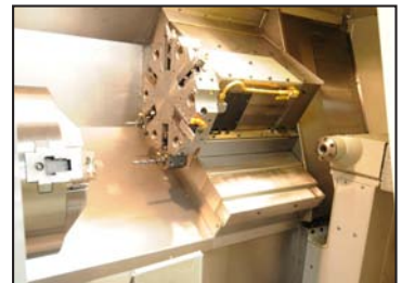
Interior view of HAAS SL 30TB