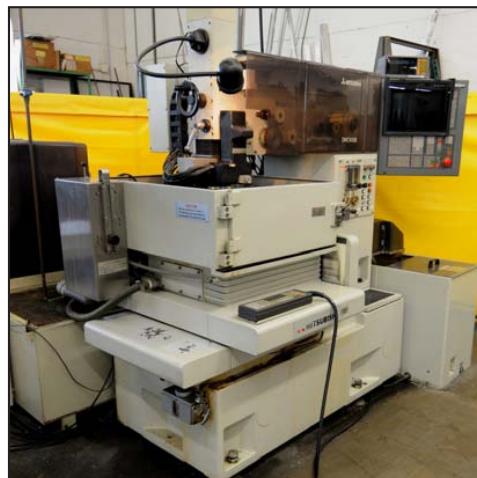
MITSUBISHI DWC 90SB CNC wire EDM