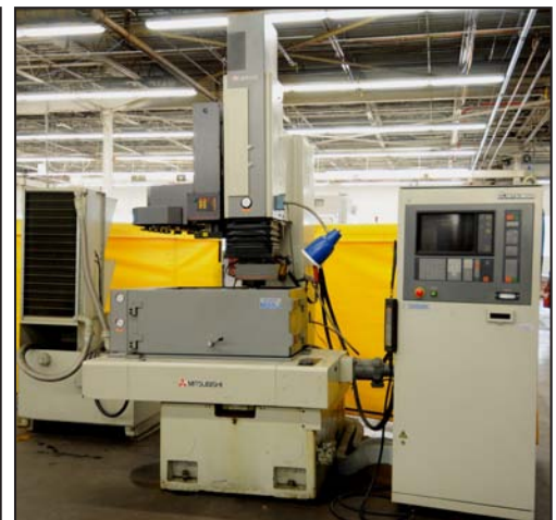
MITSUBISHI M35J CNC sinker EDM