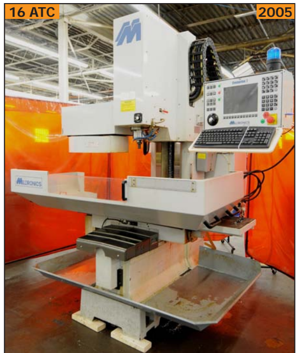
MILLTRONICS RH19 CNC vertical machining center