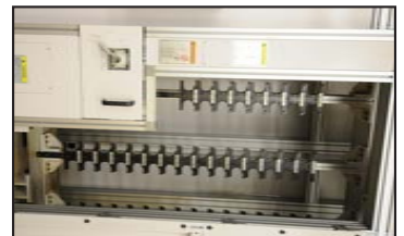
View of tool carousel