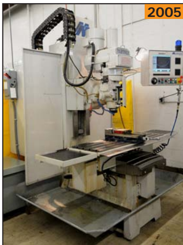
MILLTRONICS PARTNER MB19 CNC vertical milling machine